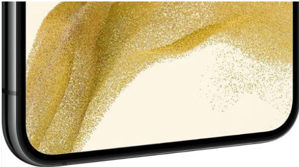
Figure 3.2.1: Side view of the Samsung Galaxy S22+ indicating the SIM card tray.