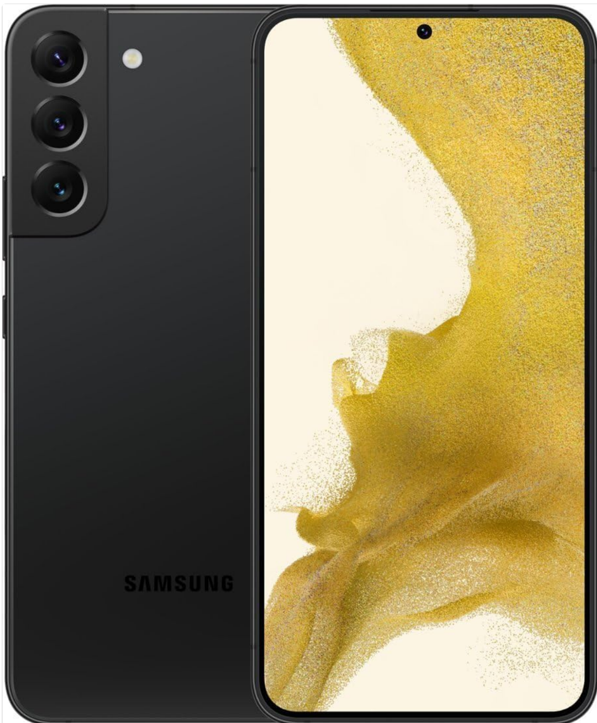
Figure 9.1.1: Front and back view of the Samsung Galaxy S22+.