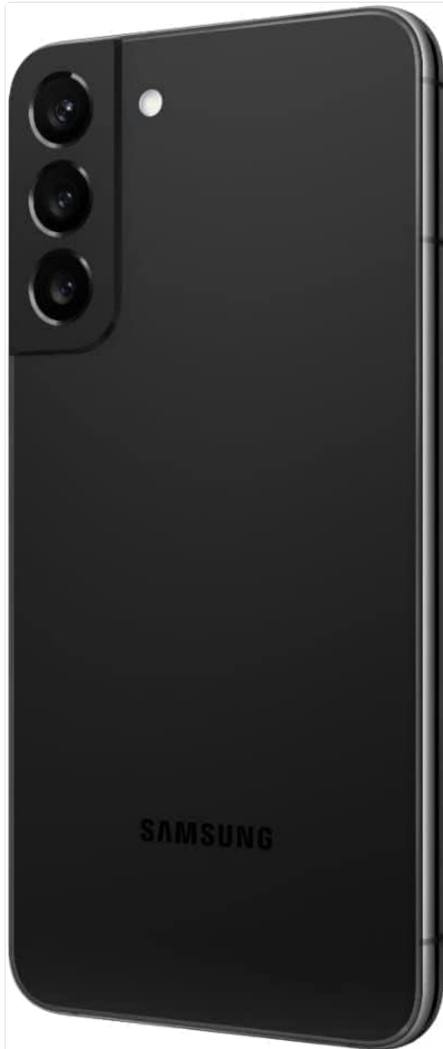
Figure 5.1.1: Rear camera module of the Samsung Galaxy S22+.

The Samsung Galaxy S22+ is equipped with a powerful triple-lens rear camera system and a high-resolution front camera, designed to capture stunning photos and videos in various conditions.