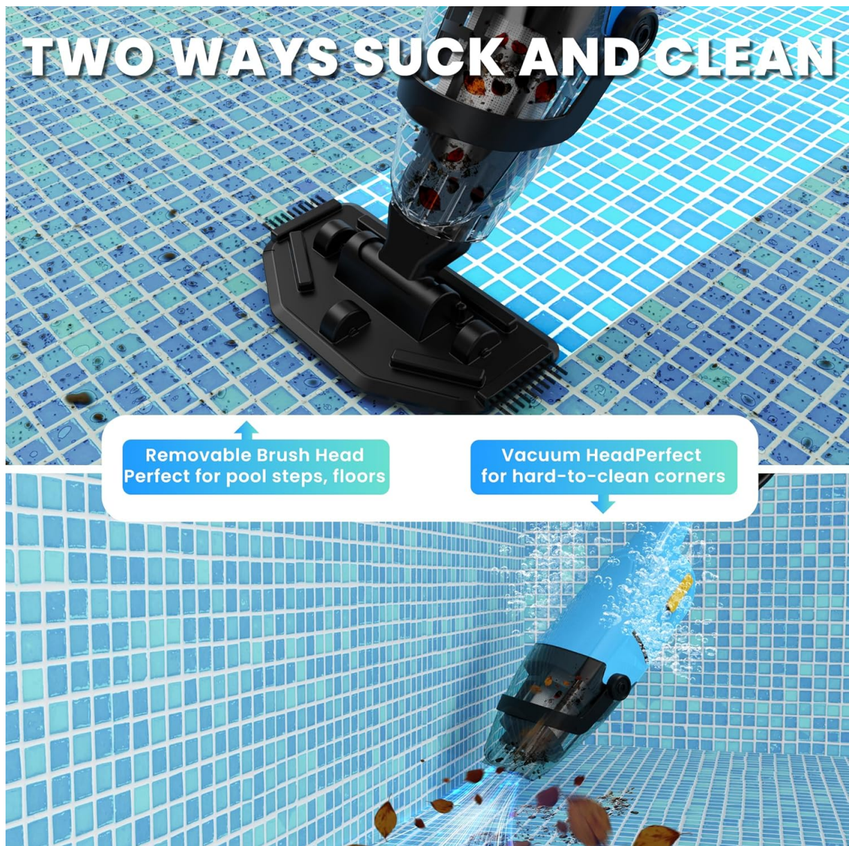
Figure 3: The vacuum offers versatile cleaning with a removable brush head for large areas and a direct vacuum head for tight corners.