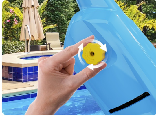
Figure 5: The vacuum is designed for comprehensive cleaning of all pool surfaces.

Rotary switch operation. Turn the unit on and you are ready to vacuum as you do on the floor.