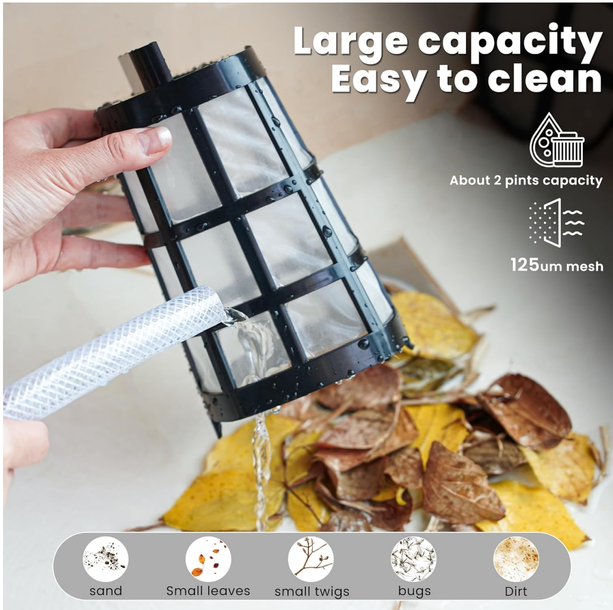
Figure 7: The large capacity filter bag is easy to clean and effectively captures various types of debris.