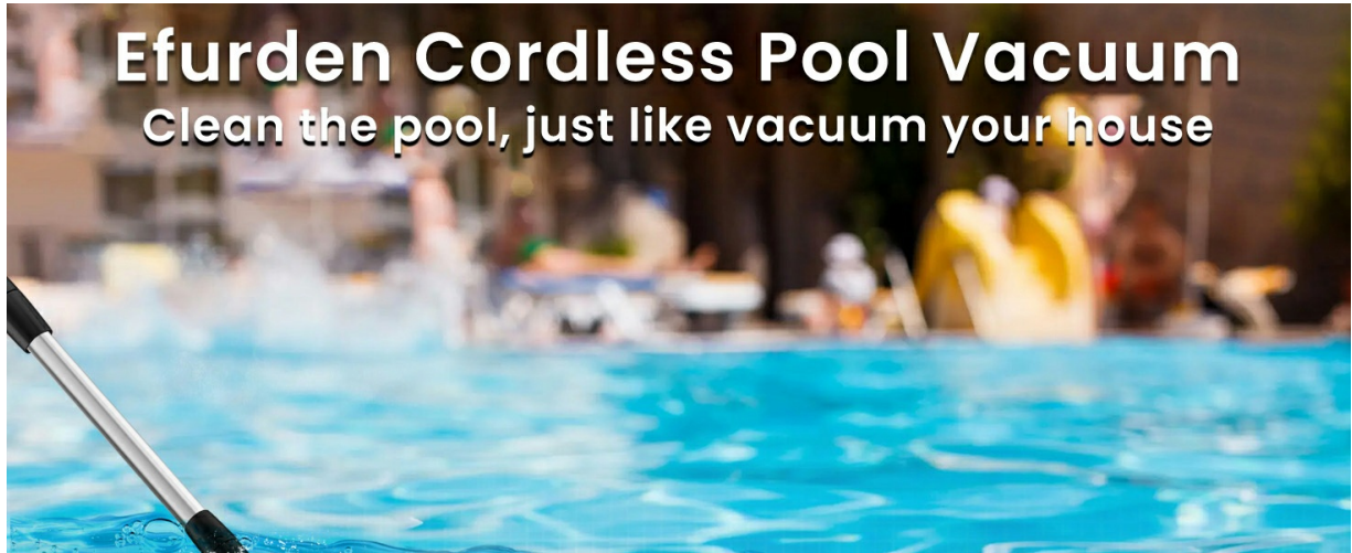
Figure 1: The EFURDEN Cordless Pool Vacuum Cleaner in action, designed for easy pool cleaning.

The EFURDEN Cordless Handheld Pool Vacuum Cleaner (Model EDHV01) is designed for efficient and convenient cleaning of various pool types, including above-ground pools, in-ground pools, spas, and hot tubs. Its cordless and rechargeable design eliminates the need for hoses or power cords, offering enhanced maneuverability and ease of use for spot cleaning or routine maintenance.