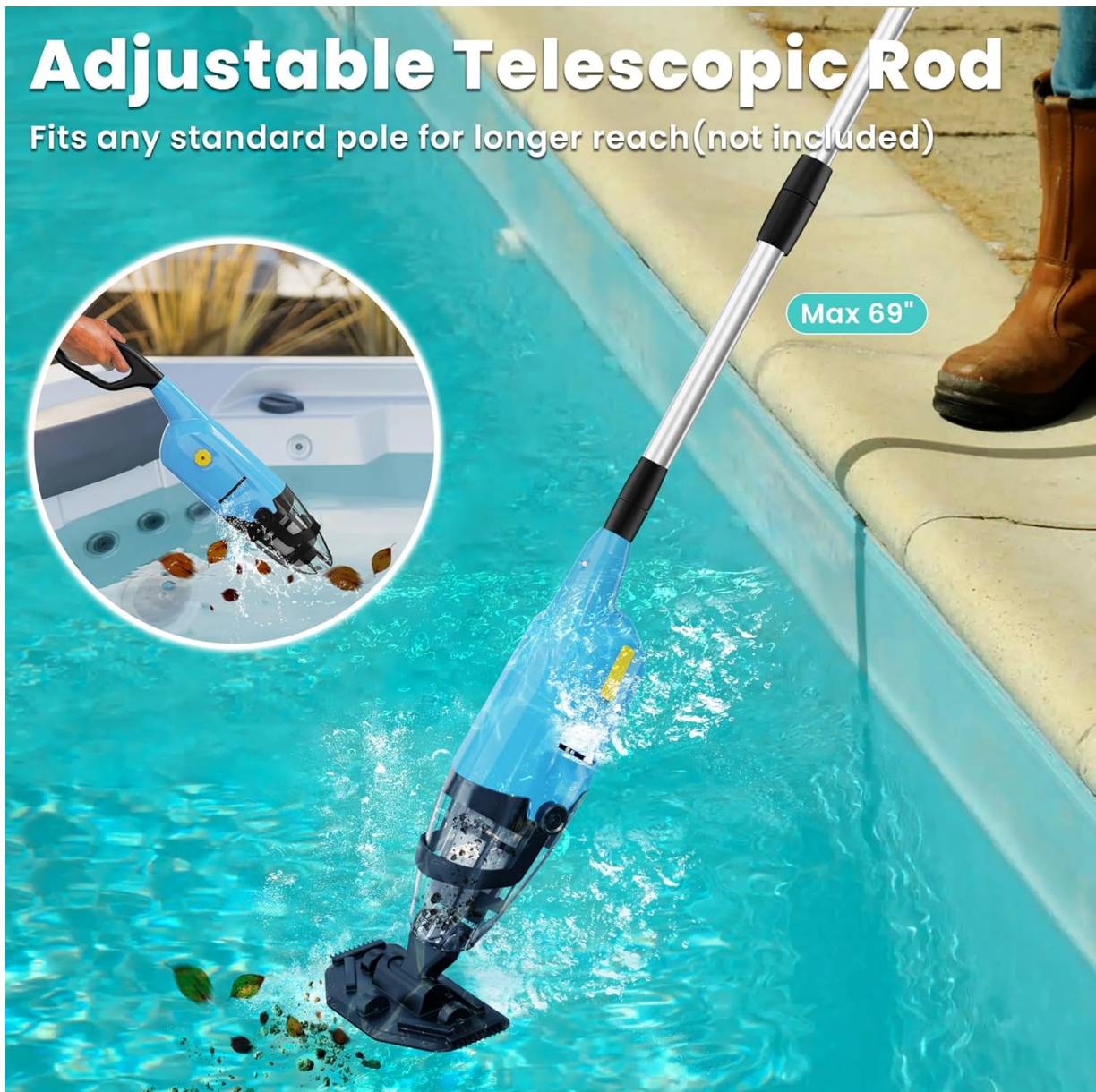
Figure 4: The adjustable telescopic rod provides extended reach for various pool and spa sizes.

Fits any standard pole for longer reach (not included)