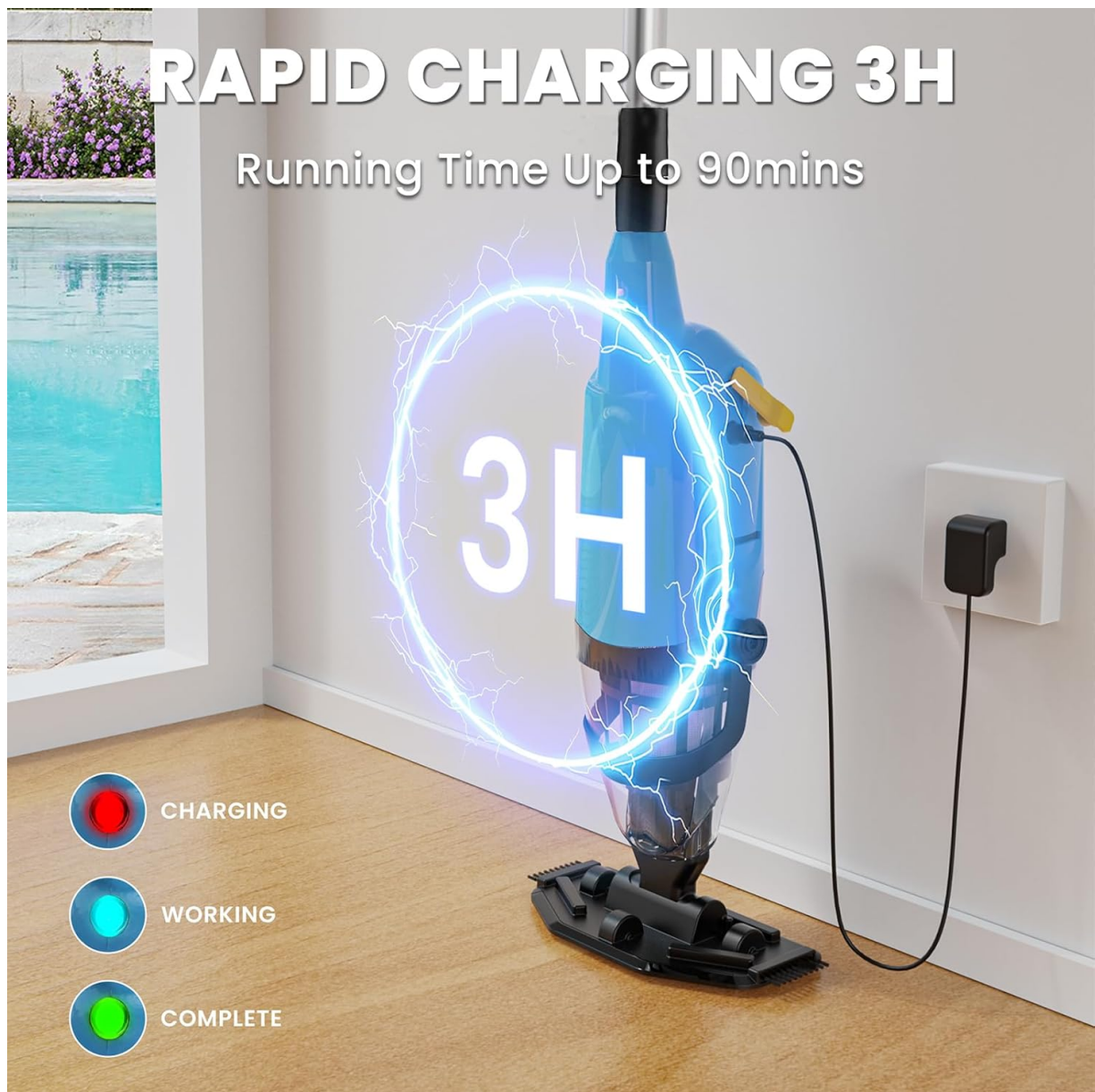
Figure 8: The vacuum features rapid charging, reaching full capacity in 3 hours for up to 90 minutes of use.