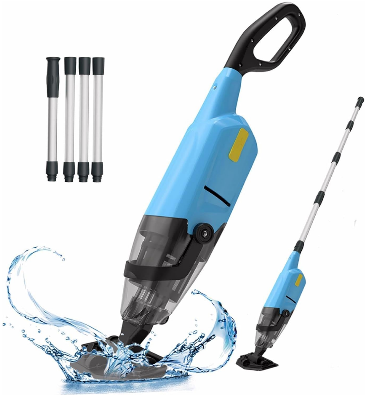
Figure 2: Main components of the EFURDEN Cordless Handheld Pool Vacuum Cleaner.