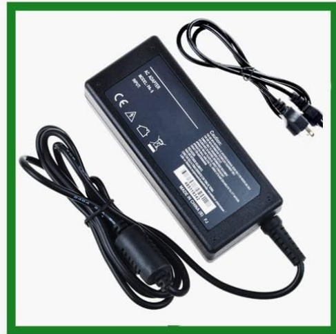
Image: Multiple views of the Jantoy AC/DC Adapter, illustrating its compact design and cable connections.