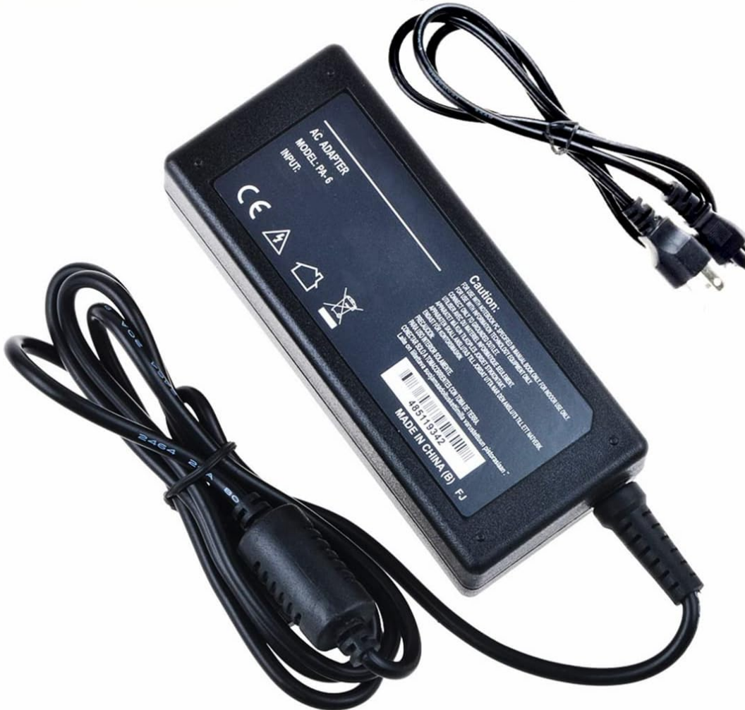
Image: A detailed view of the AC/DC adapter, emphasizing its advanced internal components and high-quality materials for improved performance and durability.

Antioxidant and corrosion Energy-saving transmission Long service life