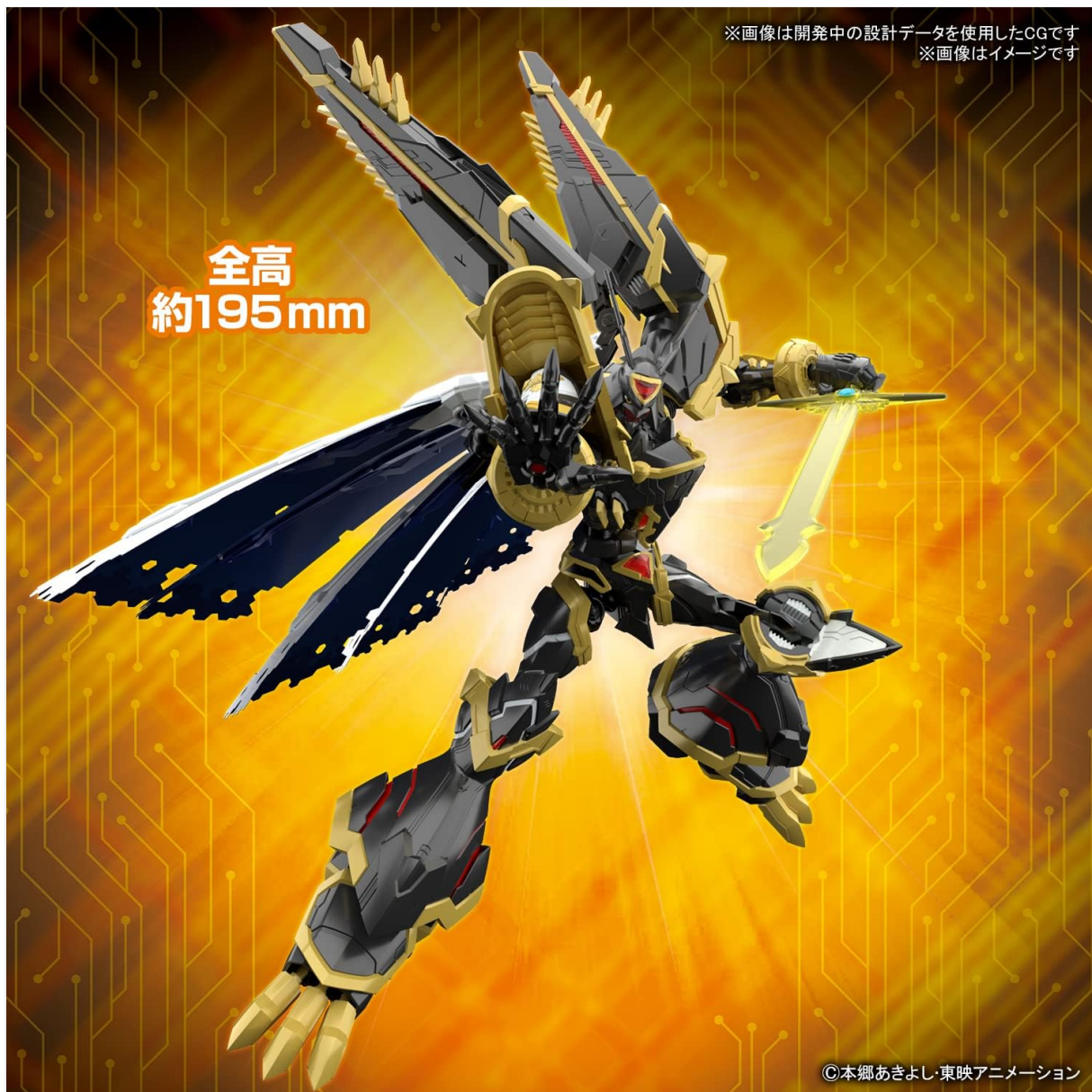
Image: Alphasaur in a dynamic pose, demonstrating articulation.