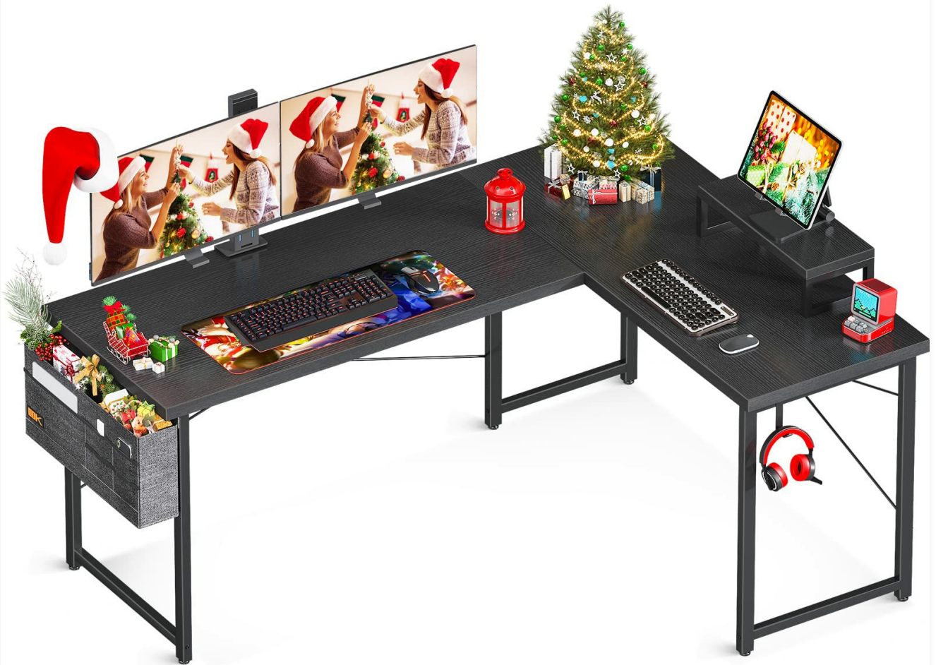
Image: The ODK L-shaped corner desk set up in a modern room, featuring two monitors on the main surface and a laptop on the monitor shelf. The desk includes a side storage bag and a headphone hook.