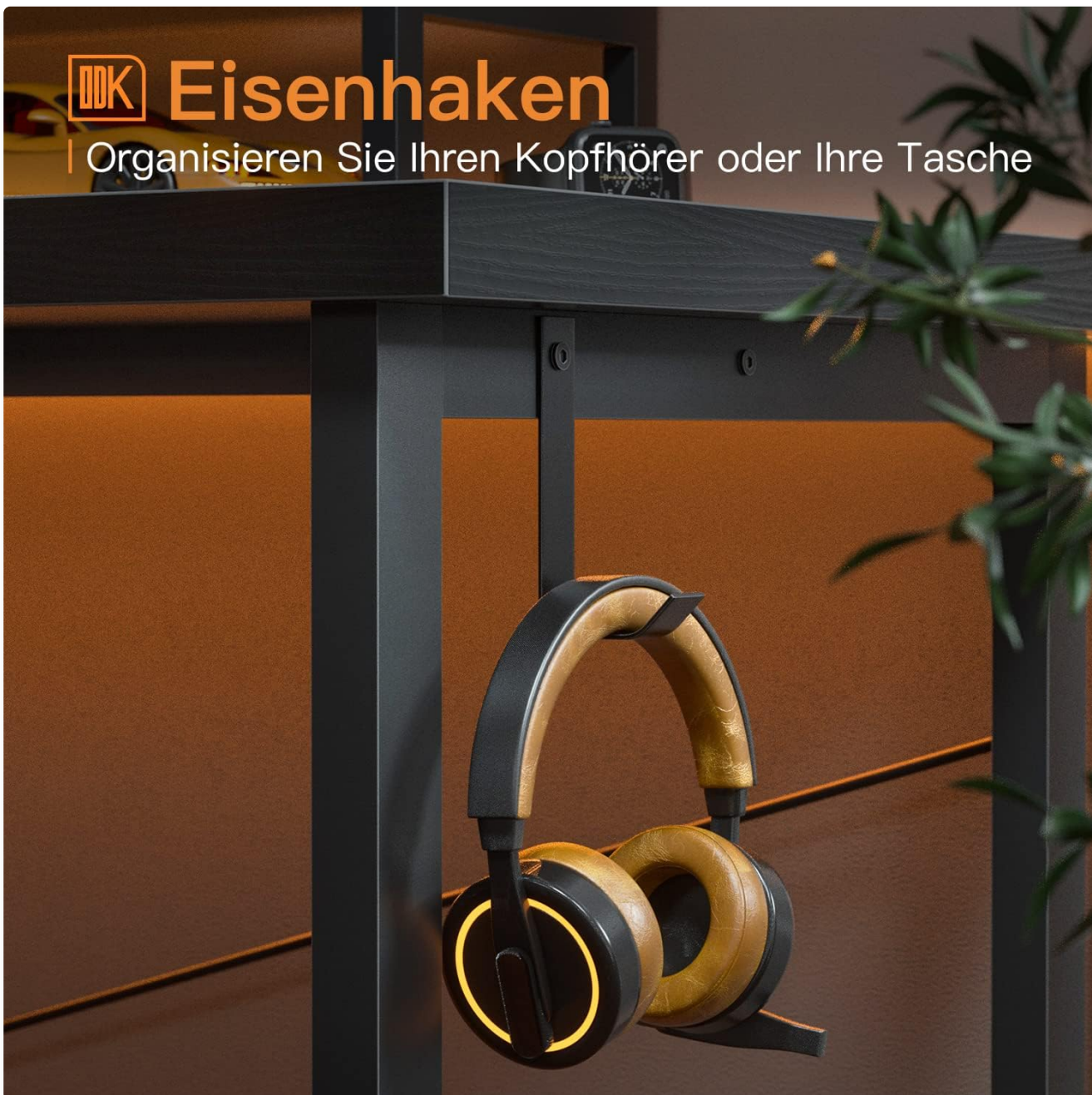
Image: This image highlights the convenient iron hook attached to the desk frame, designed for hanging headphones or bags, keeping the workspace tidy.

| Organisieren Sie Ihren Kopfhörer oder Ihre Tasche