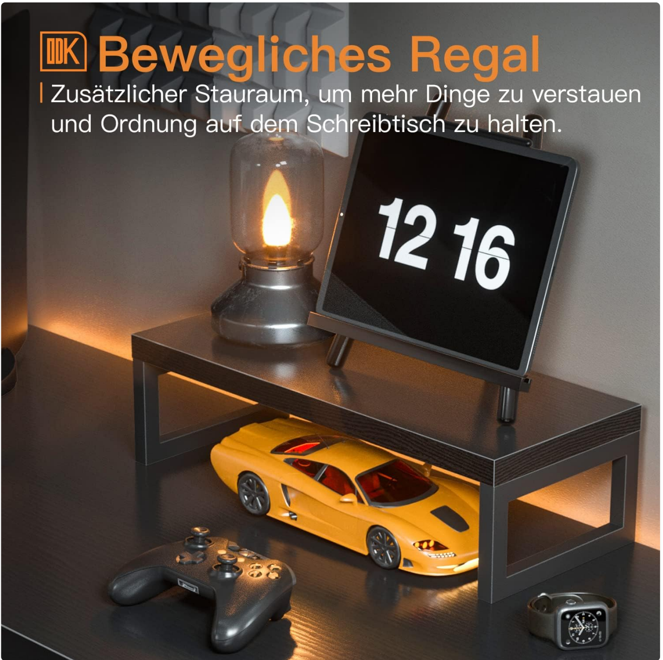
Image: A detailed view of the movable monitor shelf, providing additional storage space for small items like a clock, a lamp, or decorative objects, helping to organize the desktop.

| Zusätzlicher Stauraum, um mehr Dinge zu verstauen und Ordnung auf dem Schreibtisch zu halten.