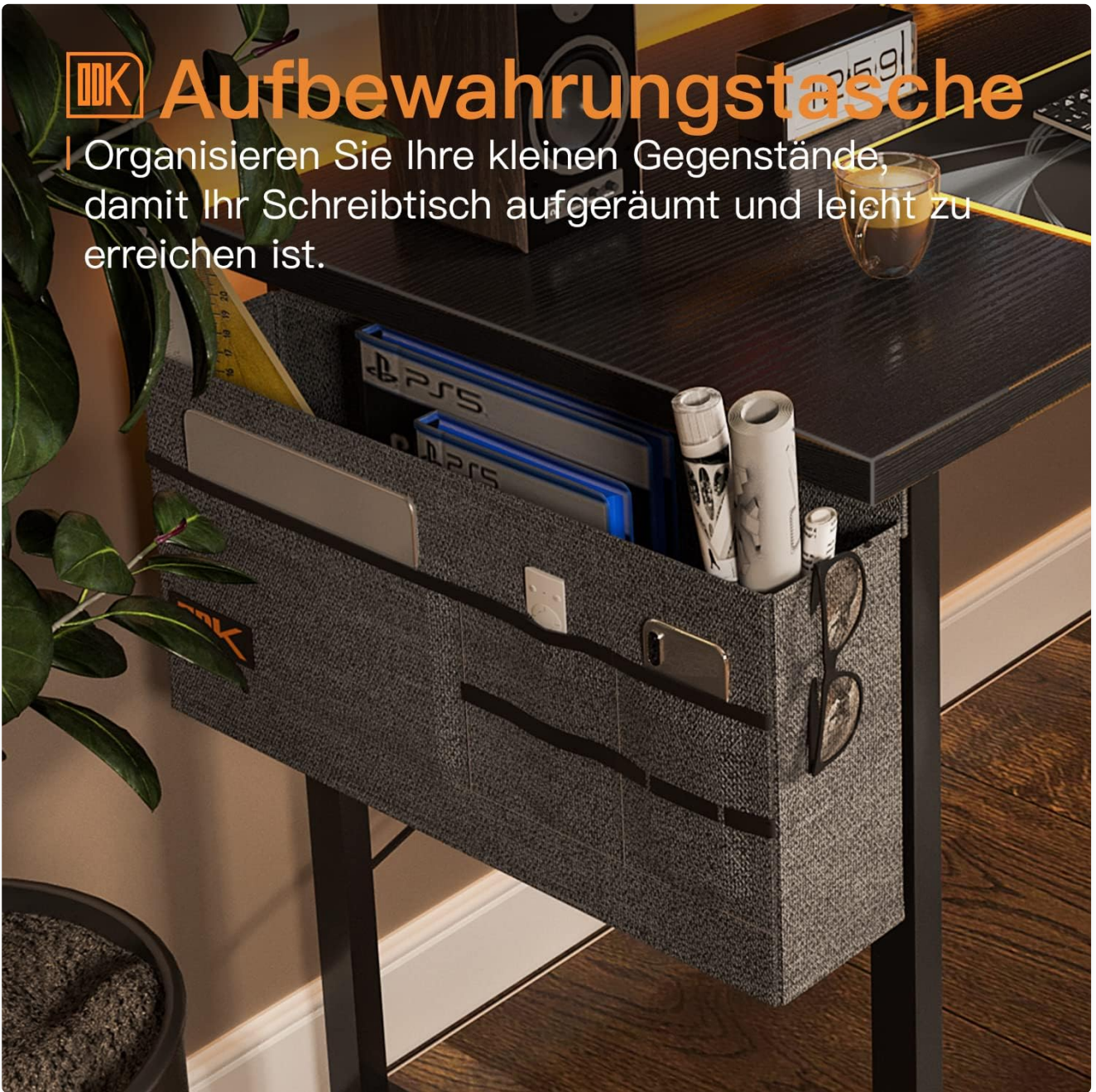
Image: This image displays the fabric storage bag attached to the side of the desk, offering practical storage for books, documents, glasses, and other small accessories, keeping them within easy reach.

Organisieren Sie Ihre kleinen Gegenstände, damit Ihr Schreibtisch aufgeräumt und leicht zu erreichen ist.