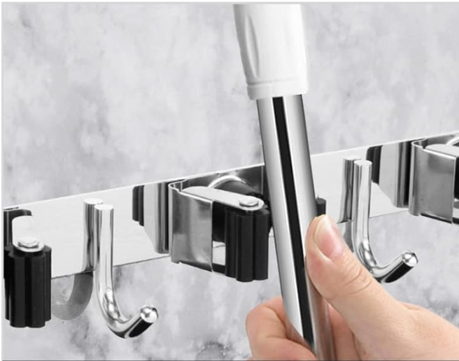
Easy to hang and take