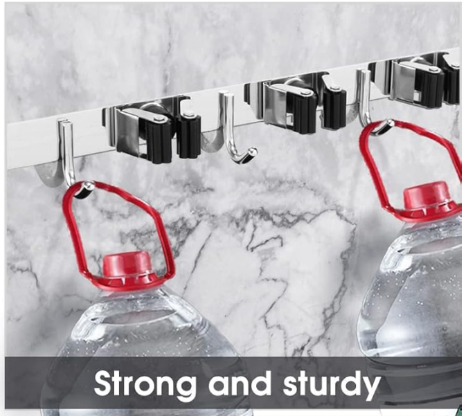
Strong and sturdy