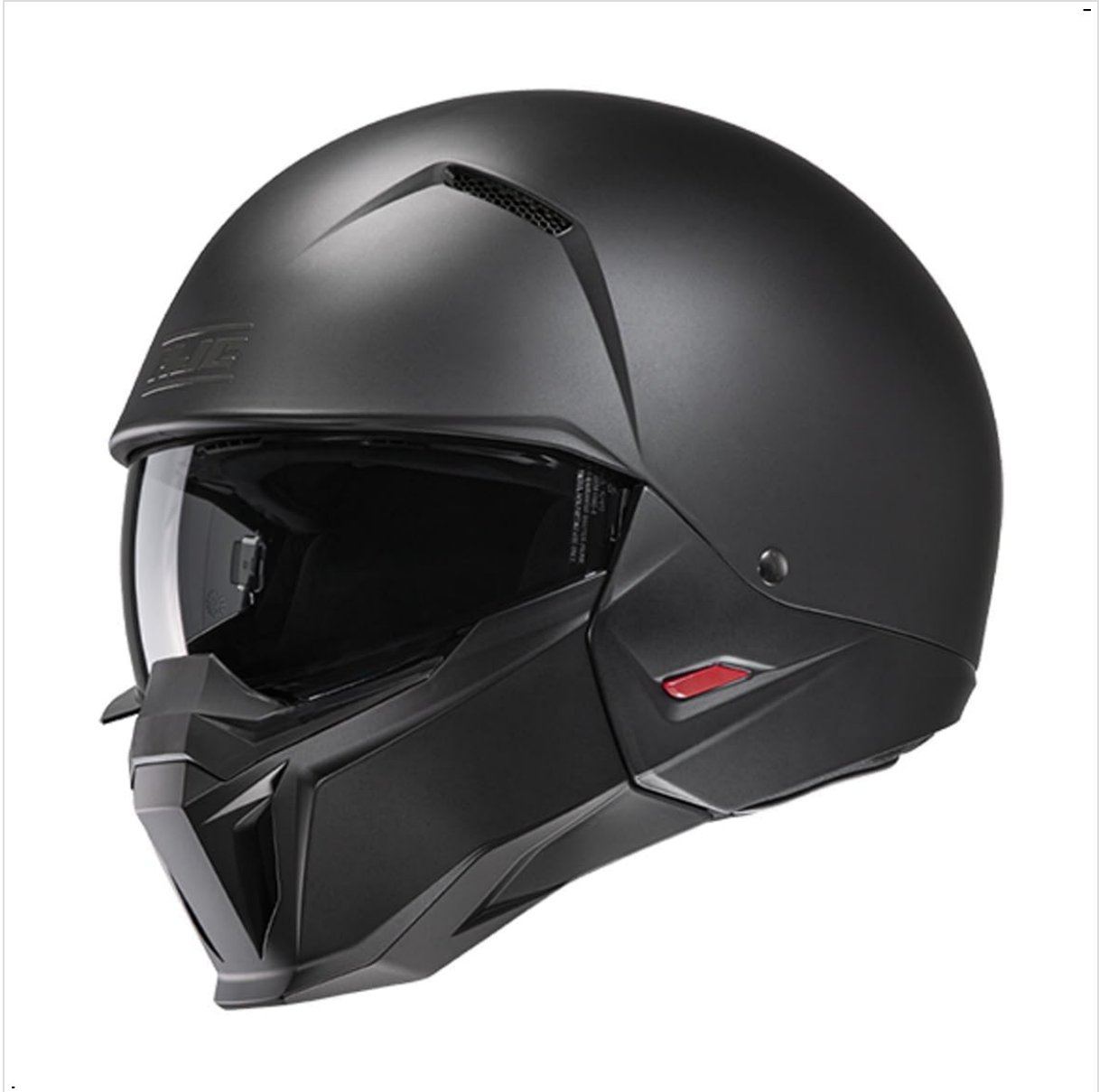
Image of the HJC i20 helmet in Semi Flat Black, shown with the front mask and external visor in the closed position.

The HJC i20 is an open-face motorcycle helmet featuring a detachable front mask, an internal sun shield, and an advanced ventilation system. It is designed for adult riders seeking a versatile and protective helmet.