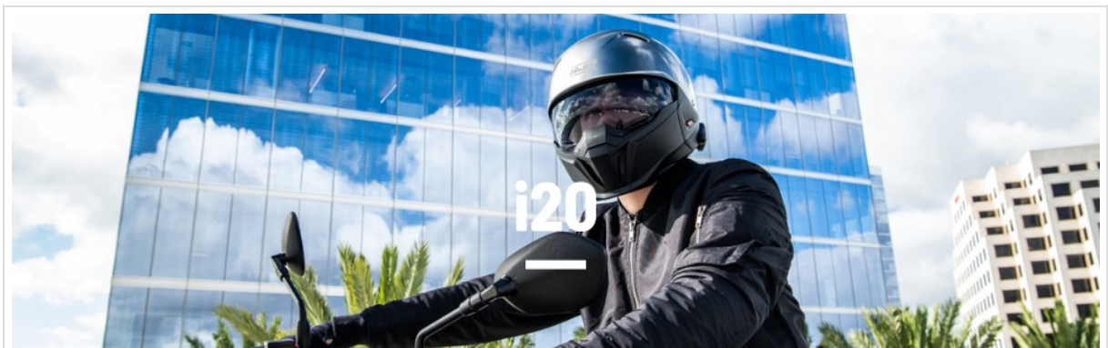
Image depicting a rider wearing the HJC i20 helmet, highlighting its appearance in use.