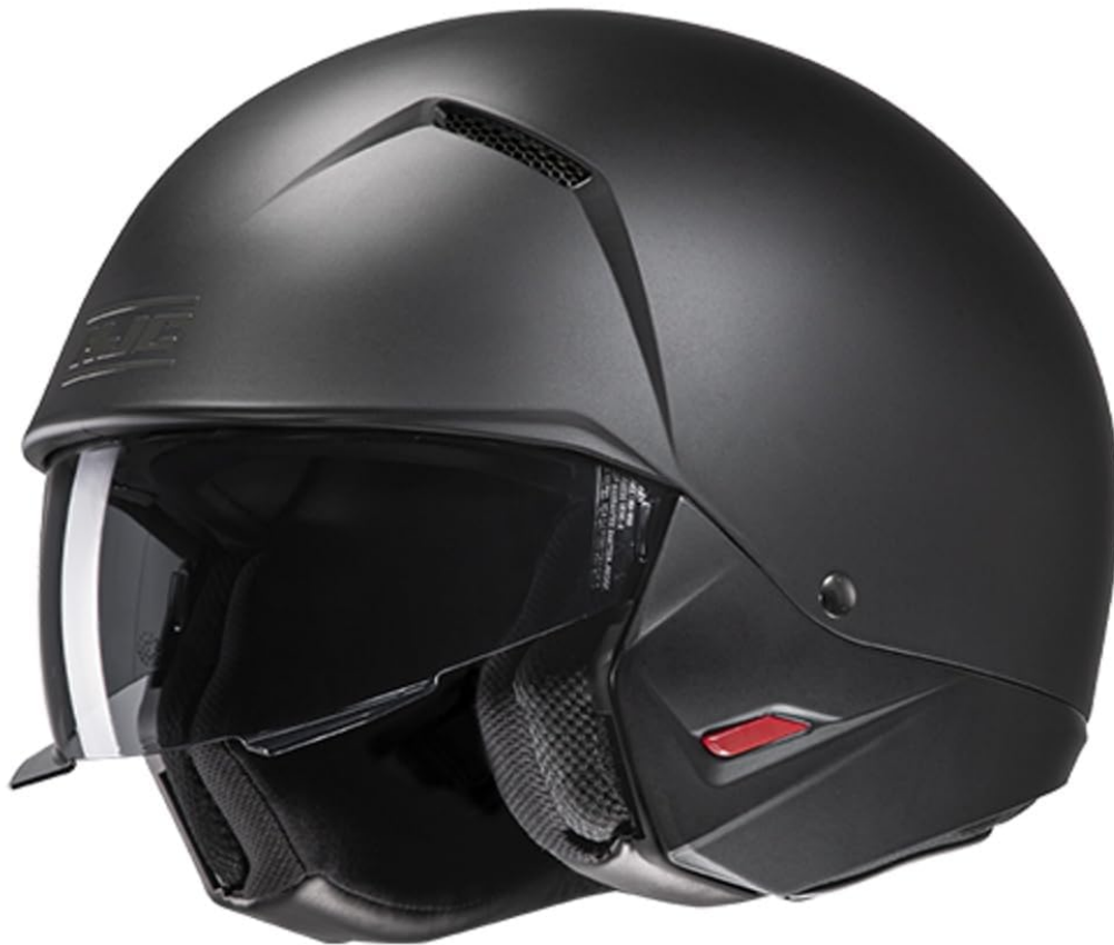
Image of the HJC i20 helmet with the front mask detached, showing the open-face configuration and the main visor in an upward position.