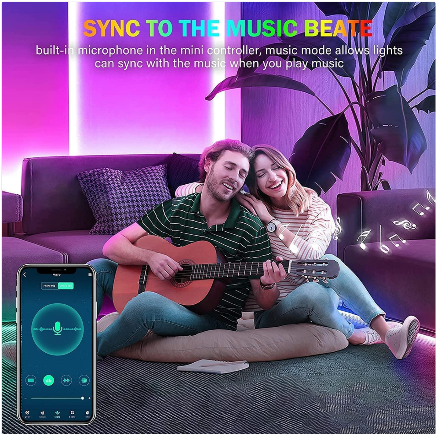
Image: LED strip lights displaying colors that synchronize with music, creating an immersive audio-visual experience.

built-in microphone in the mini controller, music mode allows lights can sync with the music when you play music