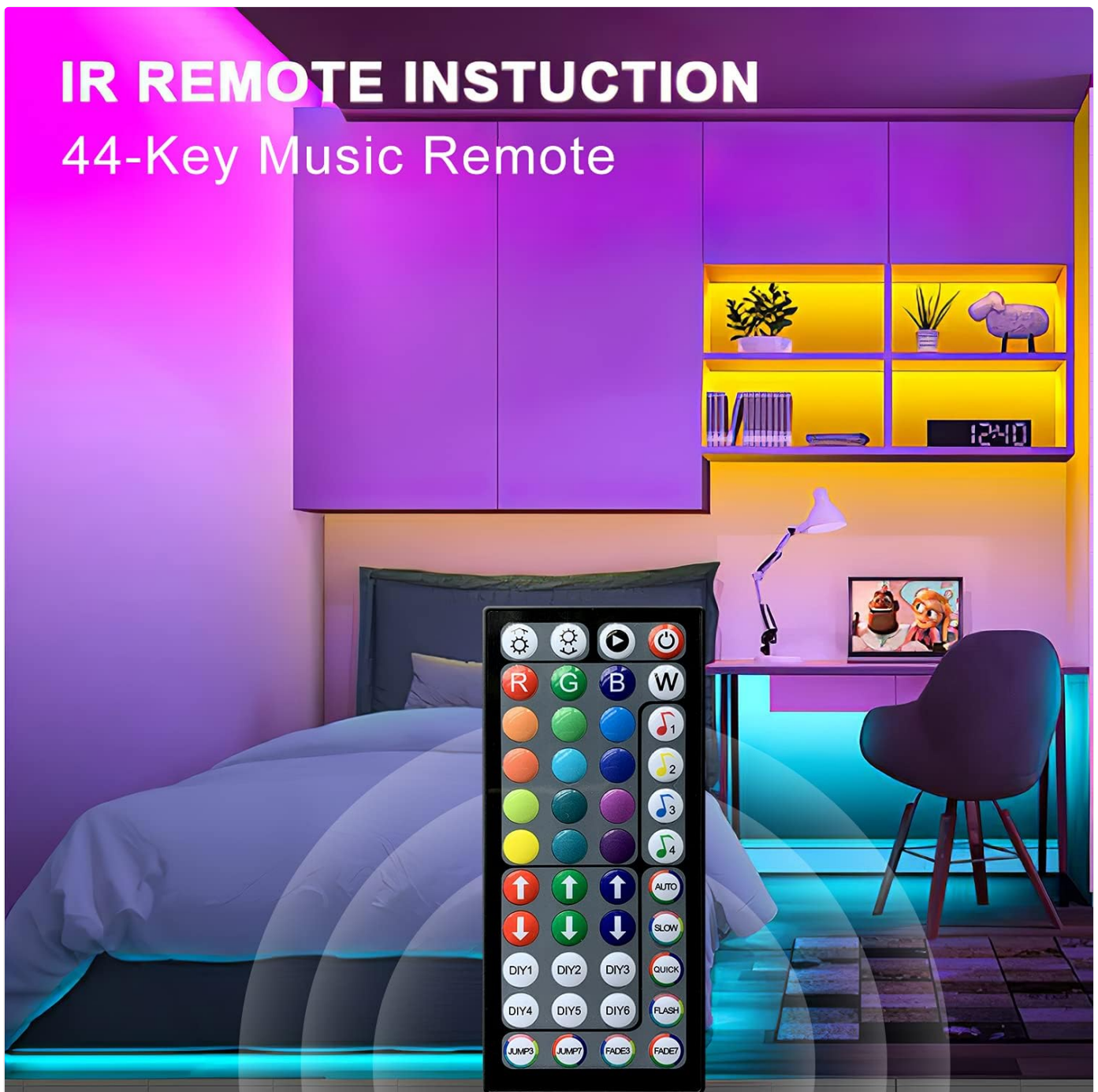
Image: The 44-key remote control, illustrating buttons for color selection, brightness, and various lighting modes.