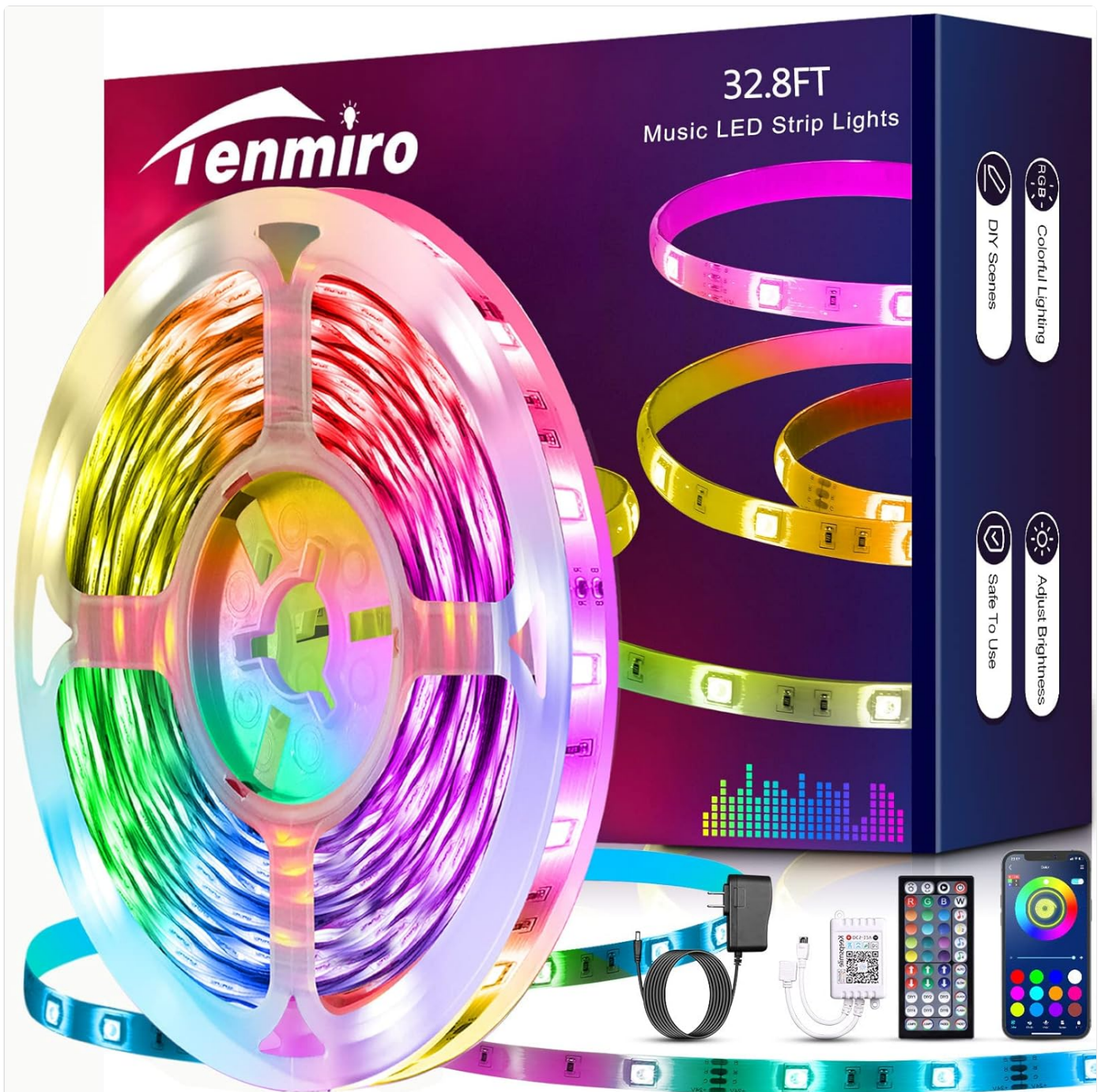
Image: Package contents including LED strip, power adapter, controller, and remote.