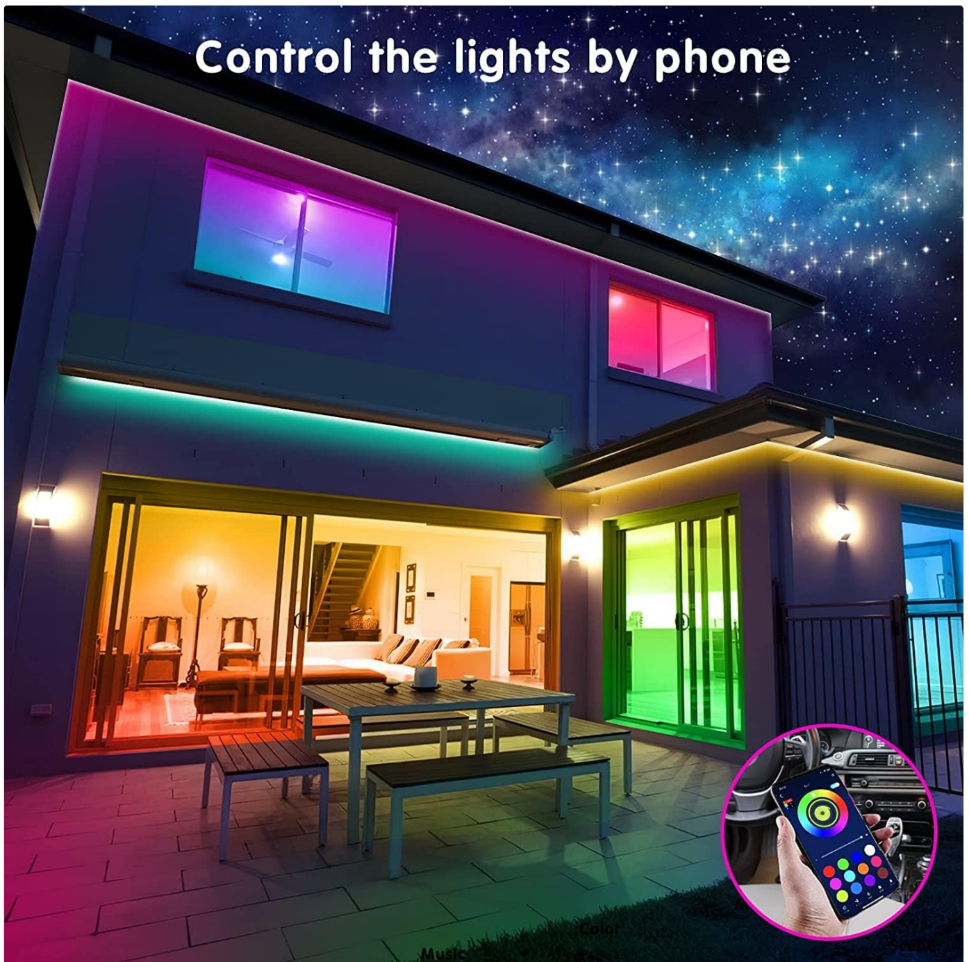
Image: A smartphone displaying the app interface for controlling the LED strip lights, showing color selection and mode options.