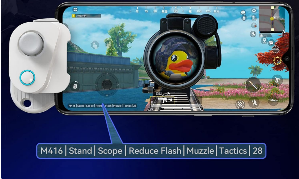
Image: A mobile game screenshot demonstrating the 'AI GUN FUNCTION' for Android, highlighting tactical options like M416, Stand, Scope, Reduce Flash, Muzzle, and Tactics.

Intelligent Gun recognition function in “Game for Peace”.