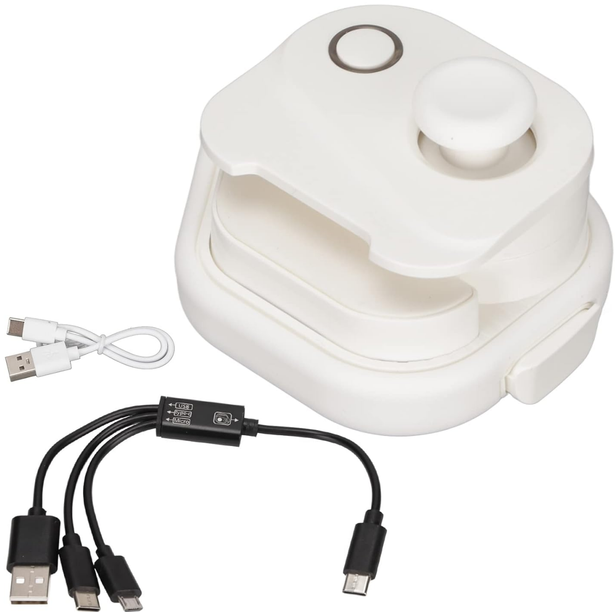
Image: The Lazmin112 Mobile Game Controller shown with its charging cables, including a USB-C cable.