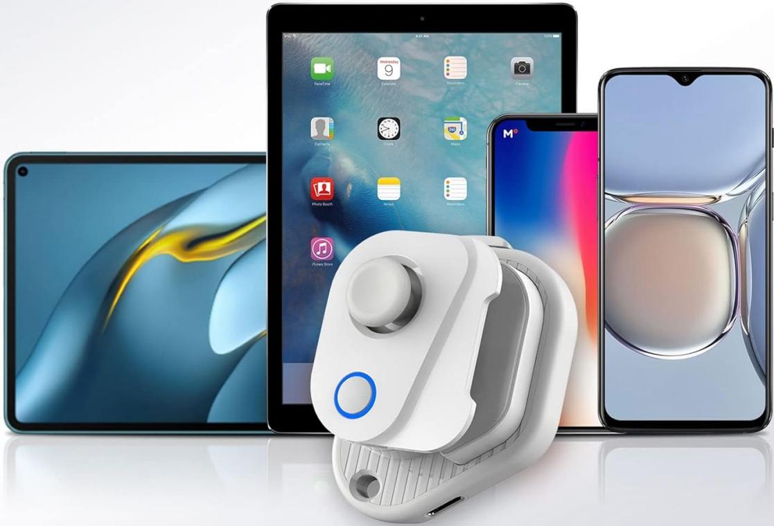
Image: The controller is displayed alongside various mobile phones and tablets, illustrating its universal compatibility.