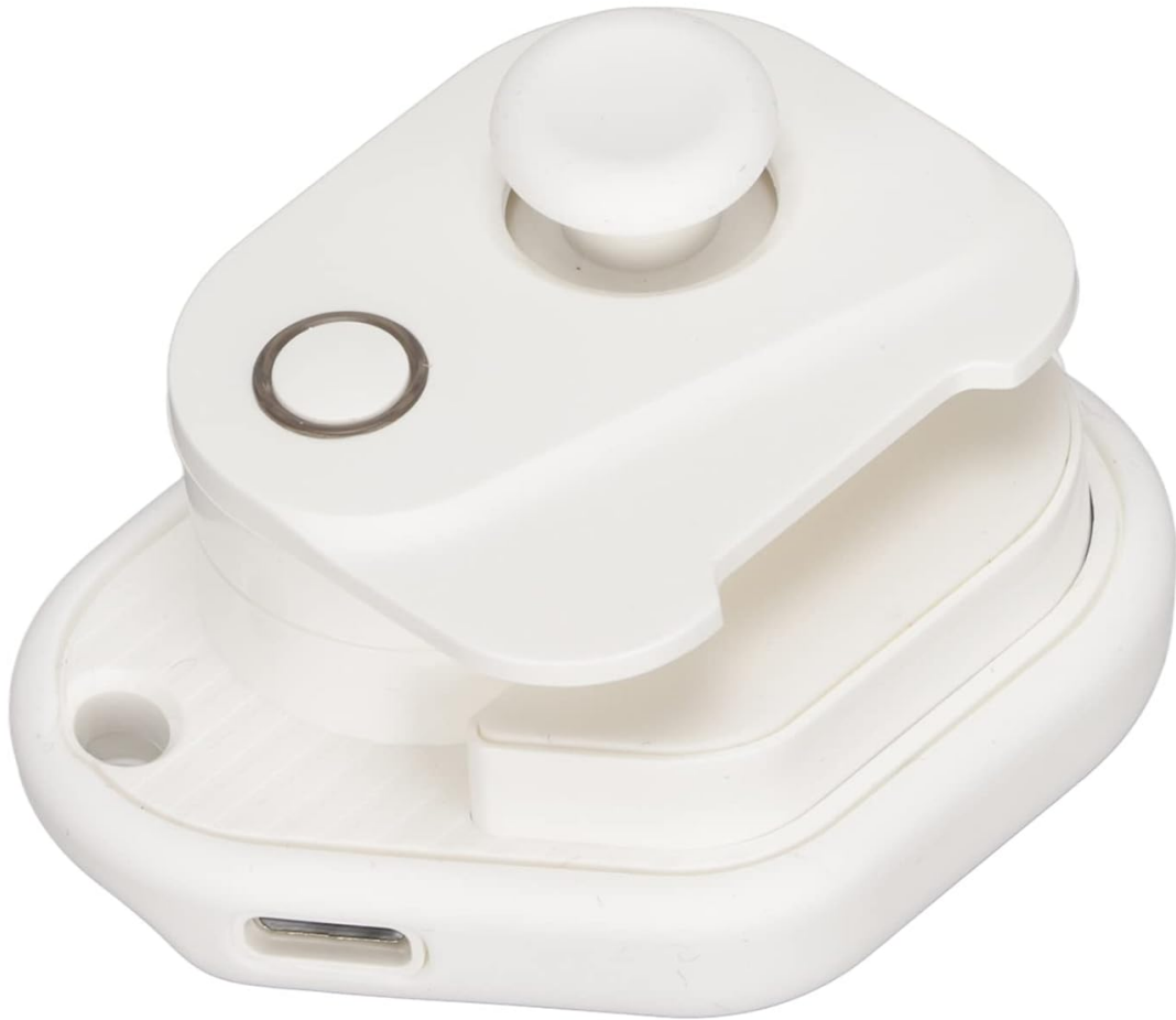
Image: A detailed view of the controller's clip, showing its approximate size range for device attachment.