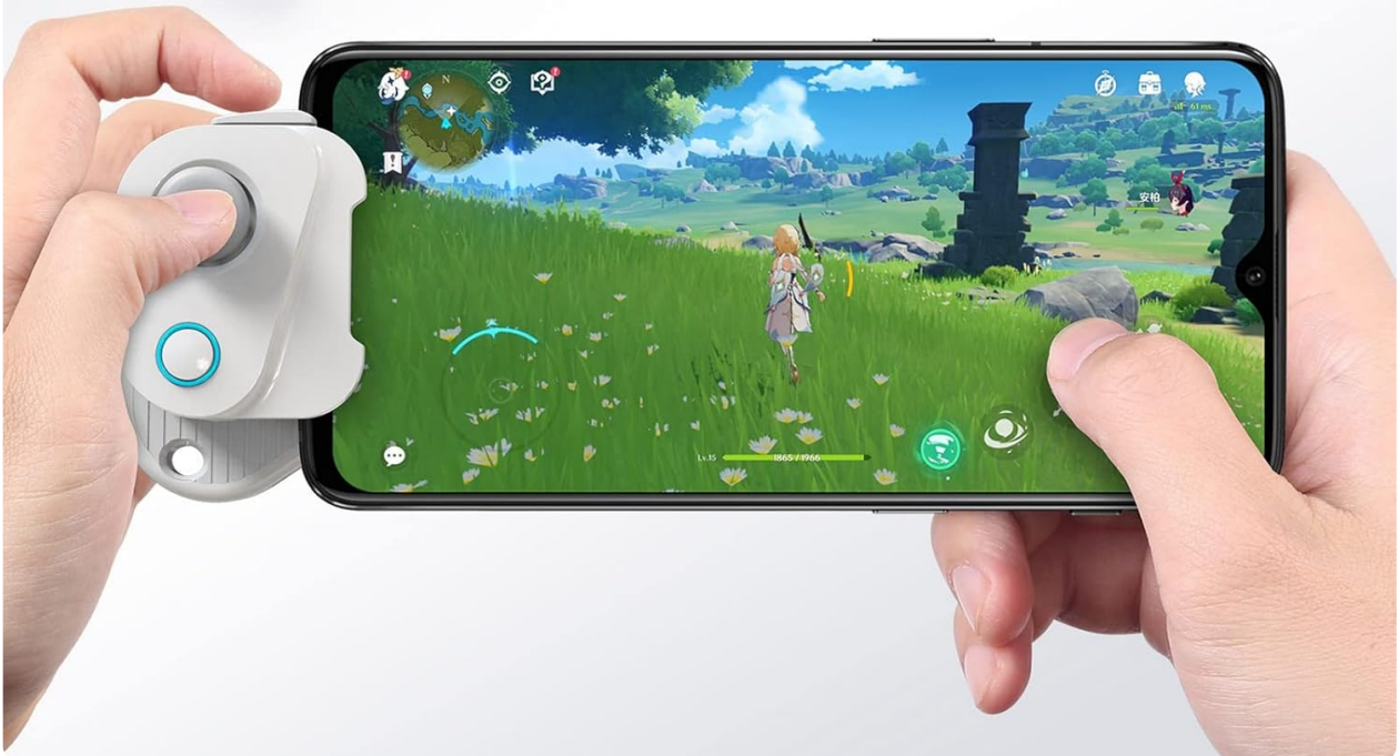
Image: The Lazmin112 Mobile Game Controller attached to a smartphone, demonstrating its use in a game. It supports wireless connection and is compatible with iOS 13.4+.