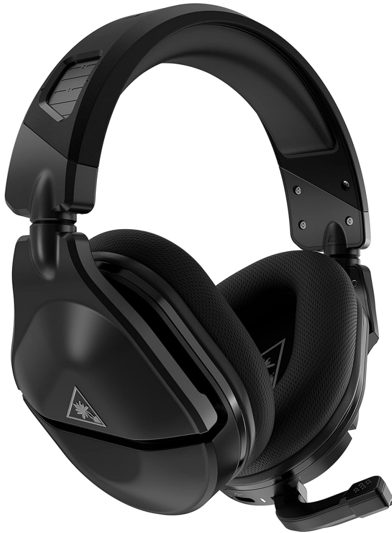
Image: The Turtle Beach Stealth 600 Gen 2 MAX headset with its microphone extended for active use.