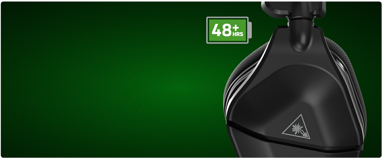
Image: A graphic emphasizing the headset's impressive 48+ hour battery life.