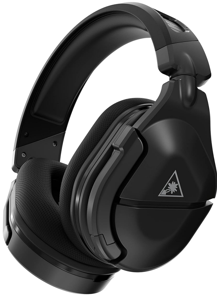
Image: A close-up view of the headset's earcups, highlighting the comfortable, breathable material and glasses-friendly design.