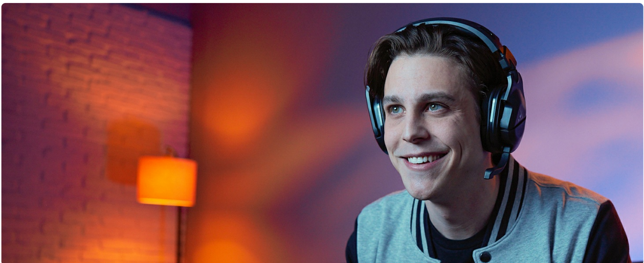
Image: The Turtle Beach Stealth 600 Gen 2 MAX Wireless Gaming Headset in black, showcasing its sleek design.