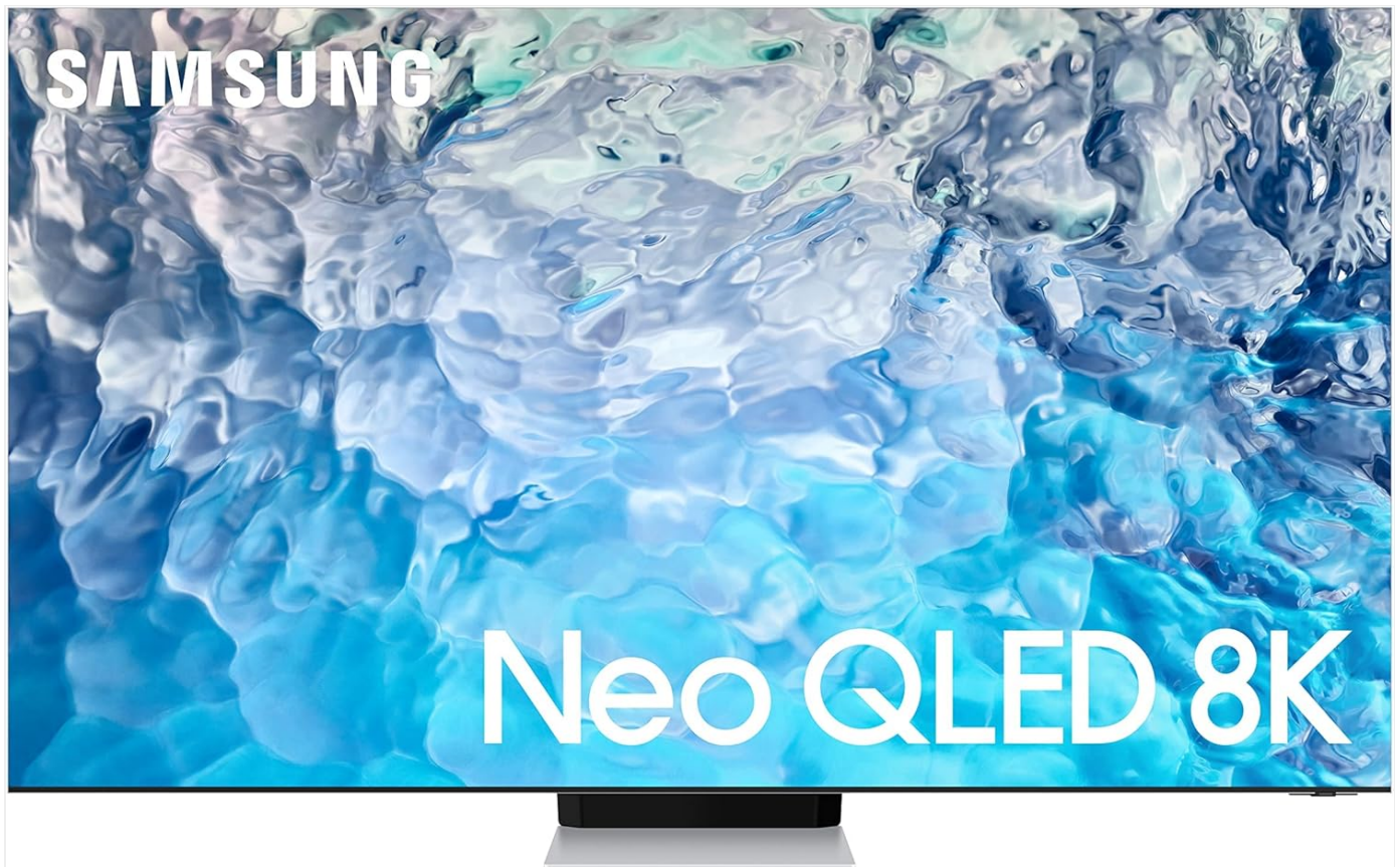
Image: Front view of the SAMSUNG 85-Inch Class Neo QLED 8K QN900B Series TV, showcasing its slim design and vibrant display.