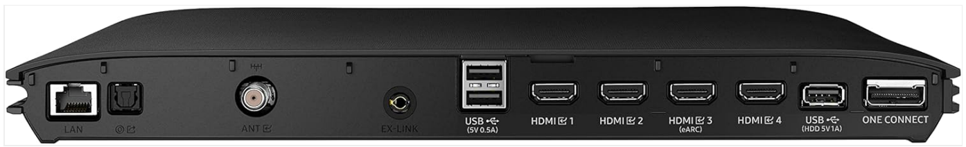
Image: The Slim One Connect Box, showing its various input and output ports including HDMI, USB, and Ethernet, designed to simplify cable management.