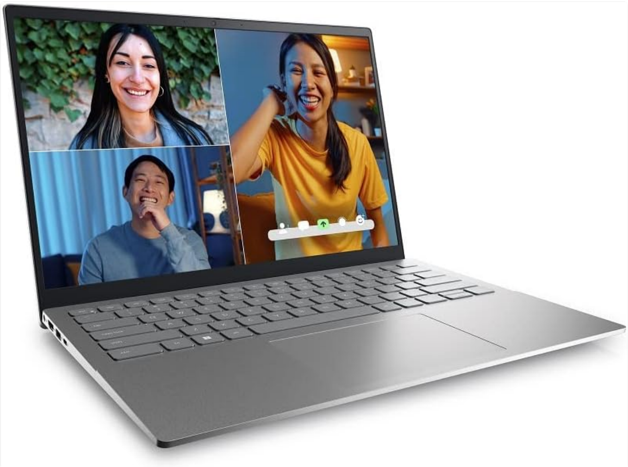
Figure 3.3: Laptop Side Ports