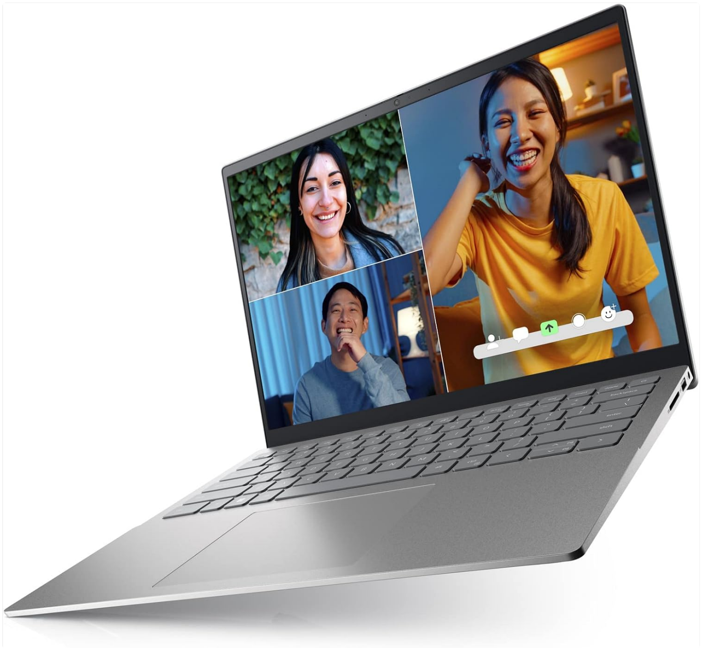
Figure 3.1: Dell Inspiron 14 5420 Laptop