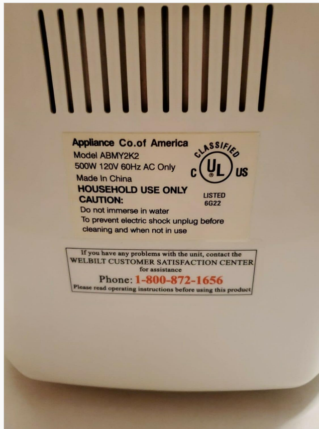
Image 5: Example of a product identification label for Welbilt Bread Machine Model ABMY2K2, showing model number and electrical specifications.