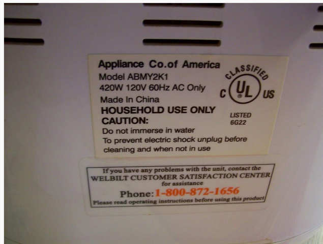
Image 4: Example of a product identification label for Welbilt Bread Machine Model ABMY2K1, showing model number and electrical specifications.

Before installing the new paddle, it is essential to confirm the brand name and model number of your bread machine. This information is typically found on the outer exterior surface of your machine, often as an adhesive decal, ink stamp, or embedded impression. Check the sides, bottom, or the push-button control panel.