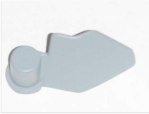
Image 2: Side view of the paddle, highlighting the shaft that connects to the bread machine's drive mechanism.