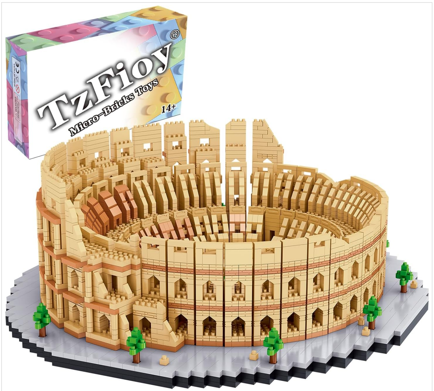
Image: The fully assembled TzFioy Colosseum Building Blocks Set, demonstrating the final product and its scale.

Follow the provided instruction booklet layer by layer. Some sections may require more delicate handling due to the small size and intricate connections. Once completed, your Colosseum model will be a testament to your patience and building skill, ready for display.