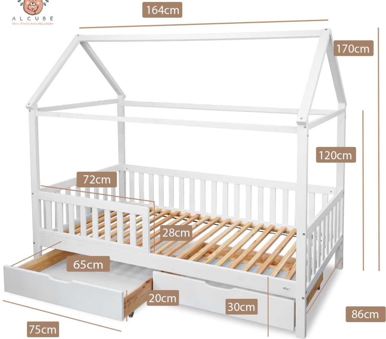
Image: Detailed dimensions of the bed frame and drawer, useful for planning placement and understanding components.