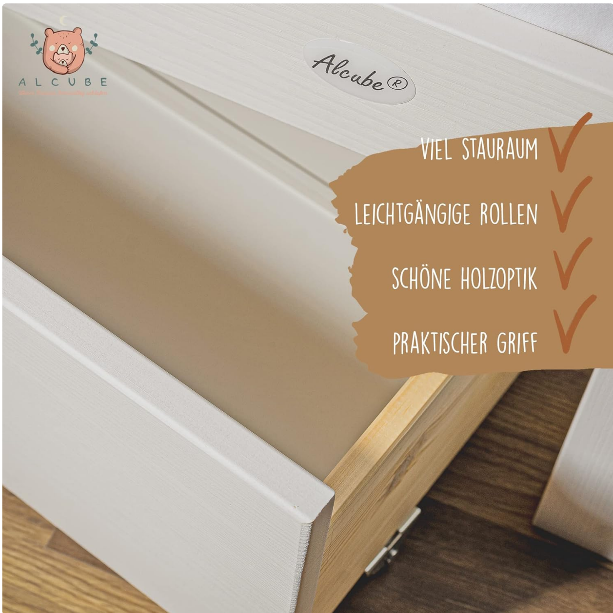
Image: An empty storage drawer, highlighting its clean interior and the practical design with smooth-gliding wheels.