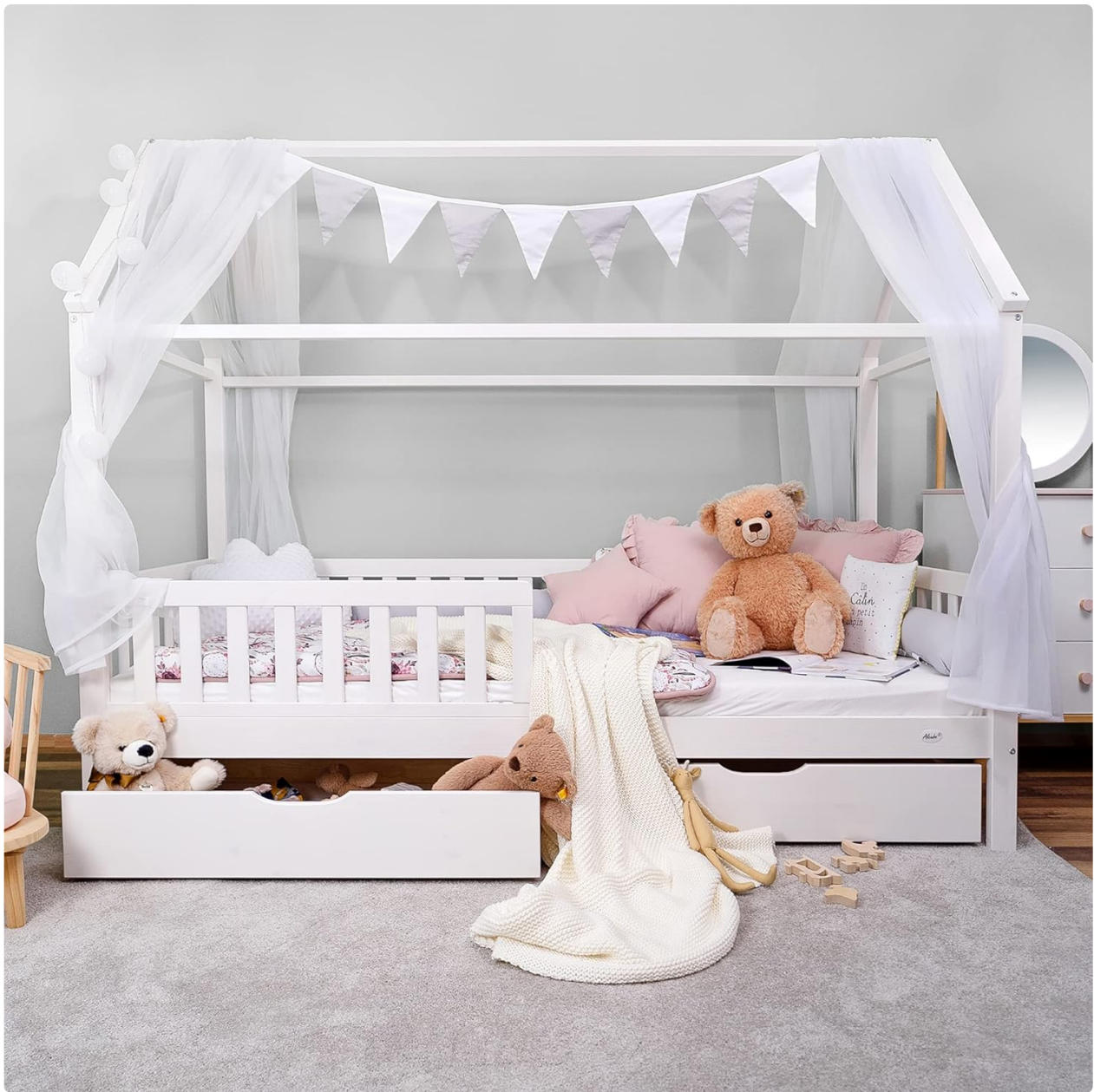
Image: The Alcube HYGGI House Bed, showcasing its design with an open storage drawer, decorated with bedding, pillows, and stuffed animals.