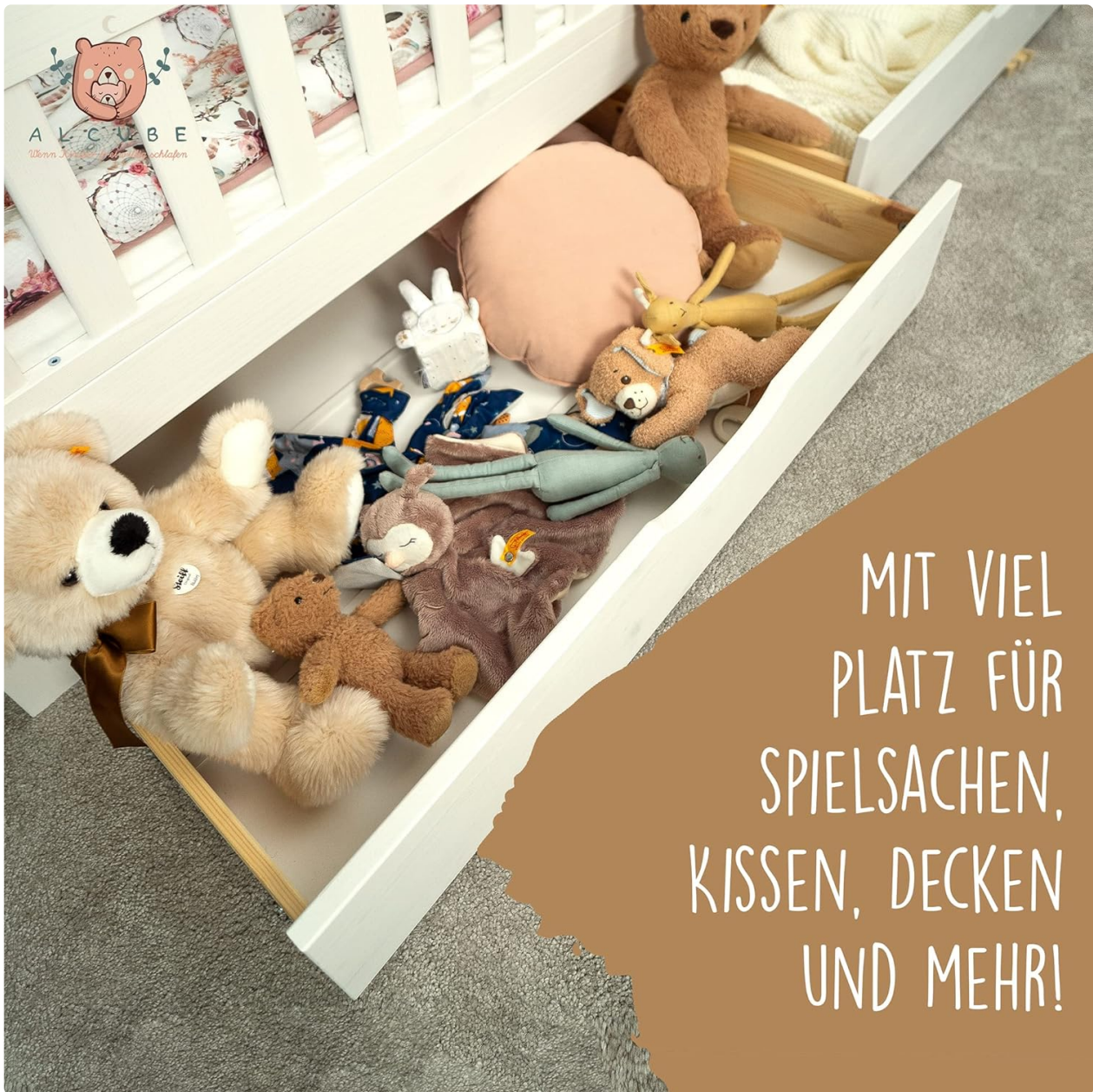
Image: The spacious storage drawer, demonstrating its capacity for toys and other items, contributing to a tidy room.