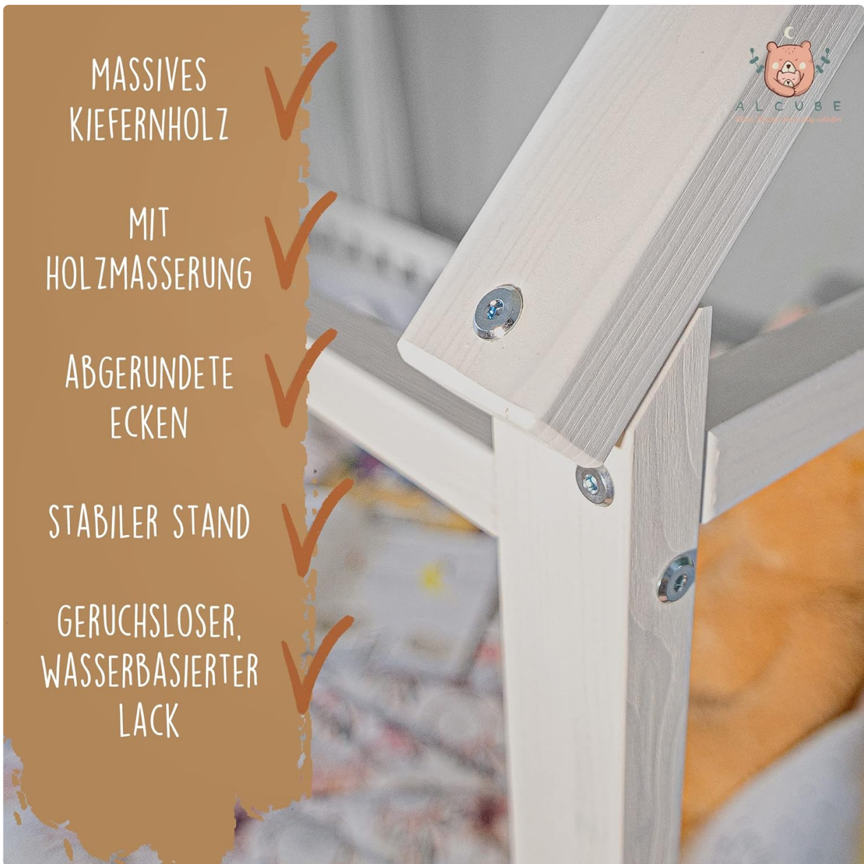
Image: A close-up view of the bed's solid pine wood construction and secure screw connections, illustrating material quality.