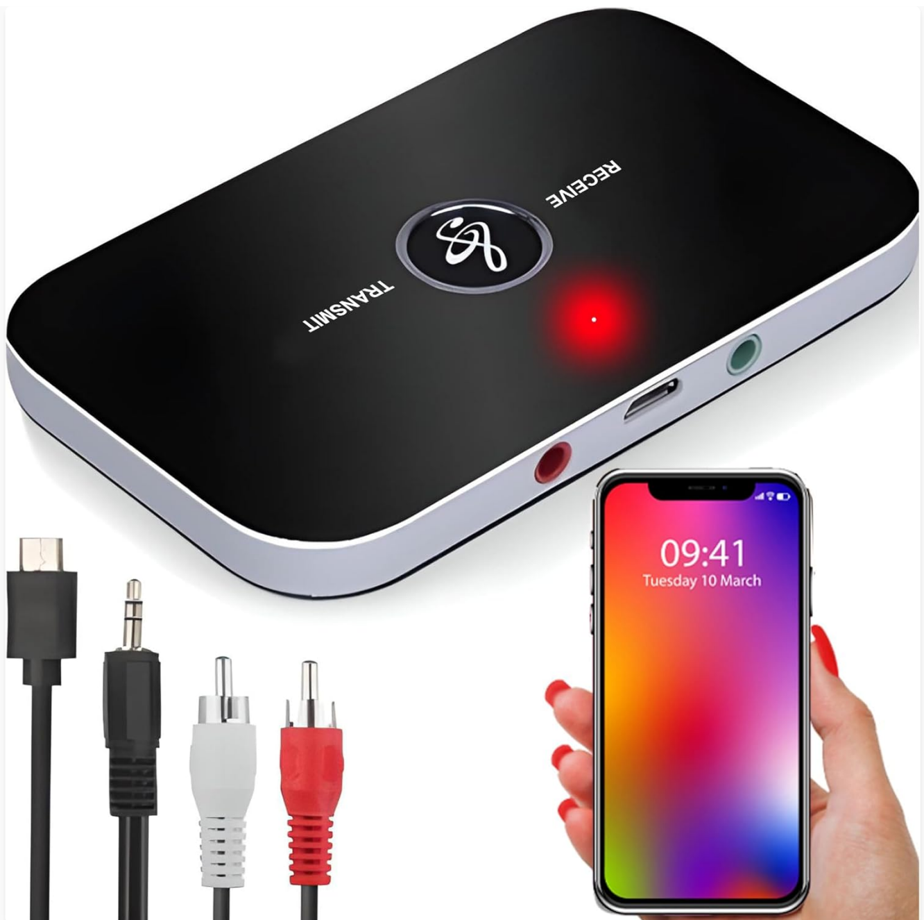
Image 1.1: Retoo 2-in-1 Bluetooth Audio Transmitter Receiver with accessories.