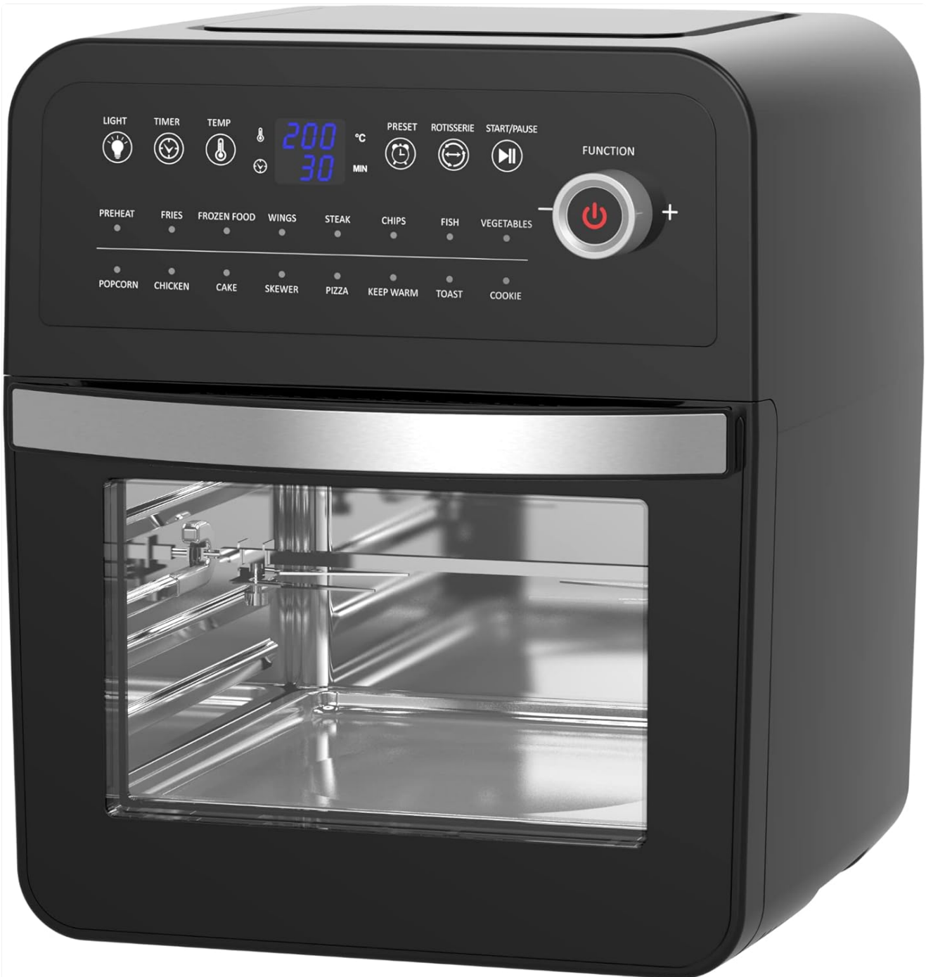
Image: Front view of the EMtronics EMAFO12LD 12L Digital Air Fryer XL, showcasing its sleek black design and digital control panel.