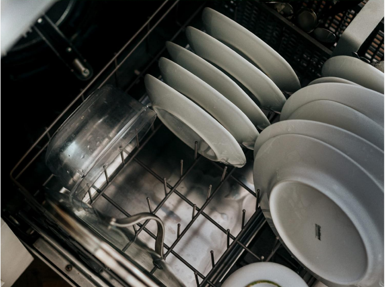
Image: Interior of a dishwasher showing various plates and a glass, illustrating the convenience of dishwasher-safe parts for easy cleaning.

Dishwasher safe parts ensure easy cleaning. Start the dishwasher cycle and have the detachable parts clean and ready for use almost immediately.