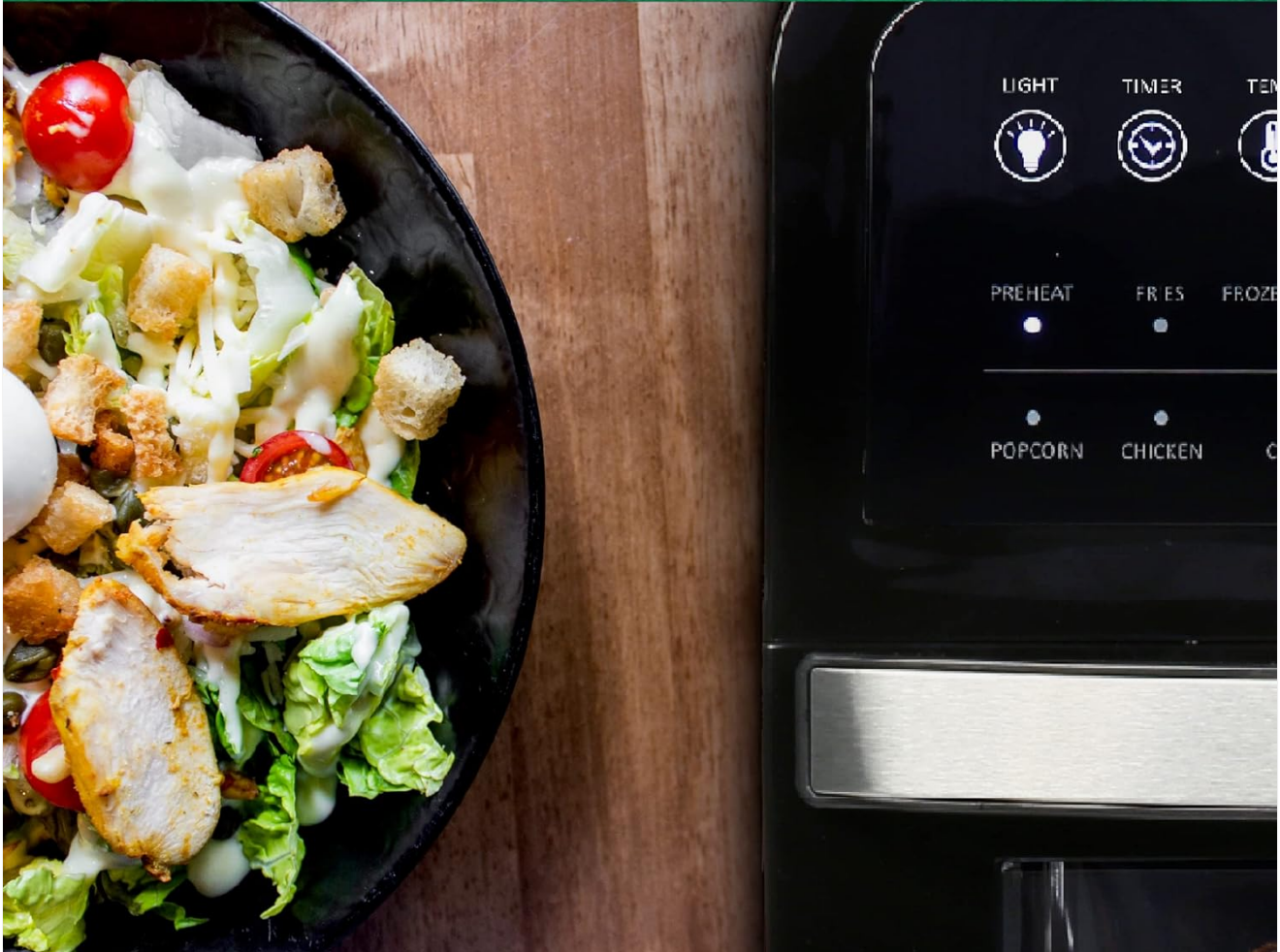
Image: The digital control panel displaying the 16 preset cooking functions, including options for preheat, fries, wings, steak, fish, vegetables, popcorn, chicken, cake, skewer, pizza, keep warm, toast, and cookie.

Choose and alternate between the different cooking functions provided. Air fry, braise, bake, grill, roast and more!