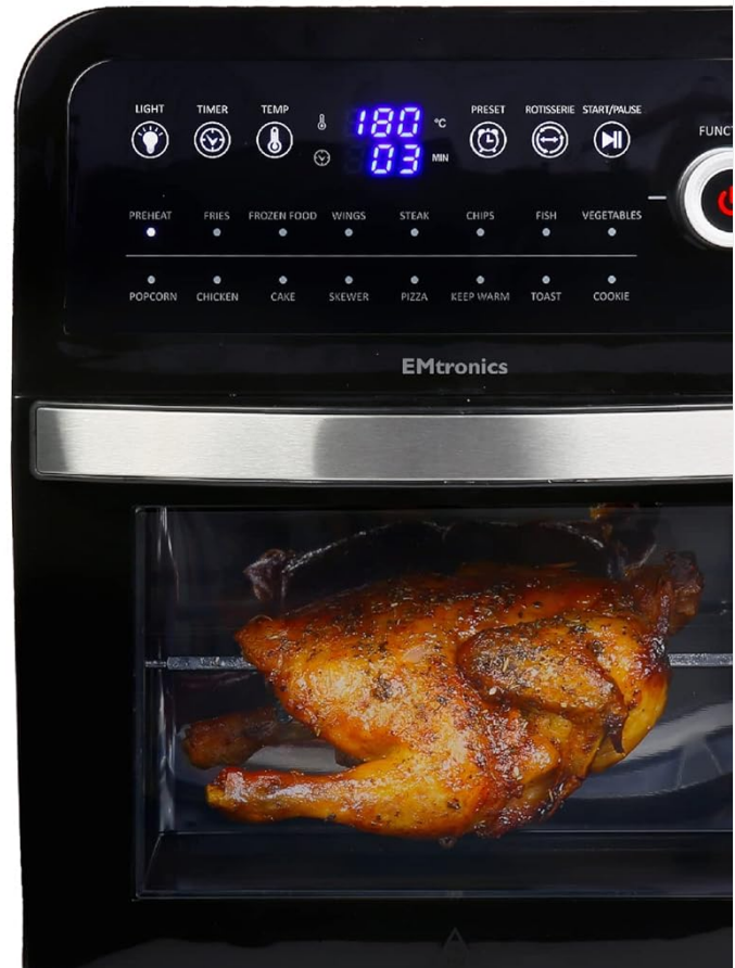
Image: Close-up of the digital control panel highlighting features like LED display, 12L capacity, and adjustable 60-minute timer.