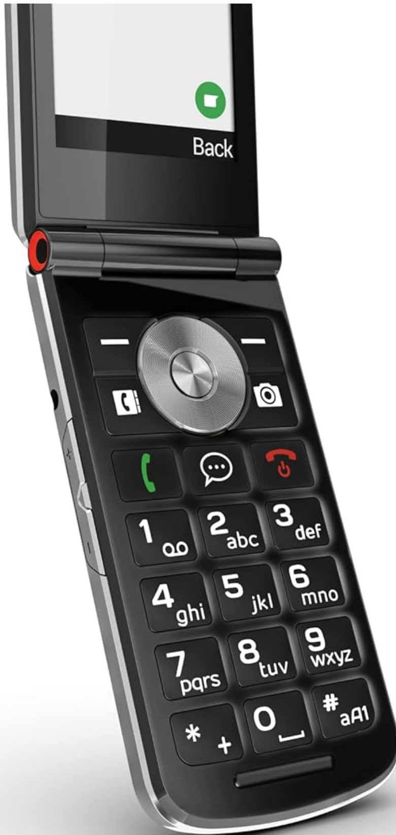
Figure 4: The phone opened, displaying the WhatsApp messaging interface.