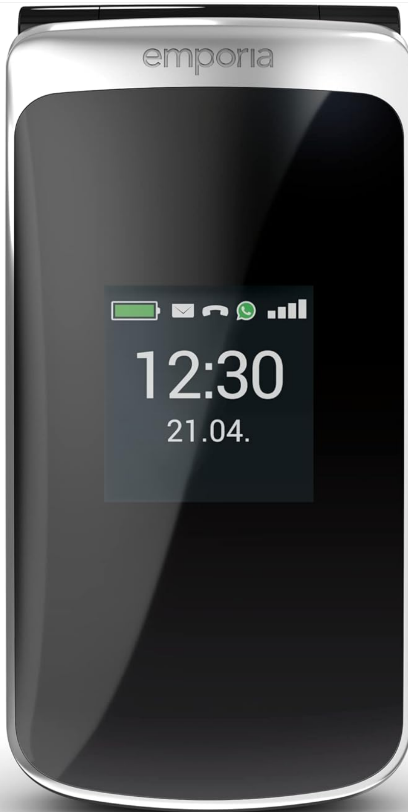
Figure 2: The Emporia TOUCHsmart.2 placed in its charging cradle for convenient charging.