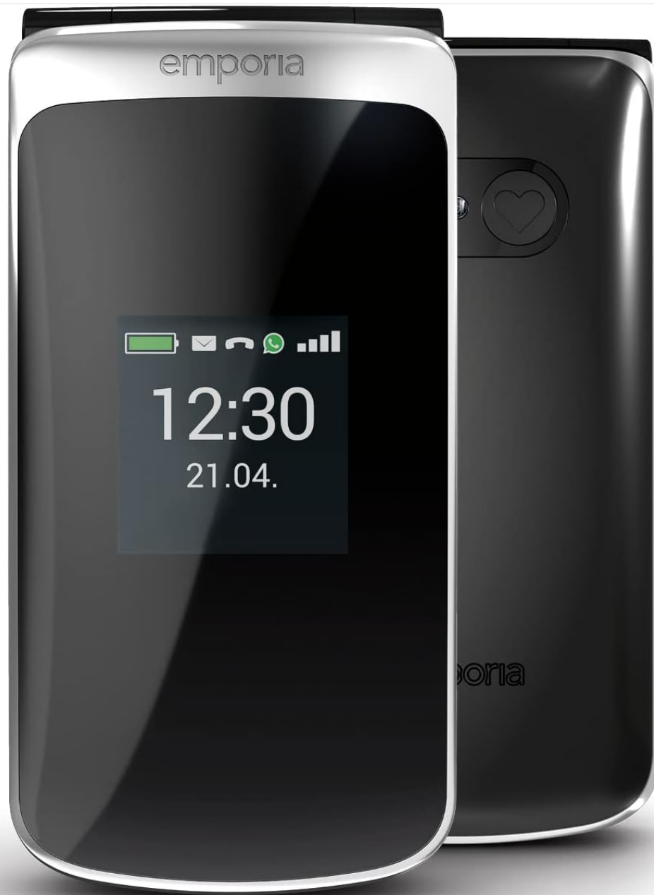
Figure 1: The Emporia TOUCHsmart.2 in its closed state, showcasing its sleek design and external display.