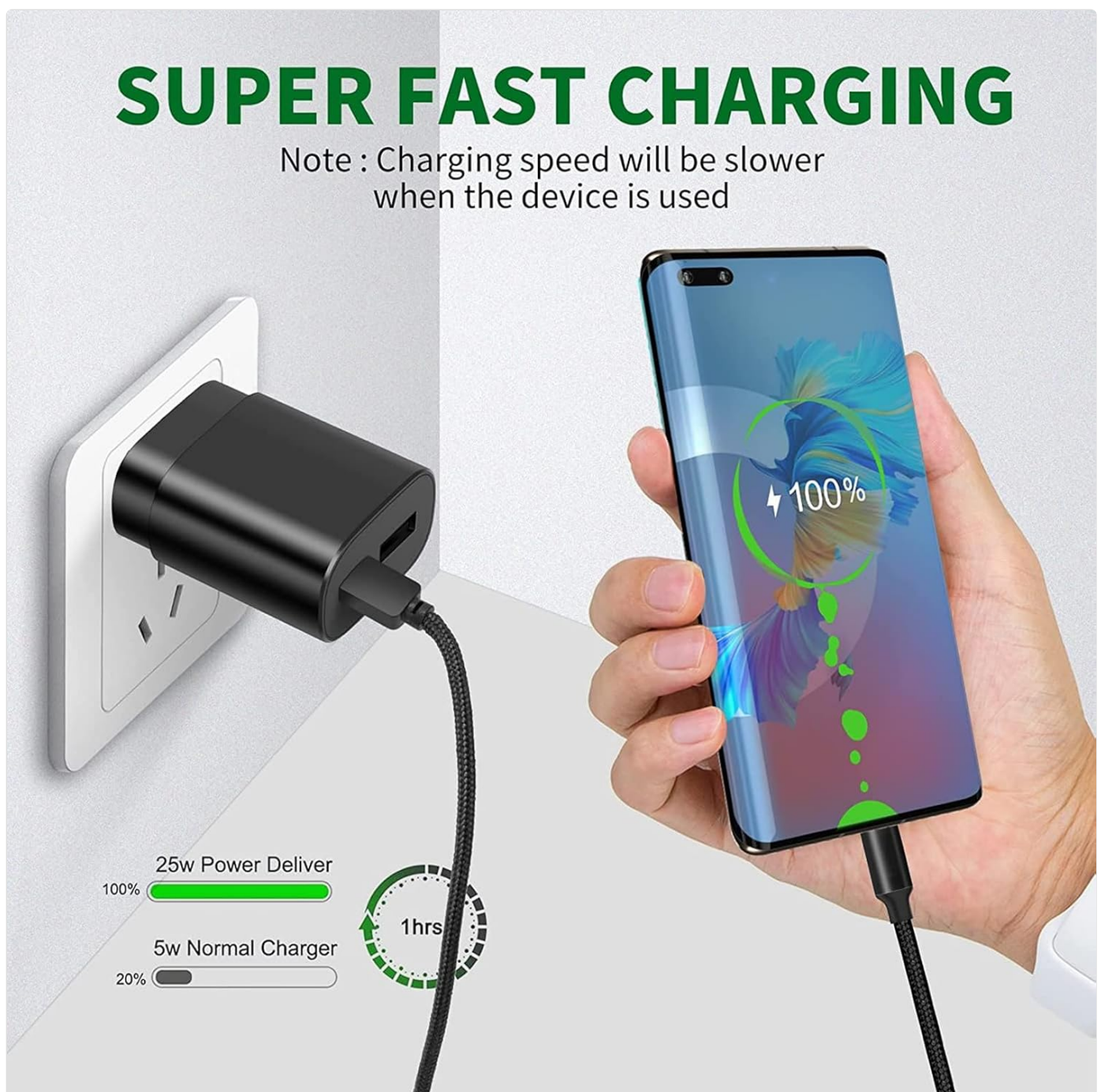
Figure 5.1: Illustration of the 25W fast charging capability, demonstrating a significant reduction in charging time compared to standard

To charge two devices simultaneously, connect one device to the USB-C port and another to the USB-A port. The charger will intelligently distribute the available 25W power output between the two connected devices. Note that charging speed may be slower when two devices are connected compared to charging a single device at its maximum rate.