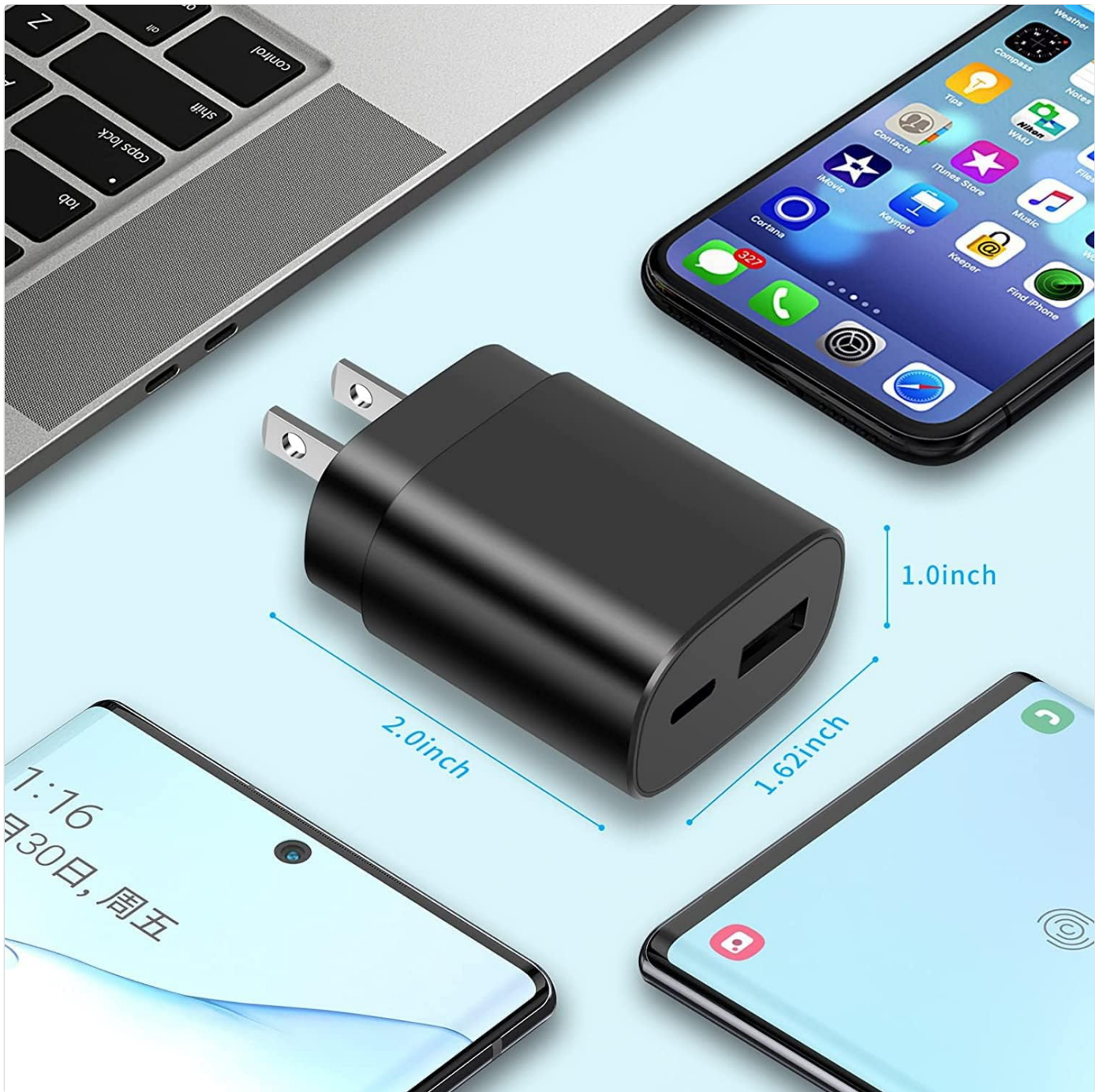
Figure 9.1: Physical dimensions of the charger, illustrating its compact size.