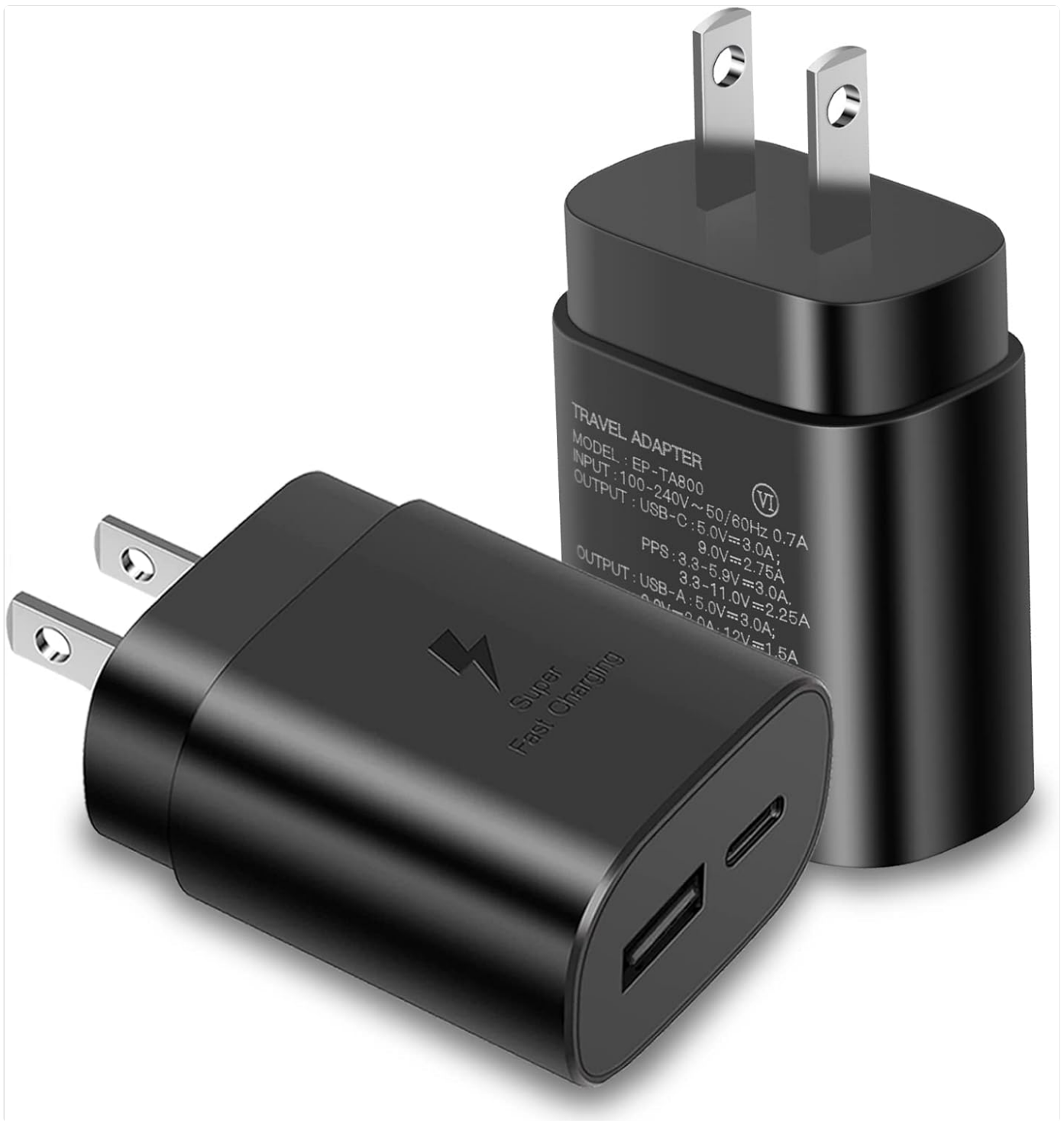
Figure 3.1: The SAN.COMO 25W Dual Port USB-C Fast Charger units included in the package.