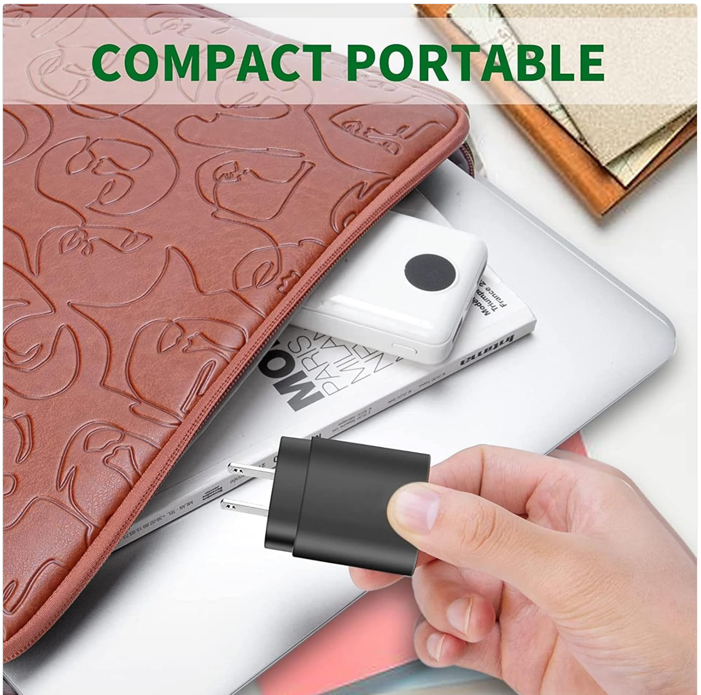
Figure 9.2: The charger's compact and portable design, suitable for travel.