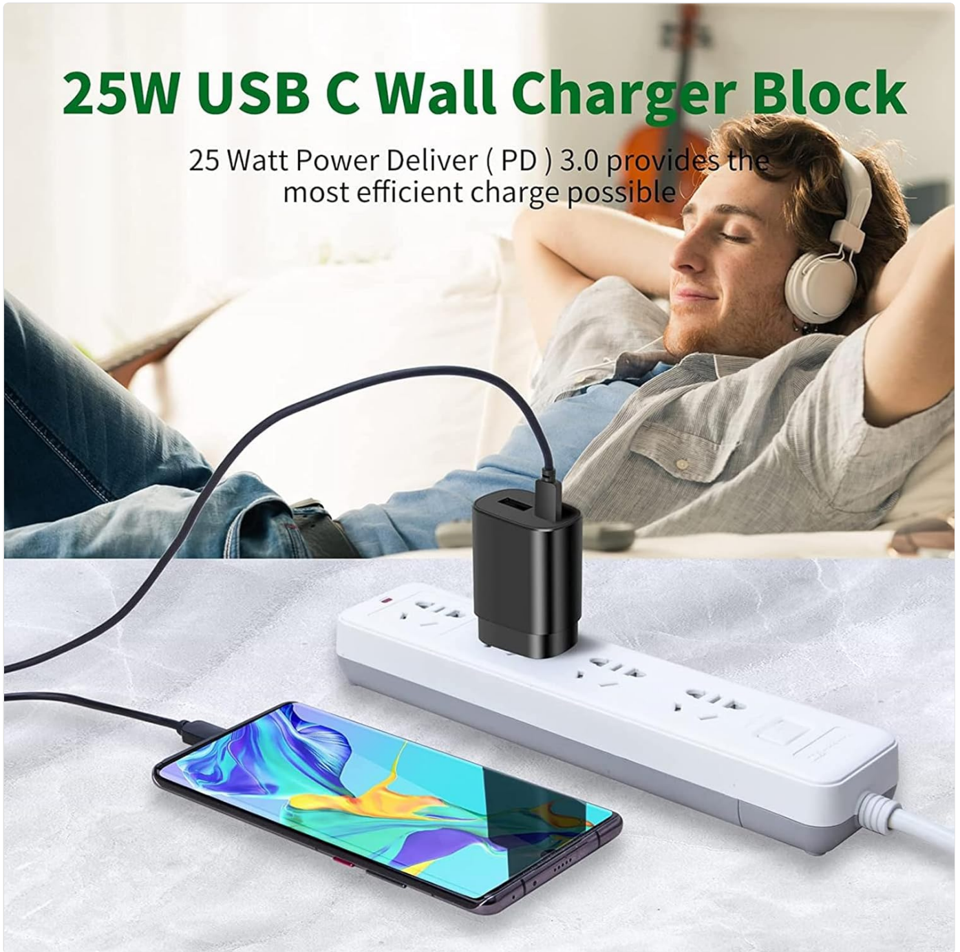
Figure 5.2: The 25W USB-C Wall Charger Block in use, providing efficient power delivery to a connected smartphone.

25 Watt Power Deliver ( PD ) 3.0 provides the most efficient charge possible