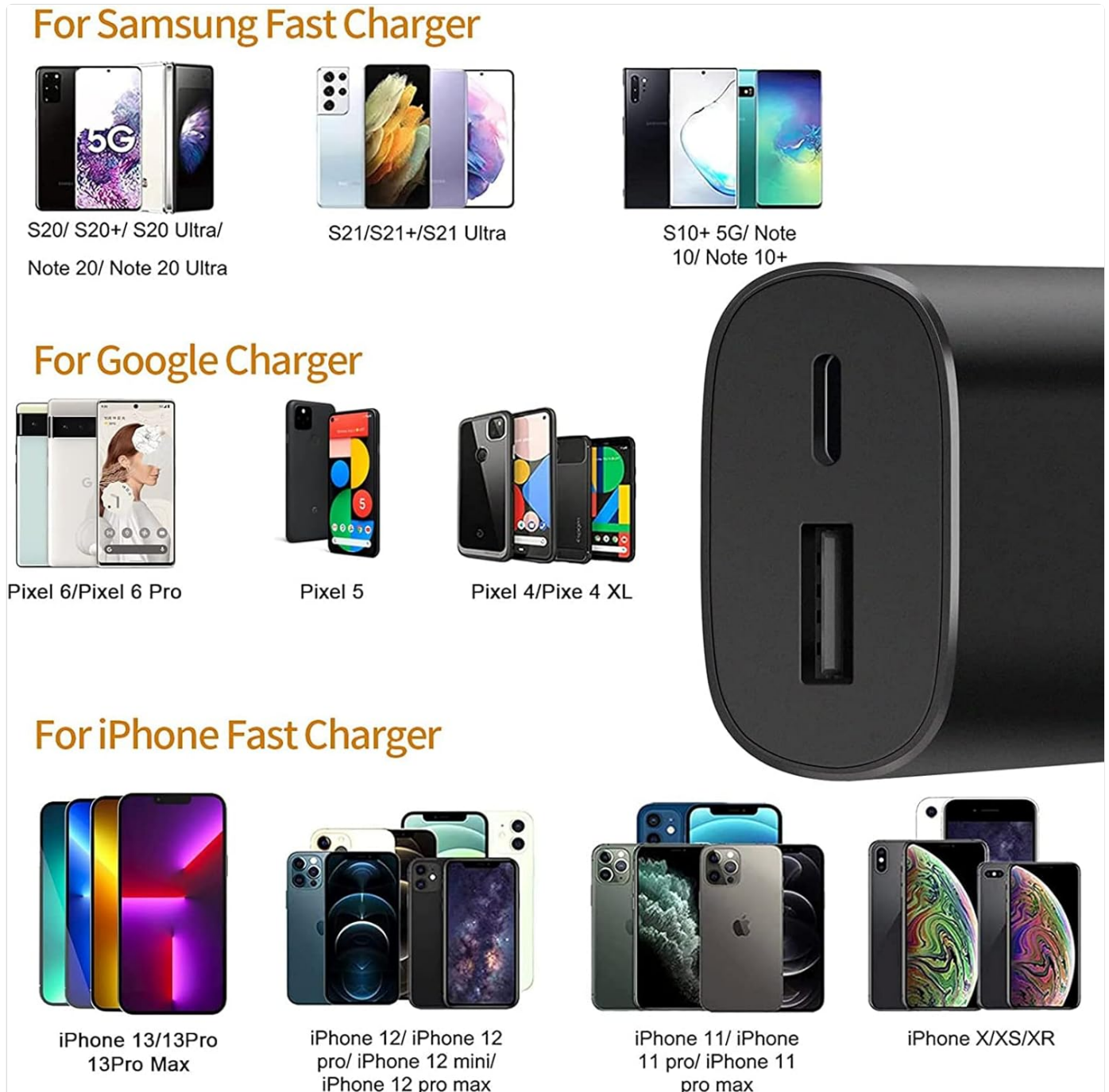
Figure 6.1: Overview of compatible devices, including popular models from Samsung, Google, and Apple.