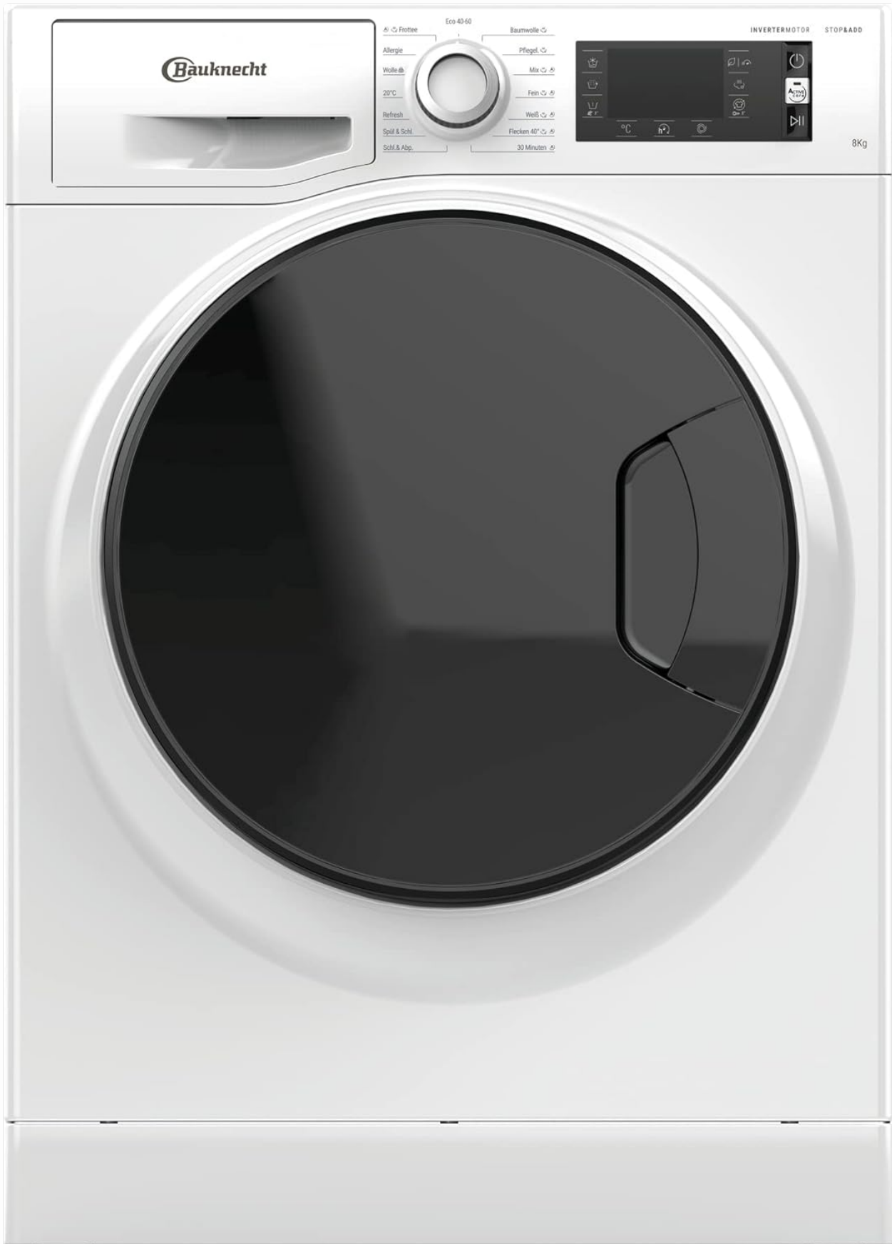
Figure 2.1: Front view of the Bauknecht WM Elite 8A washing machine.

Carefully remove all packaging materials and transport bolts before installation. Ensure the machine is placed on a stable, level surface. Adjust the feet to ensure the appliance is perfectly balanced to prevent vibrations during operation.