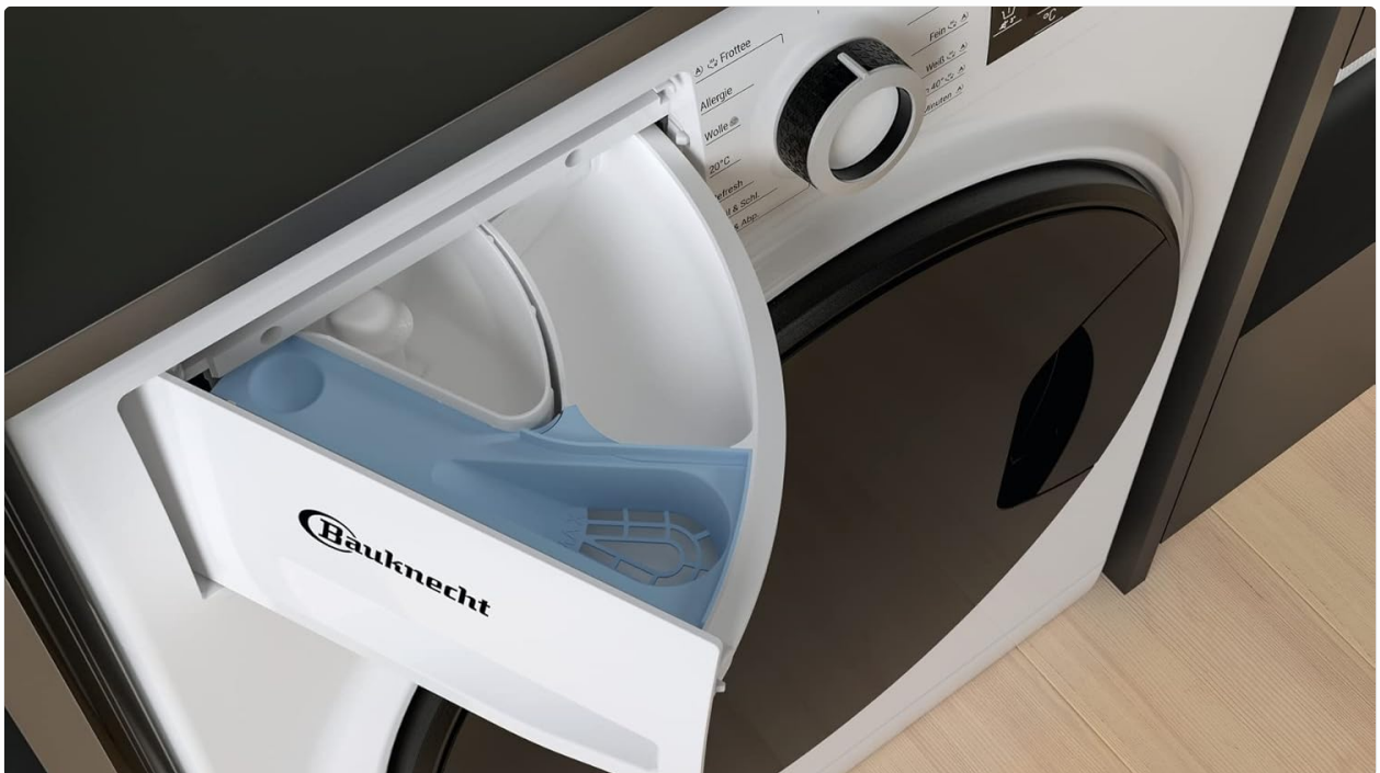
Figure 3.4: Detergent dispenser drawer.

Pull out the detergent dispenser drawer. Add appropriate amounts of detergent and fabric softener to the designated compartments. Refer to your detergent packaging for recommended dosages.