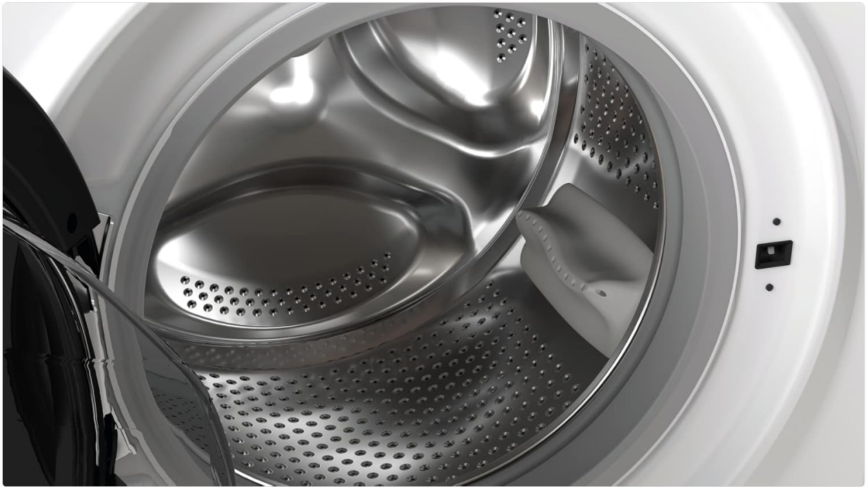
Figure 3.3: Interior of the washing machine drum.