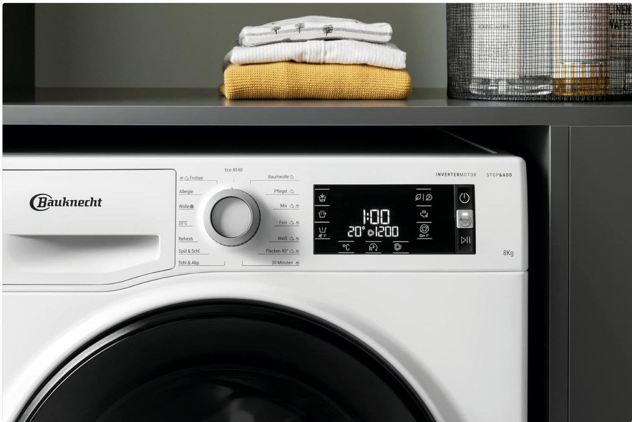
Figure 3.5: Digital display and option buttons.