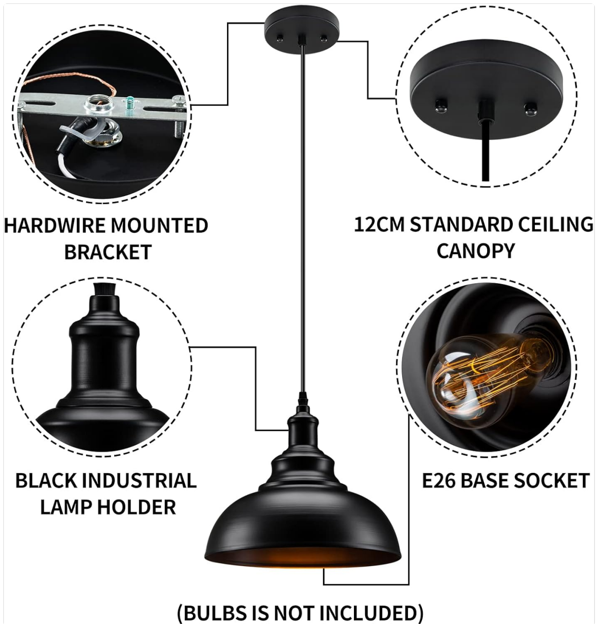
Image 3.1: Diagram showing the main components of the pendant light, including the hardwire mounted bracket, ceiling canopy, black industrial lamp holder, and E26 base socket.