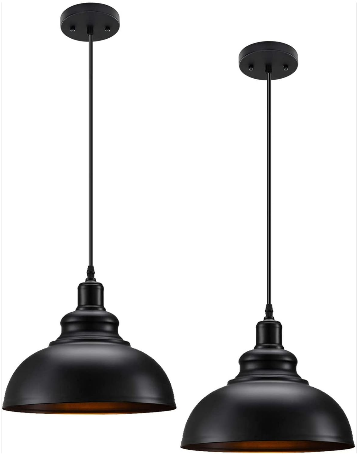
Image 1.1: The Asnxcju Matte Black Pendant Light, shown as a 2-pack.