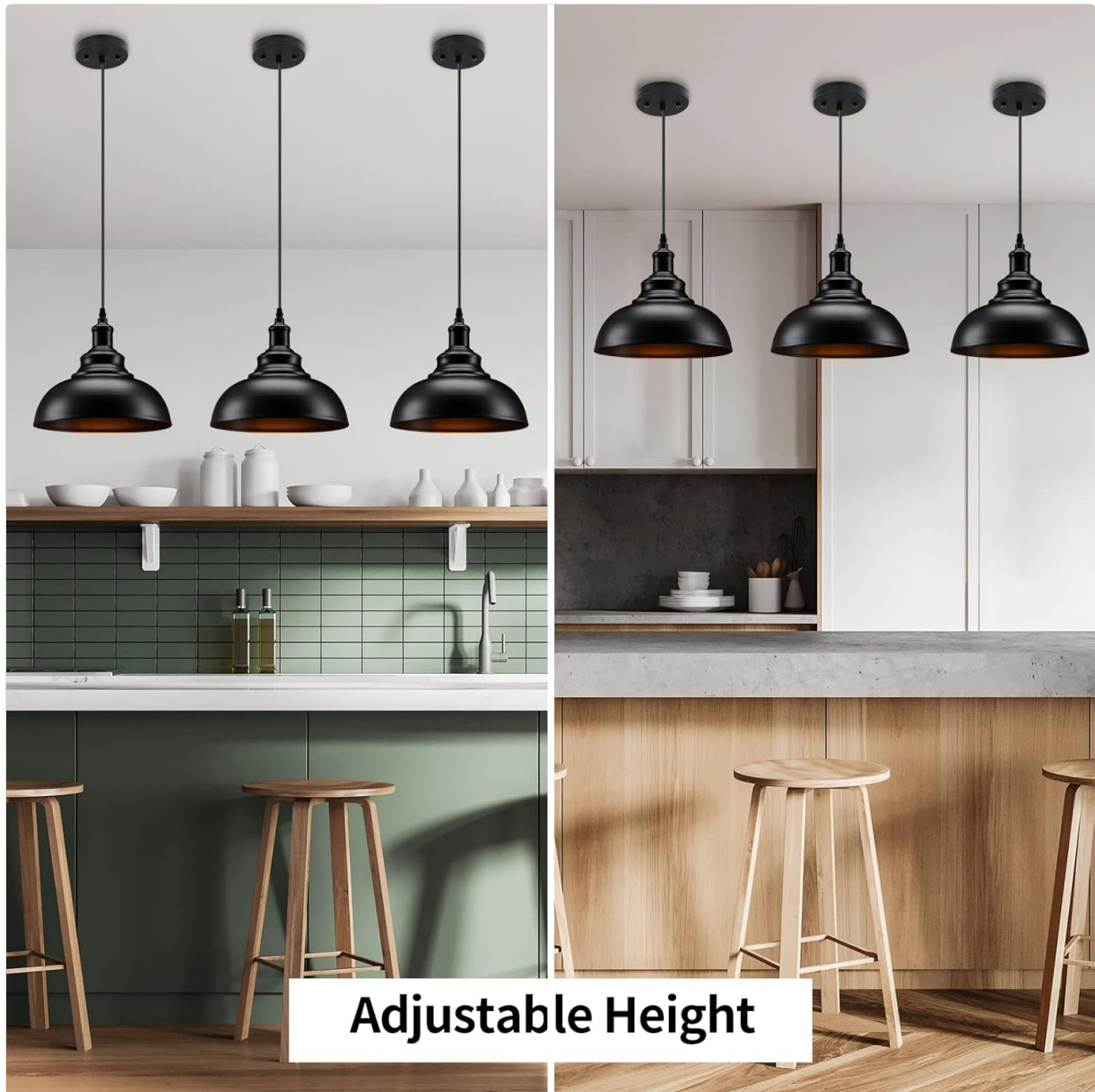
Image 2.1: Illustration of the adjustable height feature, showing how the pendant light's cord length can be customized.