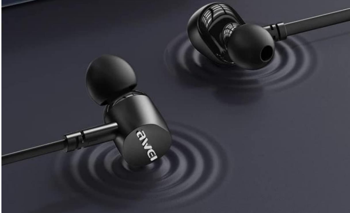
Figure 3.3: The integrated HD microphone is designed to pick up clear audio, even in noisy environments.

Even if you are in a noisy street, the voice call is still clear