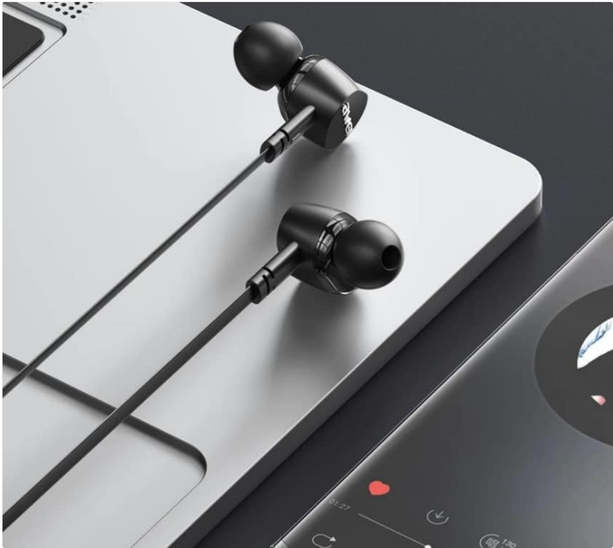
Figure 4.1: The earphones are compatible with various devices featuring a USB-C port, such as laptops and smartphones.