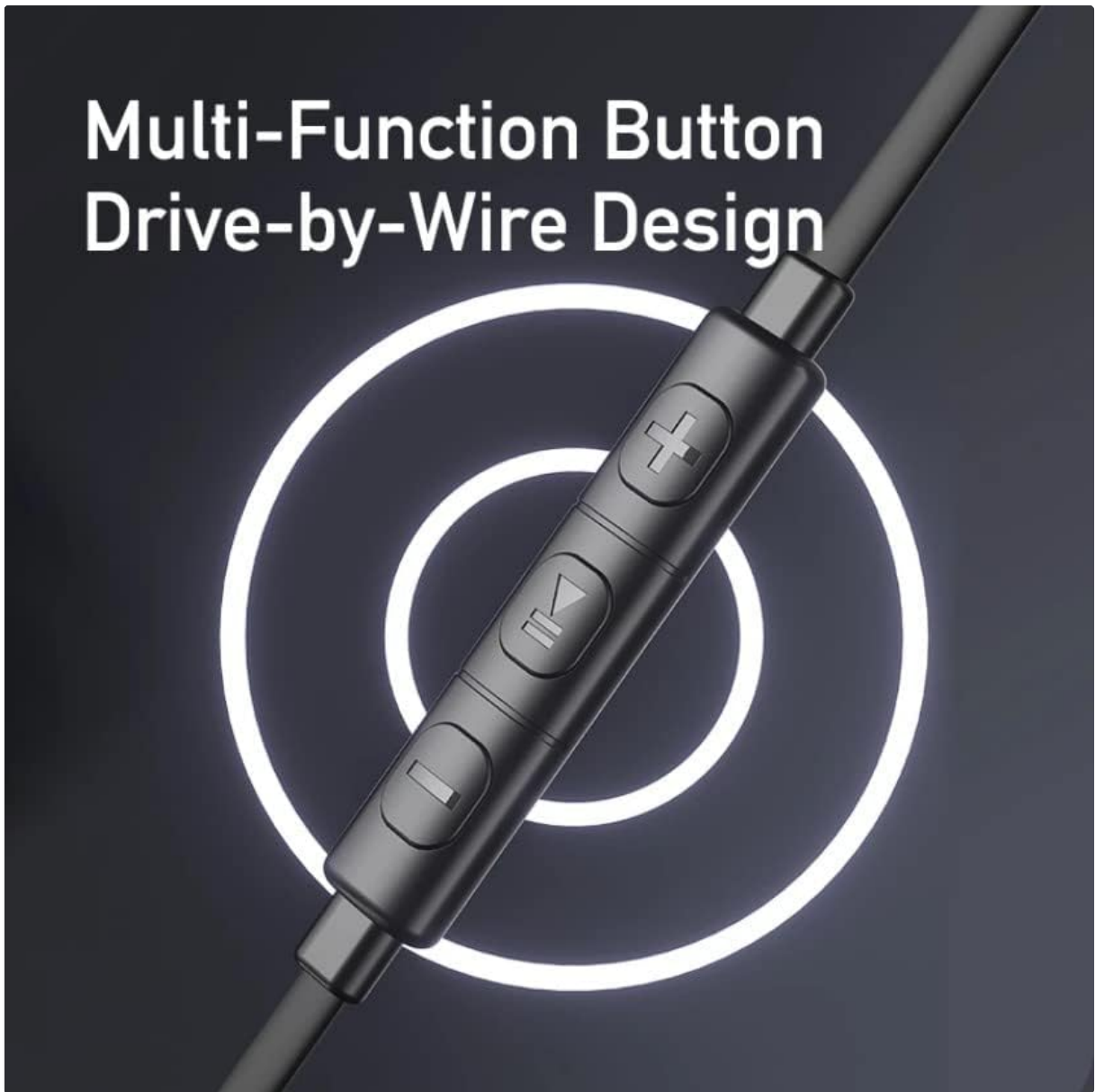
Figure 3.2: The inline remote control features multi-function buttons for managing audio and calls.