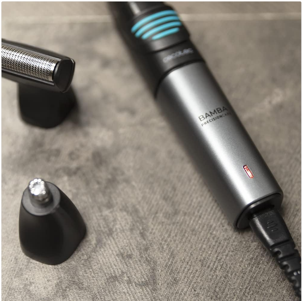
Image 4.2: The shaver connected to its power adapter for charging.