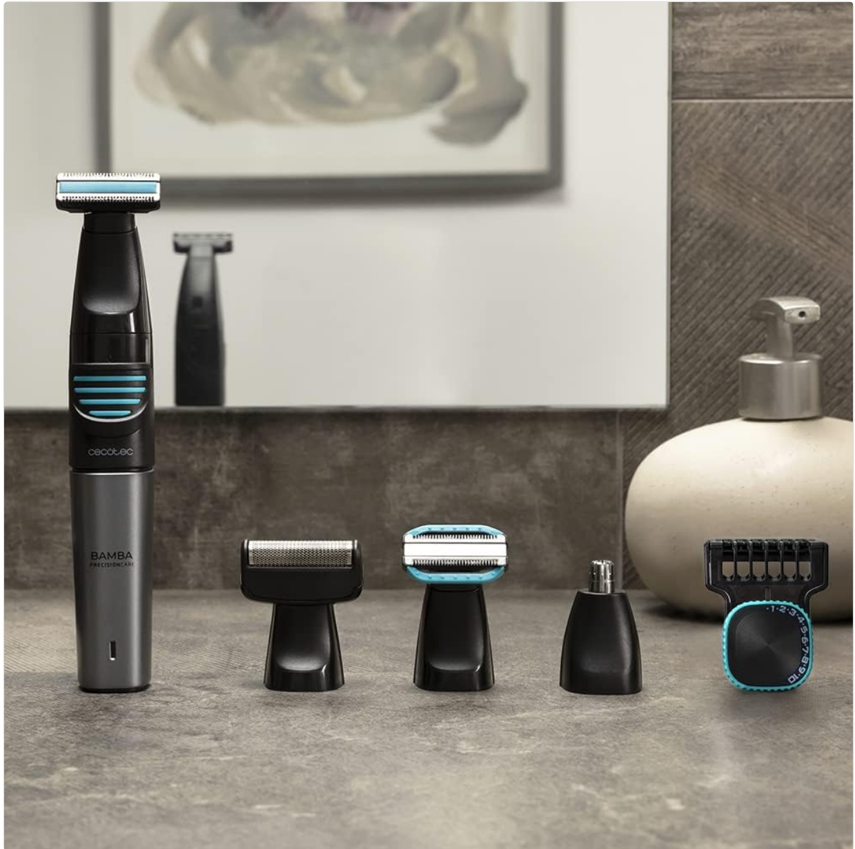
Image 3.1: All interchangeable heads and accessories included in the package.