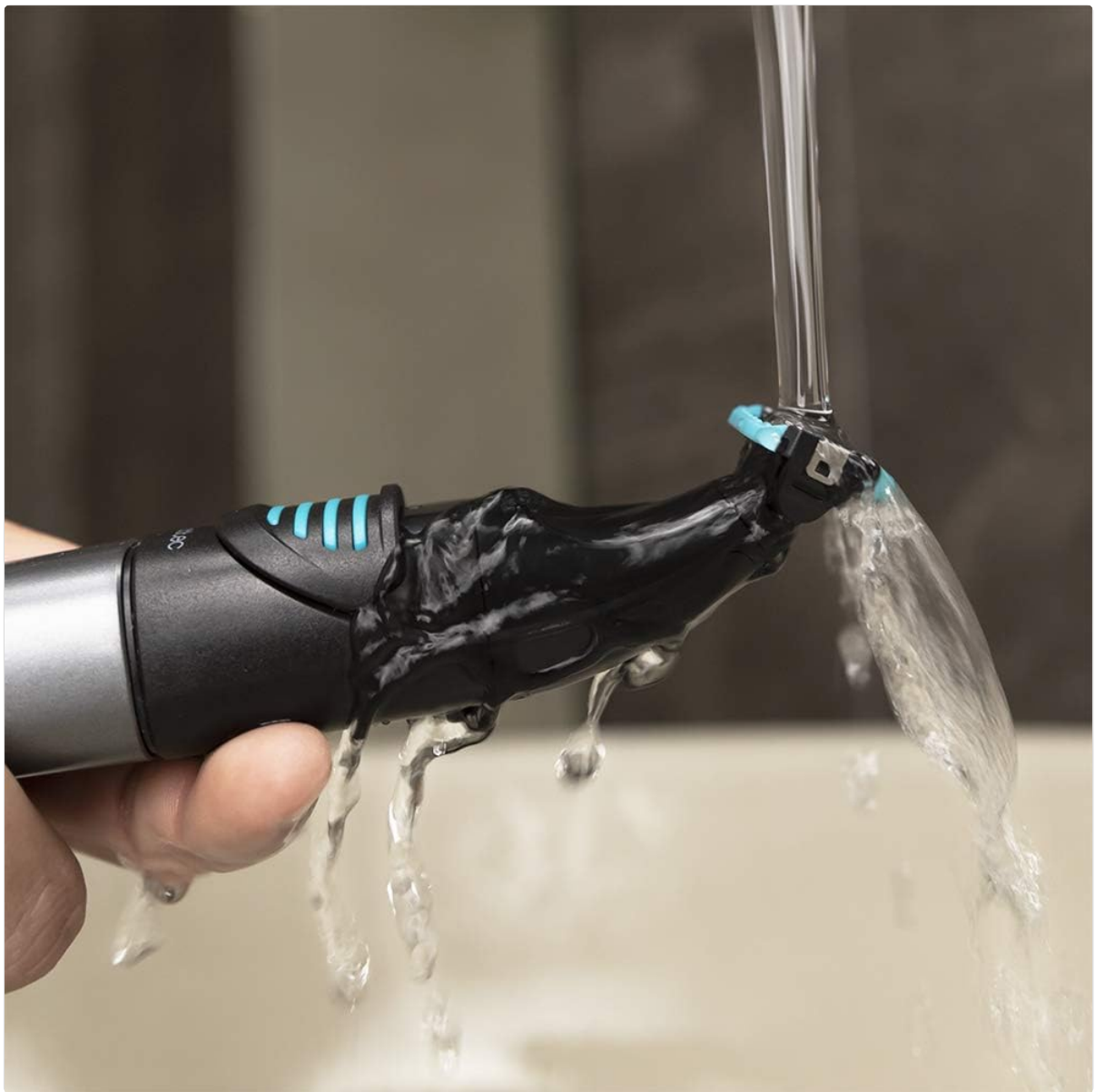
Image 6.1: Rinsing the shaver head under running water for cleaning.