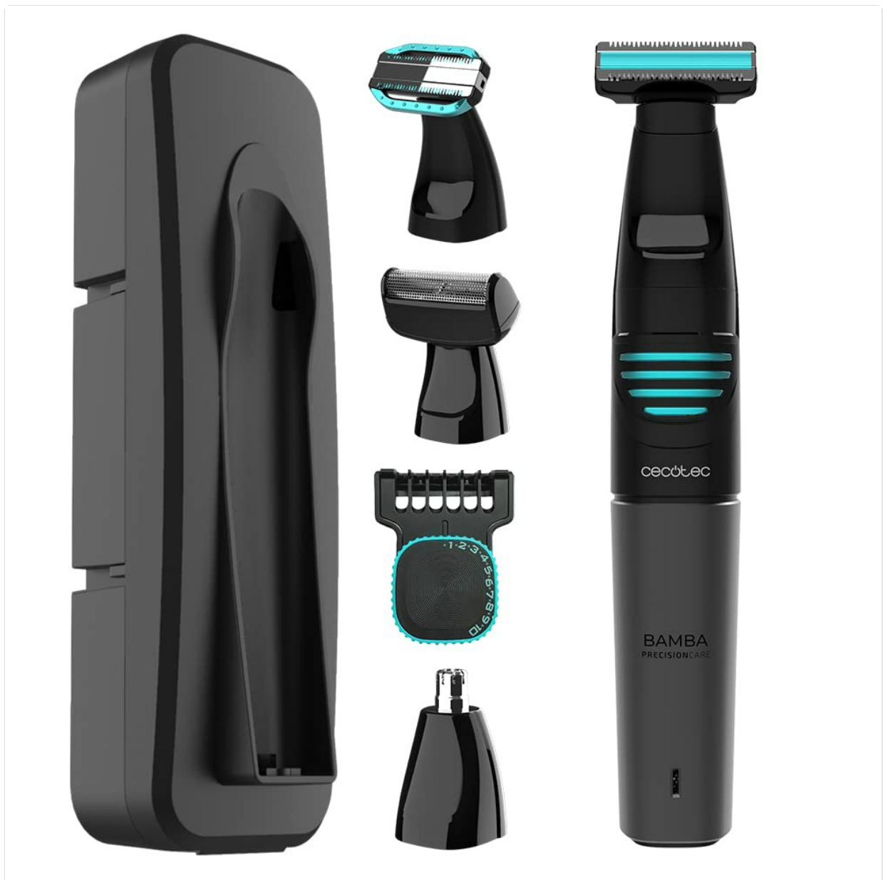
Image 1.1: Overview of the Cecotec Bamba PrecisionCare Extreme 5-in-1 Multifunction Shaver.