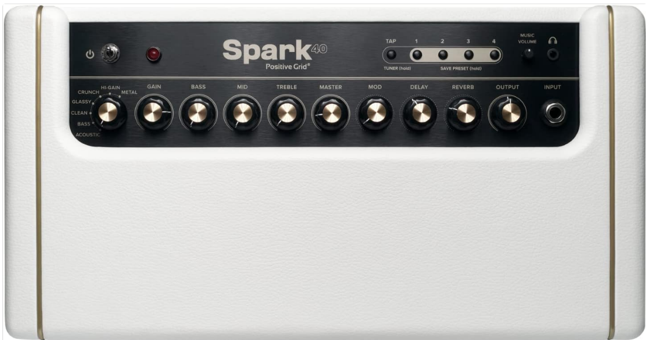
Image: Close-up of the Spark Pearl's top panel, detailing the controls for gain, EQ, effects, volume, and input jacks.

The top panel features controls for amplifier settings and input/output connections: