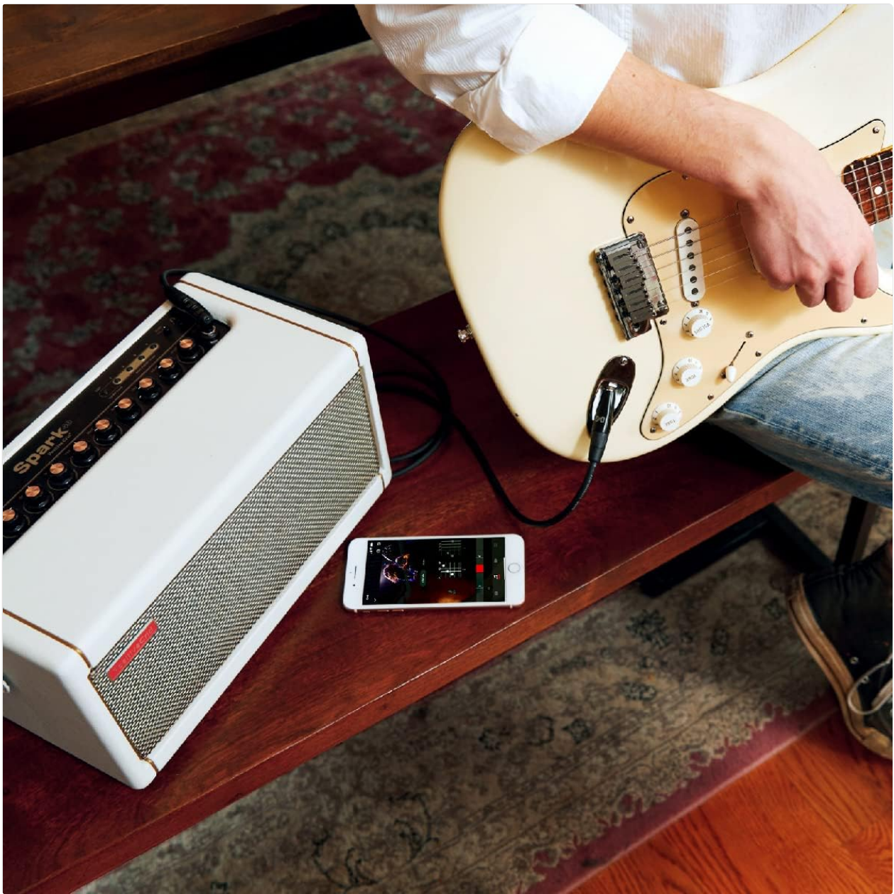
Image: A musician practicing with the Spark Pearl amplifier, using the mobile app for interactive learning.