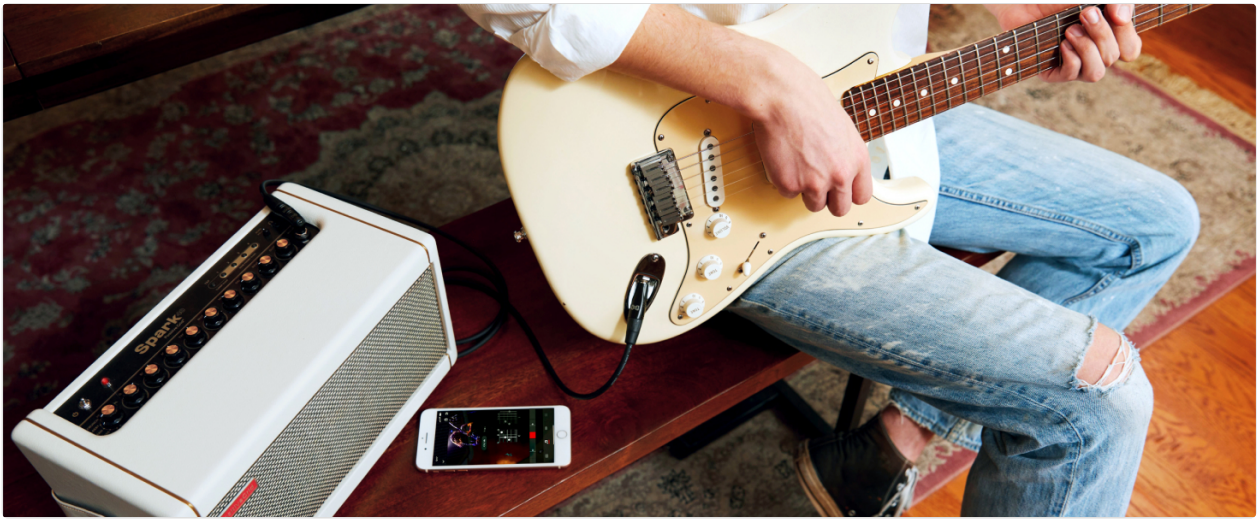
Image: The Spark Pearl amplifier set up for recording, connected to a laptop with a guitar and headphones.