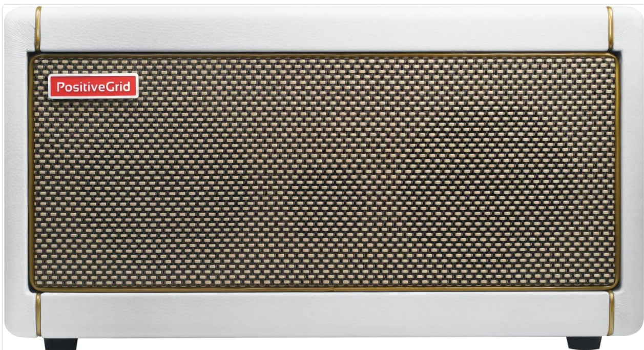
Image: Front view of the Spark Pearl amplifier, highlighting its speaker grille and branding.