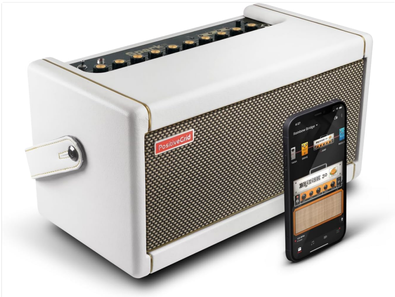
Image: The Spark Pearl amplifier shown with a smartphone connected to its mobile application.