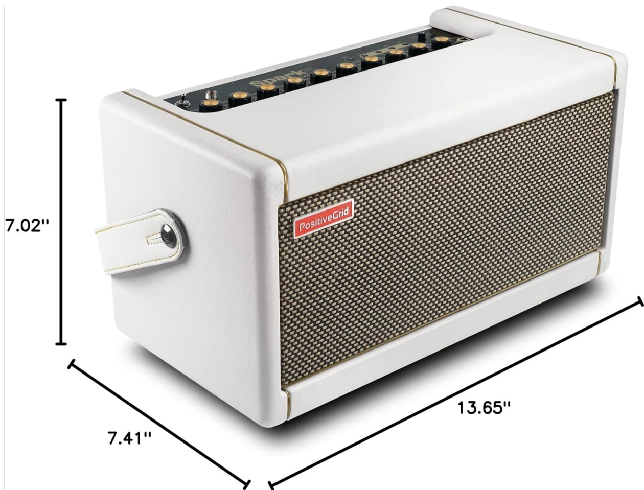
Image: The physical dimensions of the Spark Pearl amplifier are displayed.