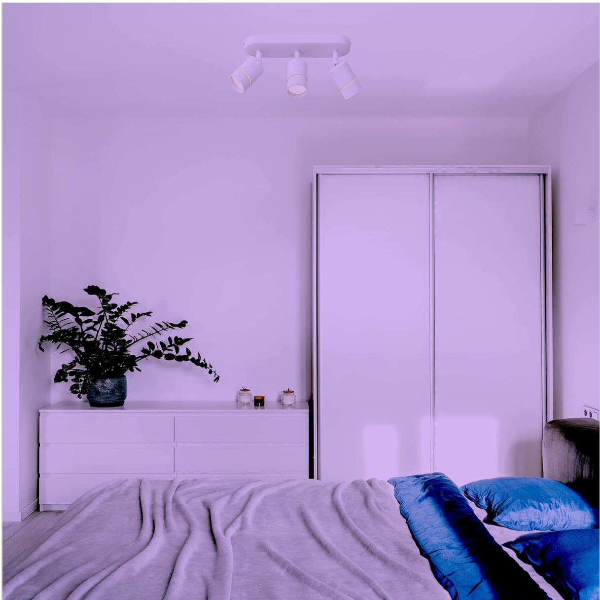
Image 5.2: The tint Nalo 3 spotlight set to a purple ambient light in a room.