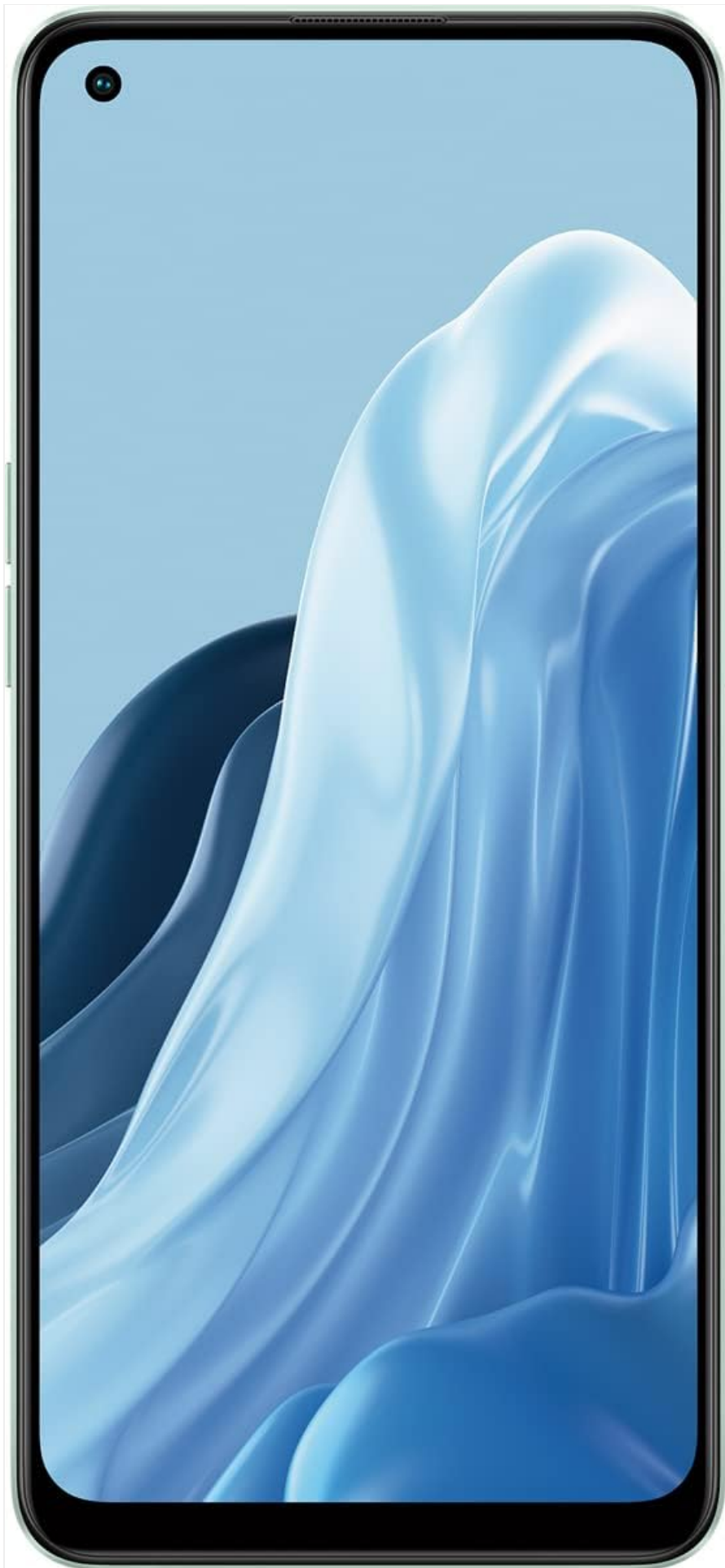
Figure 2.2: Front View of OPPO Reno7 Z. The front of the device features the full-screen display with a punch-hole camera cutout at the top left.