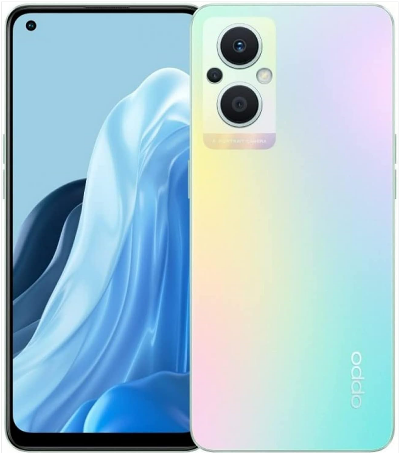
Figure 2.1: Front and Back View of OPPO Reno7 Z. This image displays the smartphone from both the front, showing the display, and the back, highlighting the camera module and the OPPO branding.