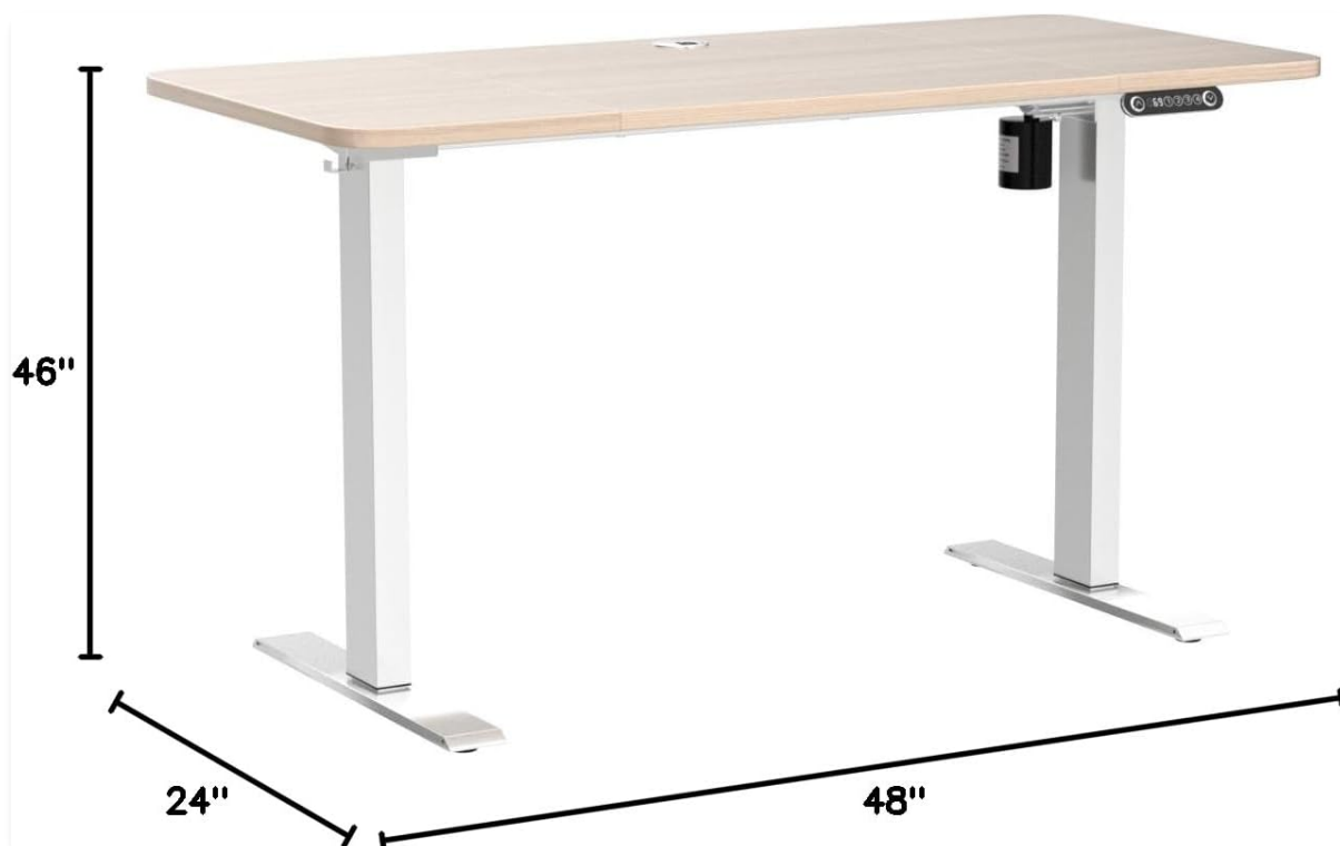
Image: Dimensional drawing of the farexon Electric Standing Desk, indicating its height, width, and depth.