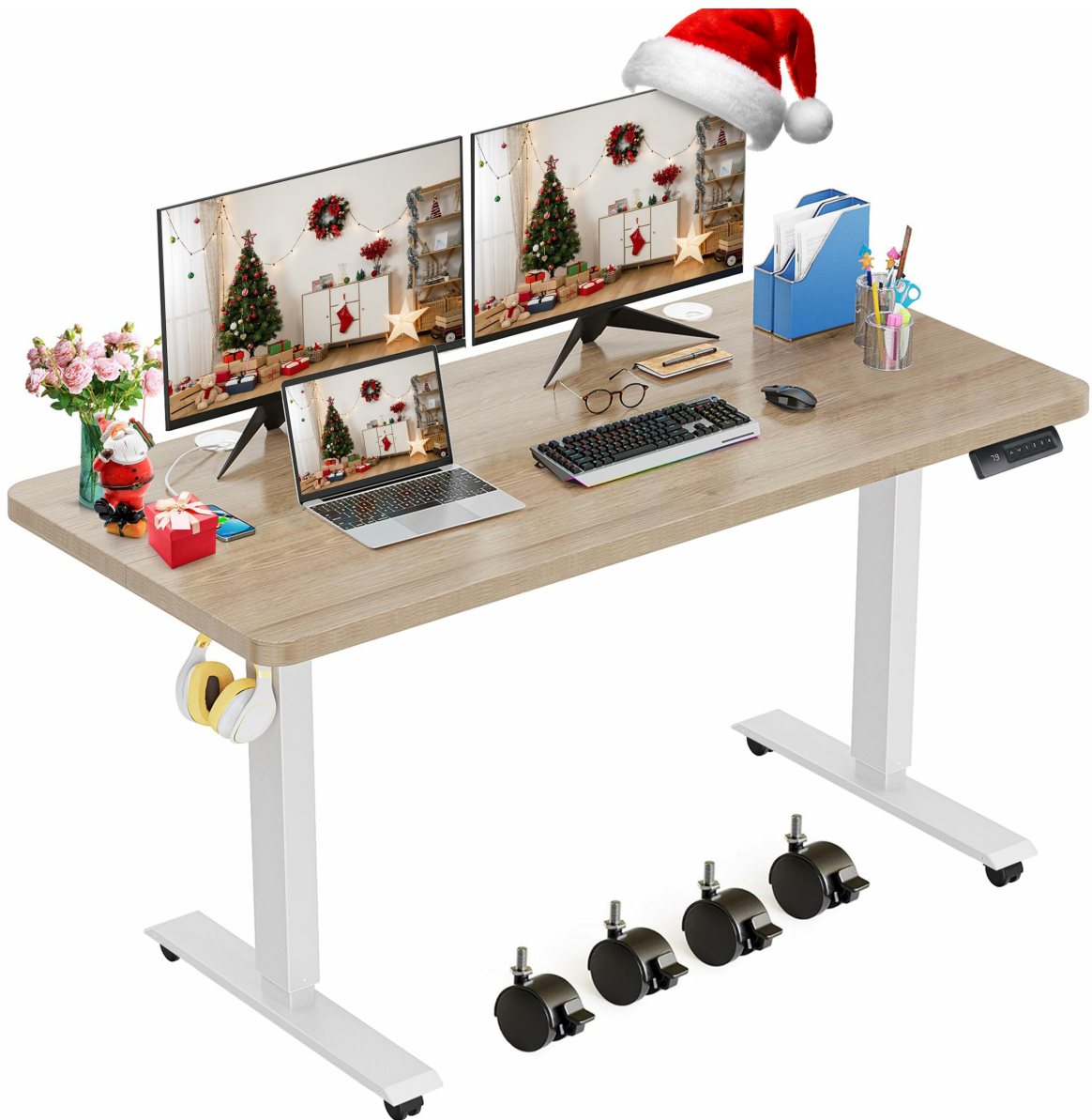
The farexon Electric Standing Desk in Oak Grey, showcasing its spacious desktop and modern design.