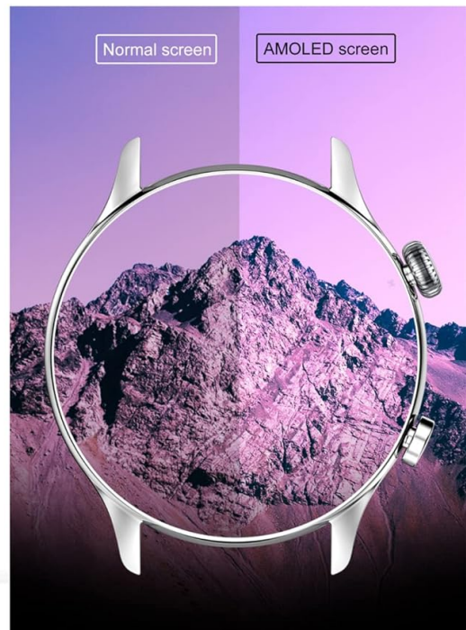
Image: The HK8 Pro Smart Watch displayed with different strap materials and colors, illustrating the interchangeable design. A comparison highlights the clarity of the AMOLED screen.

Retina-level AMOLED colorful large screen, 390*390 HD resolution, clearer, smoother, vivid and delicate.