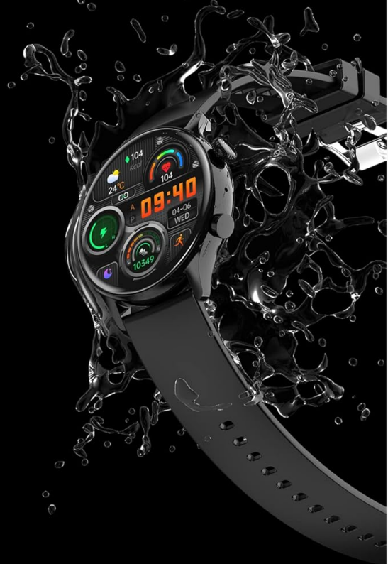
Image: The HK8 Pro Smart Watch shown submerged in water, illustrating its IP68 waterproof rating. Battery life estimates for typical use and standby are also displayed.

It can be used safely in daily life scenes such as hand washing and raining, and it can easily cope with the waterproof test.