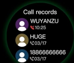
Image: Illustrations of the watch receiving messages and displaying options for dialing, answering, rejecting calls, and syncing contacts and call logs.