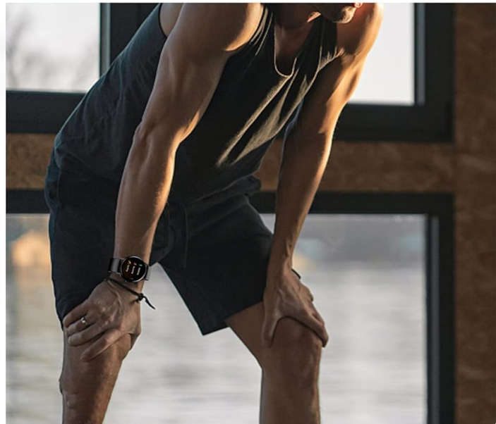
Image: The watch interface displaying routine exercise data and icons representing different sports modes like walking, running, and cycling.