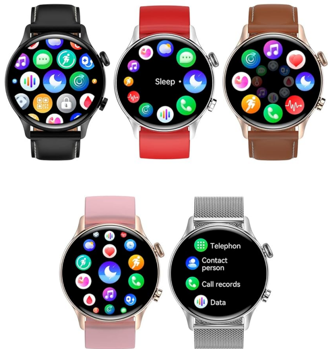
Image: Multiple watch faces and five distinct menu interface styles are shown, demonstrating customization options for the HK8 Pro Smart Watch.

There are 5 sets of built-in menu interfaces, with different styles for you to choose.