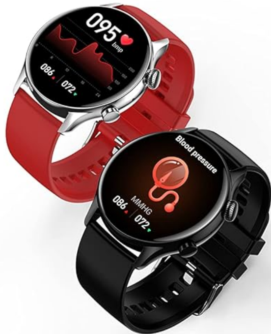
Image: Visuals demonstrating the watch's capabilities in monitoring heart rate, analyzing sleep quality, and measuring blood oxygen and blood pressure levels.

It helps you to understand your health status more clearly, better regulate your life pressure, and check your heart rate, blood pressure, and blood oxygen at a glance, and you can check your heart rate changes through the App every day.