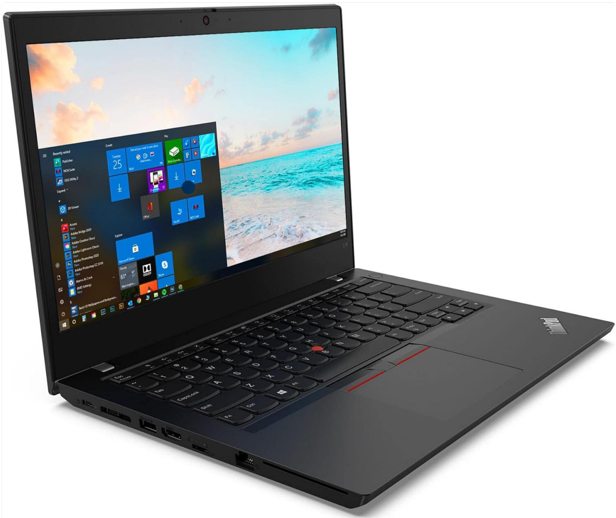
Image: The left side of the laptop, displaying ports such as USB-C (Thunderbolt 4), USB-A, HDMI, and the audio jack.