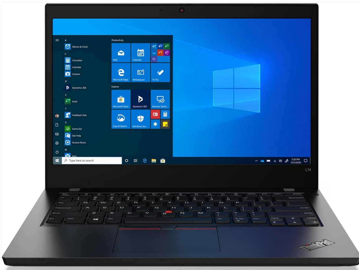
Image: The Lenovo ThinkPad L14 Gen 2 laptop, open with the Windows desktop visible on its screen.

This manual provides essential information for setting up, operating, maintaining, and troubleshooting your Lenovo ThinkPad L14 Gen 2 laptop. This device is designed for business and general computing tasks, featuring an Intel i5-1135G7 processor, 16GB of RAM, a 512GB PCIe SSD, and Windows 11 Pro operating system. Please read this manual thoroughly to ensure proper use and longevity of your product.