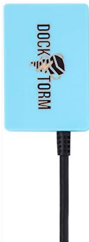
Image: The included light blue Dockzorm USB hub, which provides additional USB ports for peripherals.