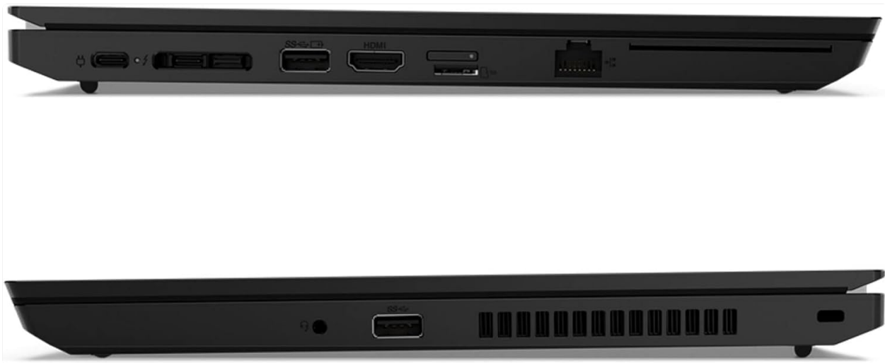
Image: The right side of the laptop, showing additional ports including a USB-A port and the Ethernet (RJ-45) port.