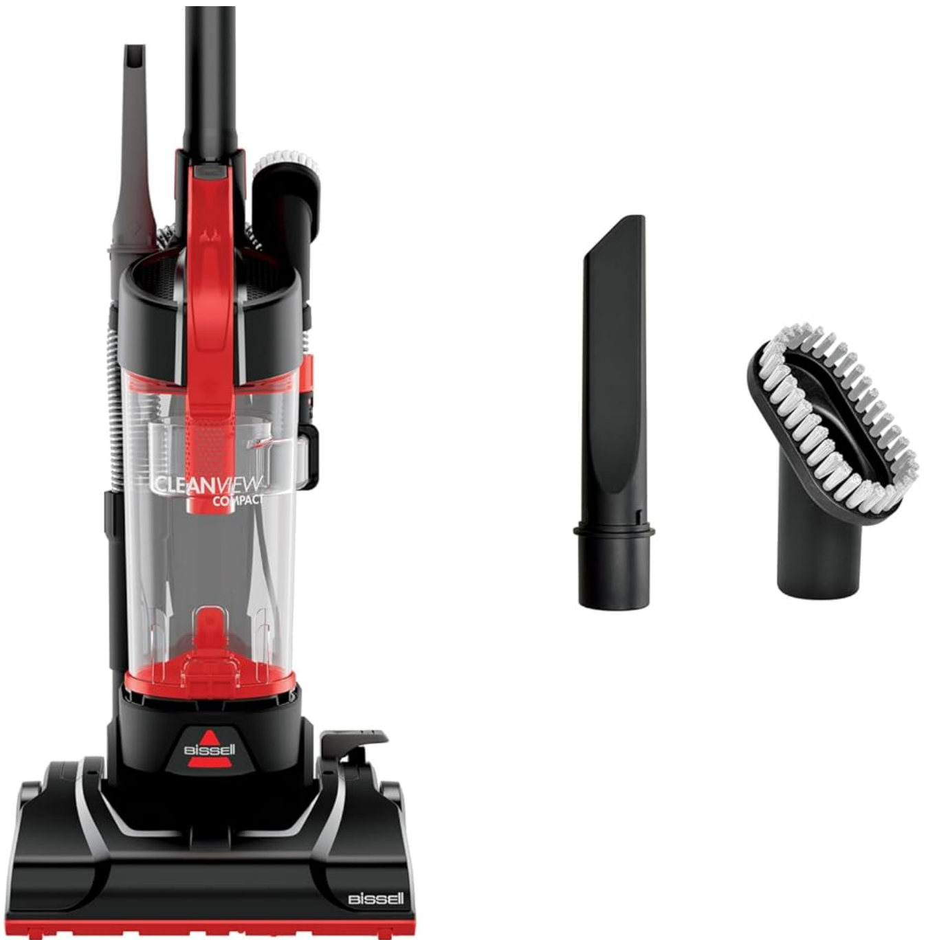
Figure 1.1: The Bissell CleanView Compact Upright Vacuum, showcasing its main unit, crevice tool, and dusting brush.