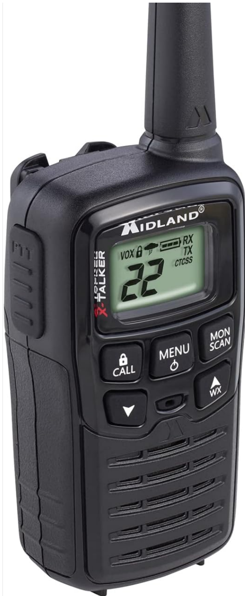
Figure 1: Midland T10 Walkie Talkie, angled front view showing display and buttons.