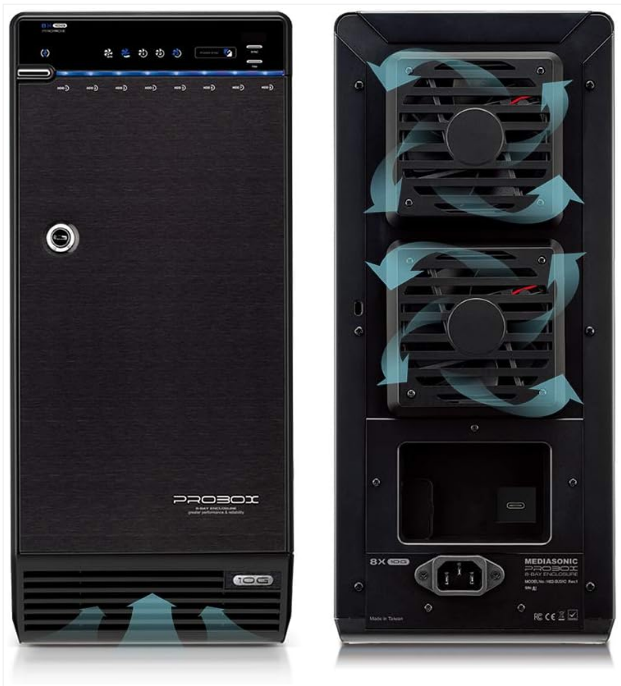
Image: Front and rear views of the Mediasonic H82-SU3S3 enclosure, illustrating the airflow path through the unit for effective cooling of the hard drives.