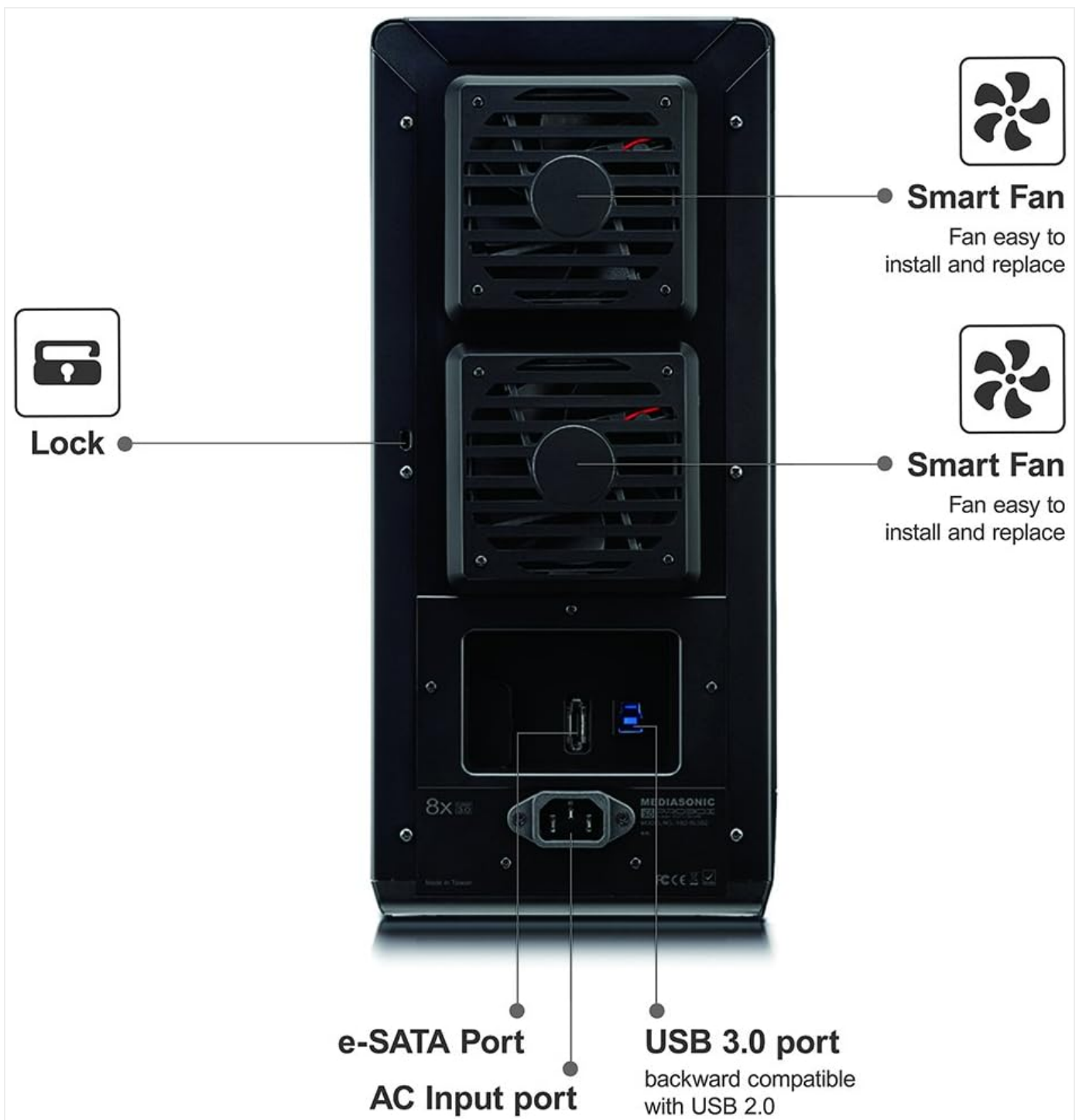
Image: The rear panel of the Mediasonic H82-SU3S3 enclosure, clearly labeling the eSATA port, USB 3.0 port, AC input port, and smart fans.