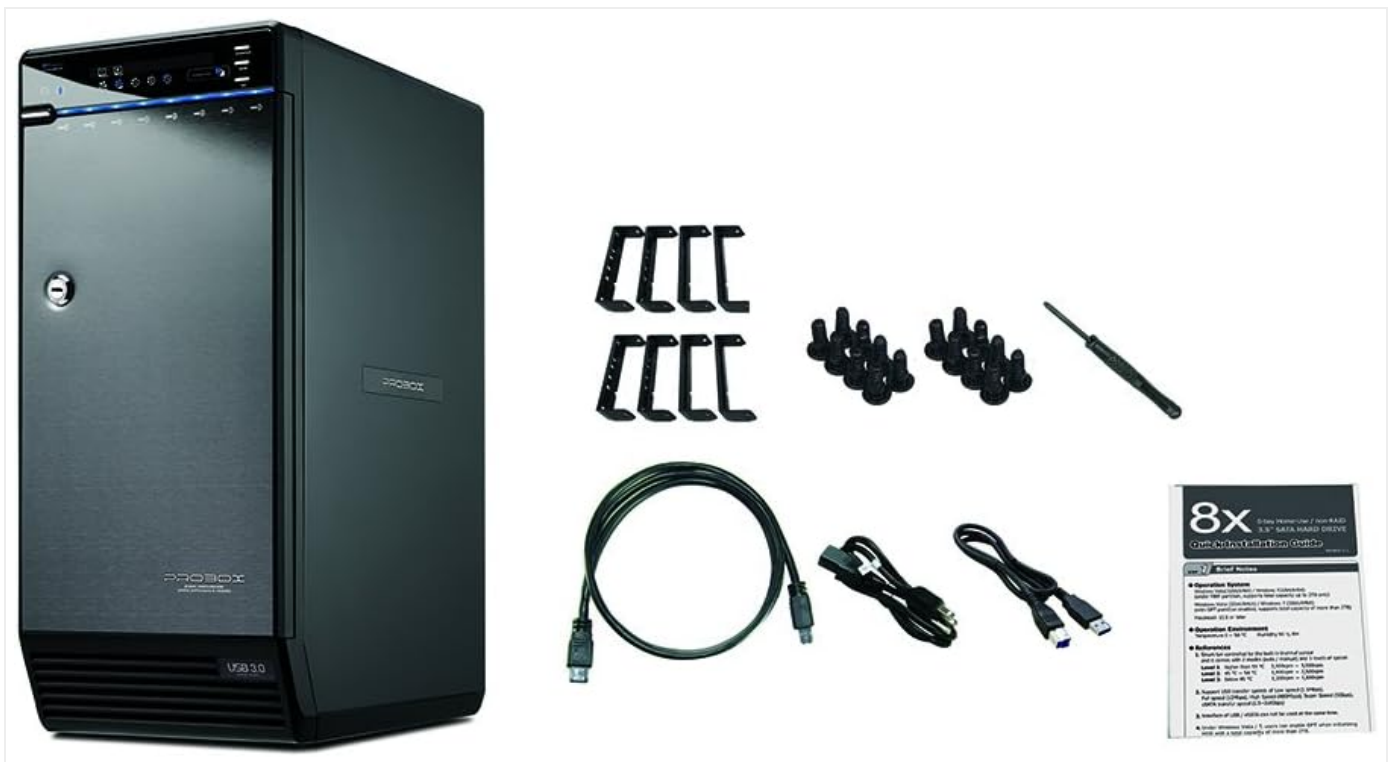
Image: The Mediasonic H82-SU3S3 enclosure shown alongside its included accessories, which typically consist of a power adapter, USB 3.0 cable, eSATA cable, mounting screws, and a user manual.