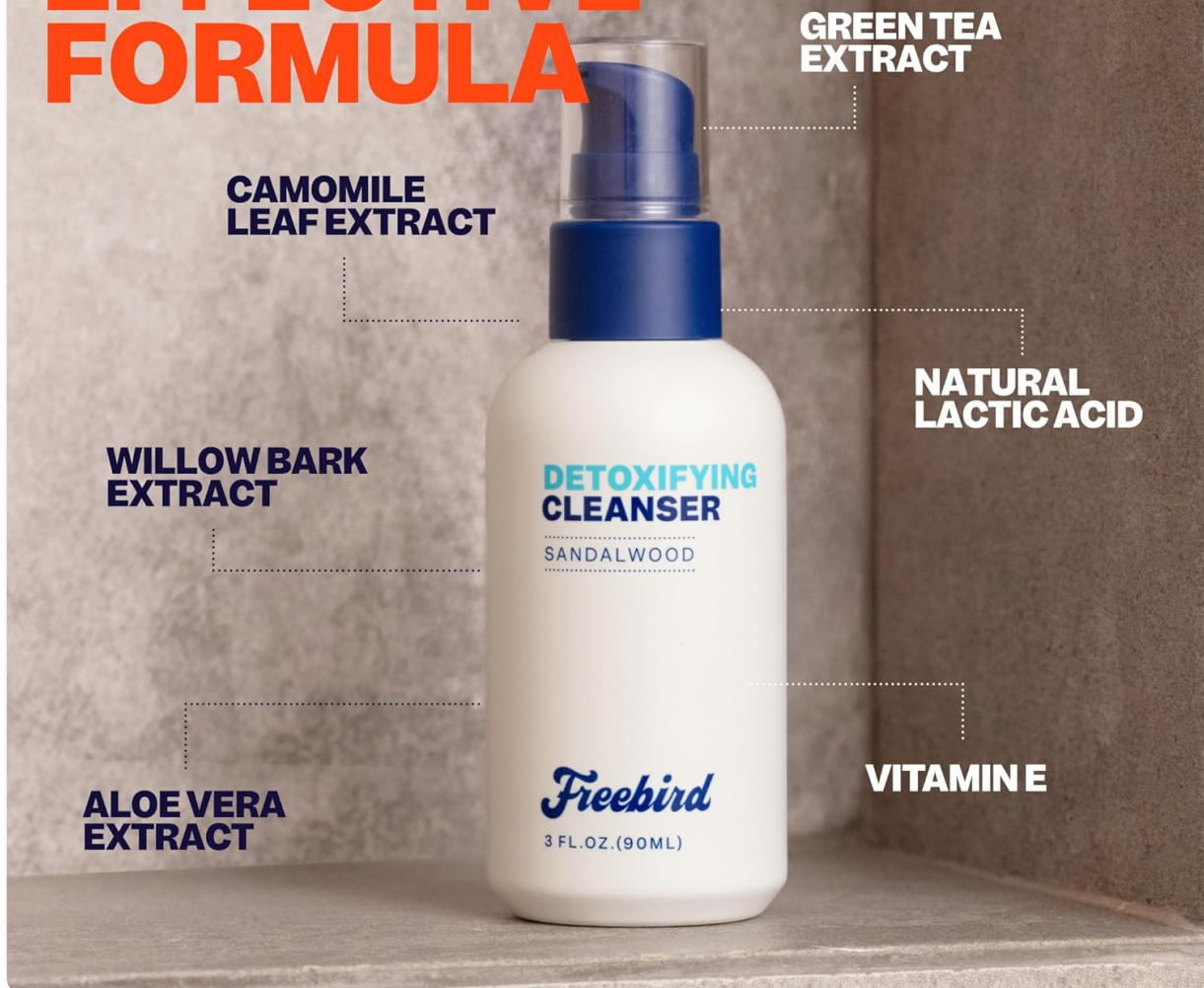
Image 2: Freebird Detoxifying Scalp Cleanser highlighting key ingredients like Green Tea Extract, Chamomile Leaf Extract, Willow Bark Extract, Aloe Vera Extract, Natural Lactic Acid, and Vitamin E.