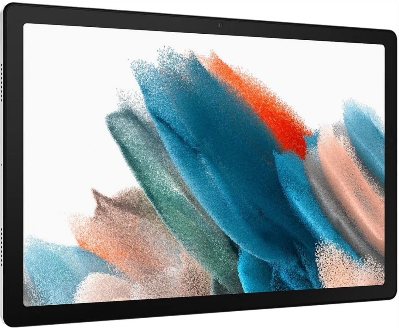
Figure 4: Top edge of the Samsung Galaxy Tab A8. This view displays the power/lock button, volume rocker, and a microphone opening.