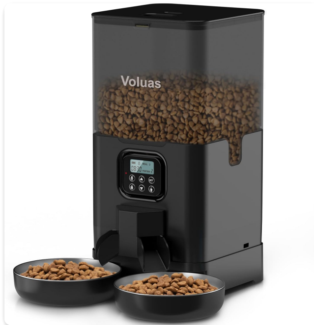
Figure 1: The Voluas Automatic Cat Feeder, showcasing its main unit and two stainless steel feeding bowls.

The Voluas Automatic Cat Feeder is designed to provide scheduled and portion-controlled meals for up to two cats, ensuring a consistent and healthy feeding routine. This 6-liter capacity feeder features a dual-bowl design, voice recording functionality, and a reliable anti-clogging system. It offers convenience and peace of mind for pet owners.