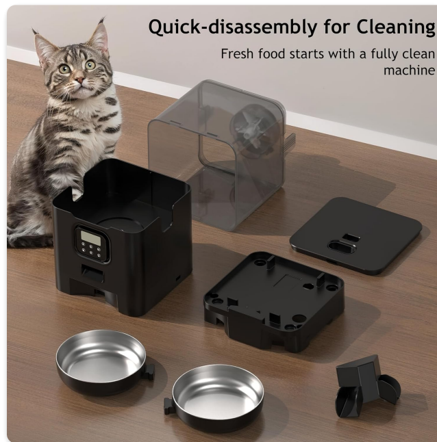
Figure 2: Disassembled components of the feeder for cleaning and maintenance.