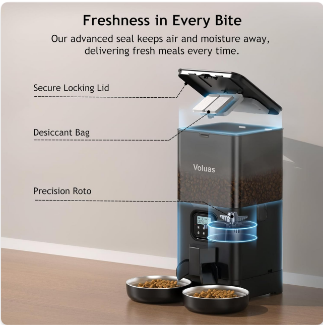
Figure 6: Internal components designed for food freshness.