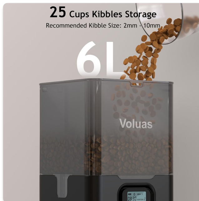
Figure 3: Filling the 6-liter food container with dry kibble.