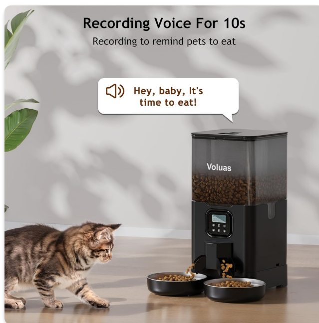
Figure 5: Voice recording feature to call your pets.