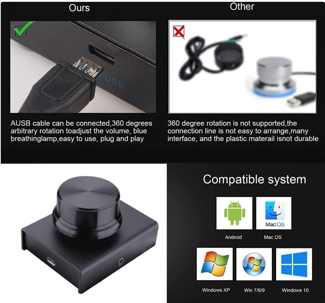
Figure 4: Image illustrating the broad compatibility of the USB Volume Control Knob with various operating systems including Android, Mac OS, Windows XP, Windows 7/8/9, and Windows 10.