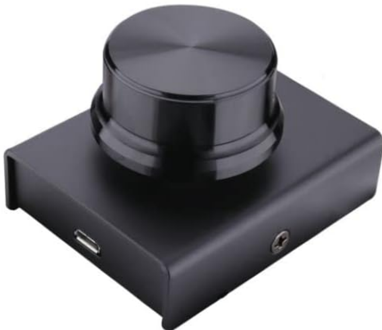
Figure 3: Visual guide illustrating the different operational modes of the USB Volume Control Knob: rotate for volume, press for mute, press and rotate for track control, and long press for night mode.

(Breathing light only lights up when press the knob under default mode, the night mode is in convenient for you to use at night)