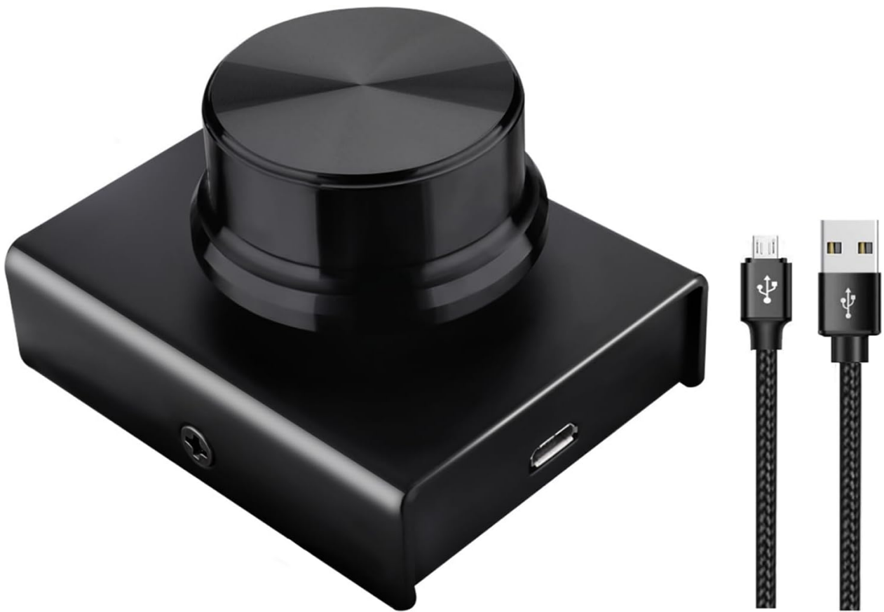
Figure 1: Front view of the TIZOPO USB Volume Control Knob, showcasing its sleek design and the central rotary knob.