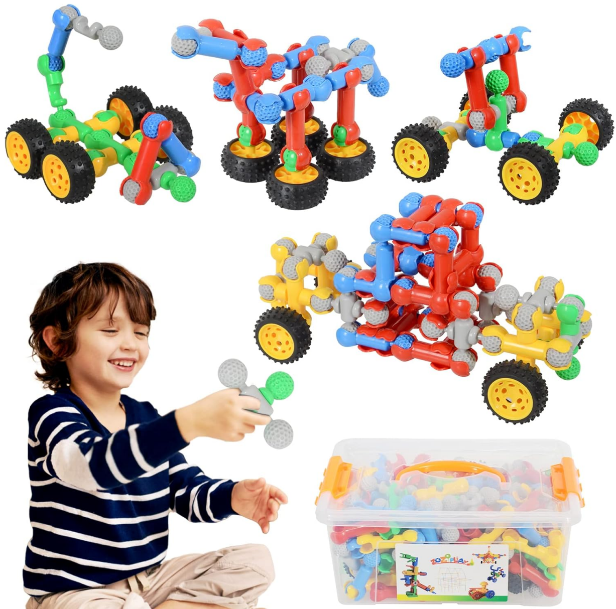
Image: The complete ZOZOPLAY 160 Pcs Connector Blocks Set, showcasing various assembled models like vehicles and creatures, alongside the clear plastic storage container filled with colorful pieces.