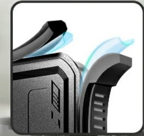
Image: The case features reinforced corners designed to absorb shock and withstand extreme drops, providing enhanced protection for your device.