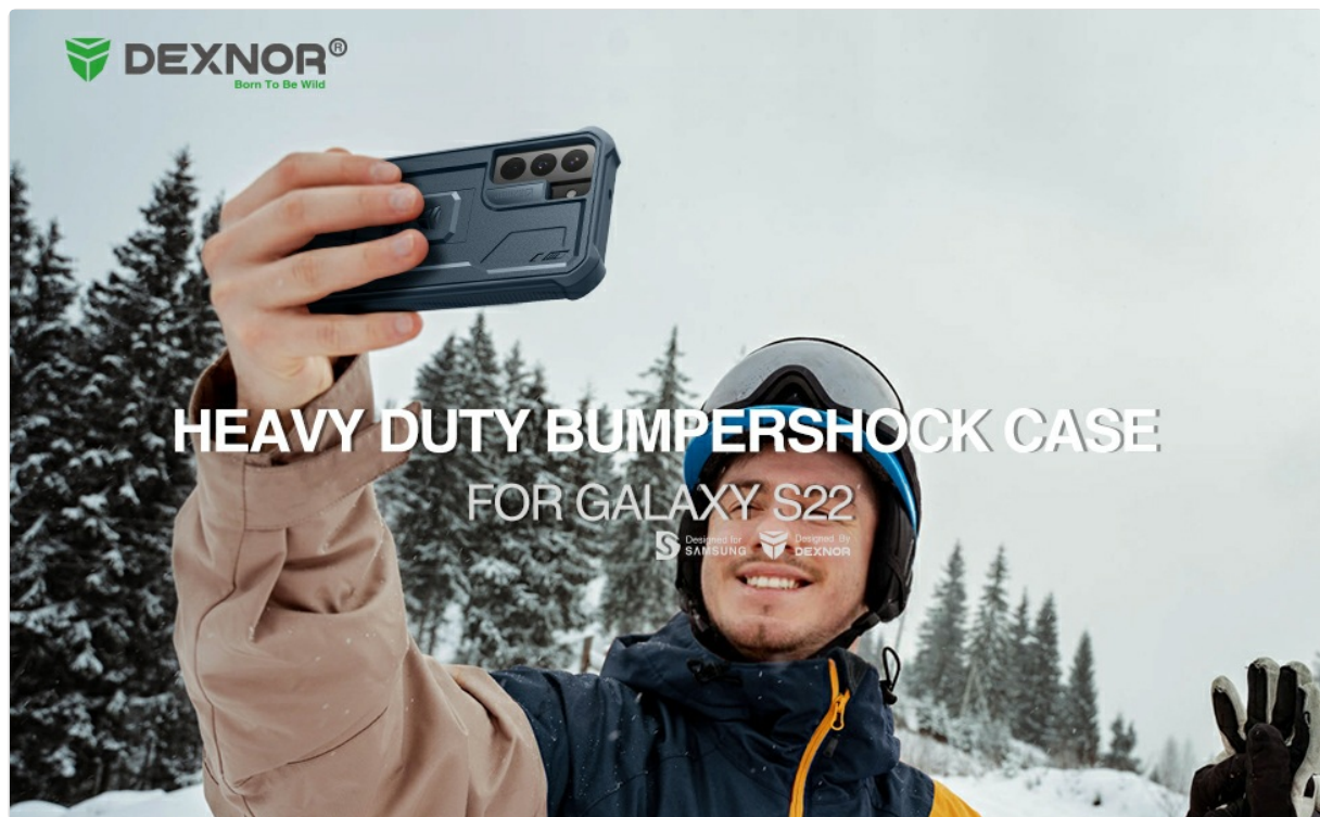
Image: This case is exclusively designed for the Samsung Galaxy S22 5G (6.1"). It is not compatible with other Samsung Galaxy S series models like S21, S22+, or S22 Ultra.

This case is specifically designed for the Samsung Galaxy S22 5G (6.1") . It is not compatible with Samsung Galaxy S21, Samsung Galaxy S22+, or Samsung Galaxy S22 Ultra.