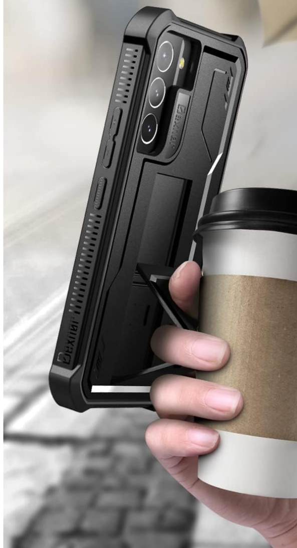
Image: A user demonstrating how to deploy the kickstand, which can also function as a ring holder for a secure grip.

Free up your hand to hold something else