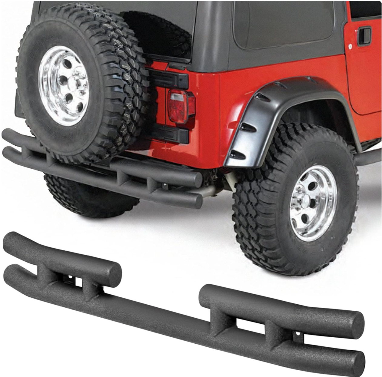
Image: Quadratec QR3 Dual Tube Rear Bumper installed on a Jeep Wrangler.