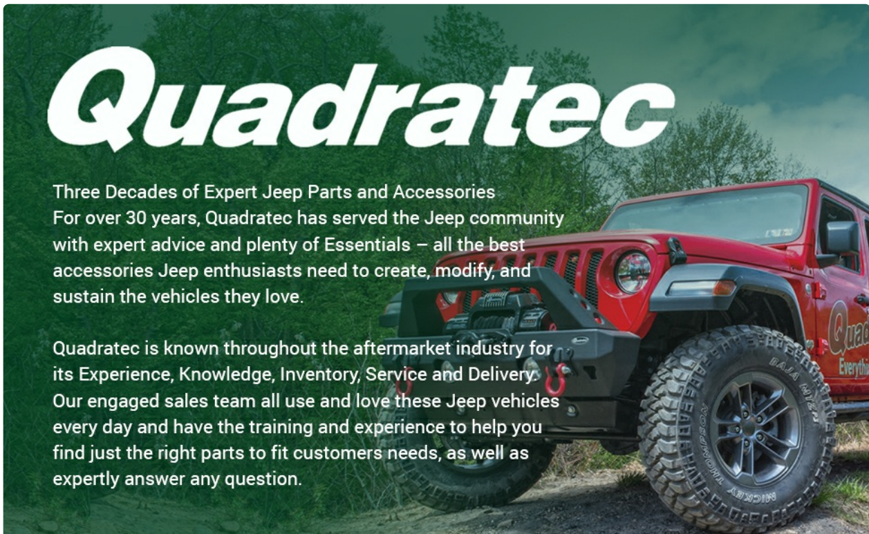
Image: Quadratec - Three Decades of Expert Jeep Parts and Accessories.

Quadratec Contact Information: Please refer to the official Quadratec website or your purchase documentation for the most current contact details (phone, email, or online support portal).