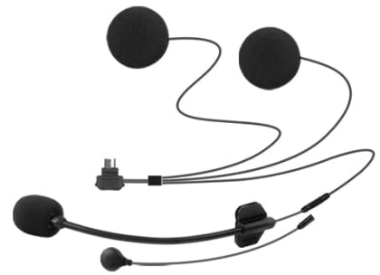
2 in 1 Microphone & Speakers