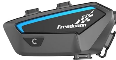
Bluetooth Main Unit