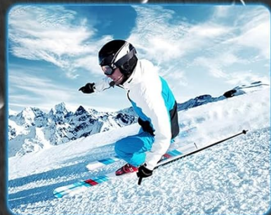
Image: The FreedConn FX headset is shown to be IP67 waterproof and dustproof, functioning reliably in rain, snow, and muddy conditions.