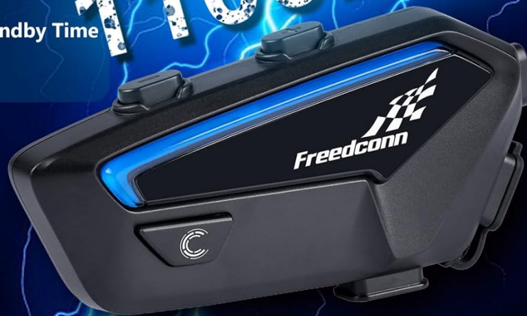
Image: The FreedConn FX headset highlighting its 1100mAh large-capacity battery, with details on 2.5 hours charging time, 30 hours talking time, and 720 hours standby time.