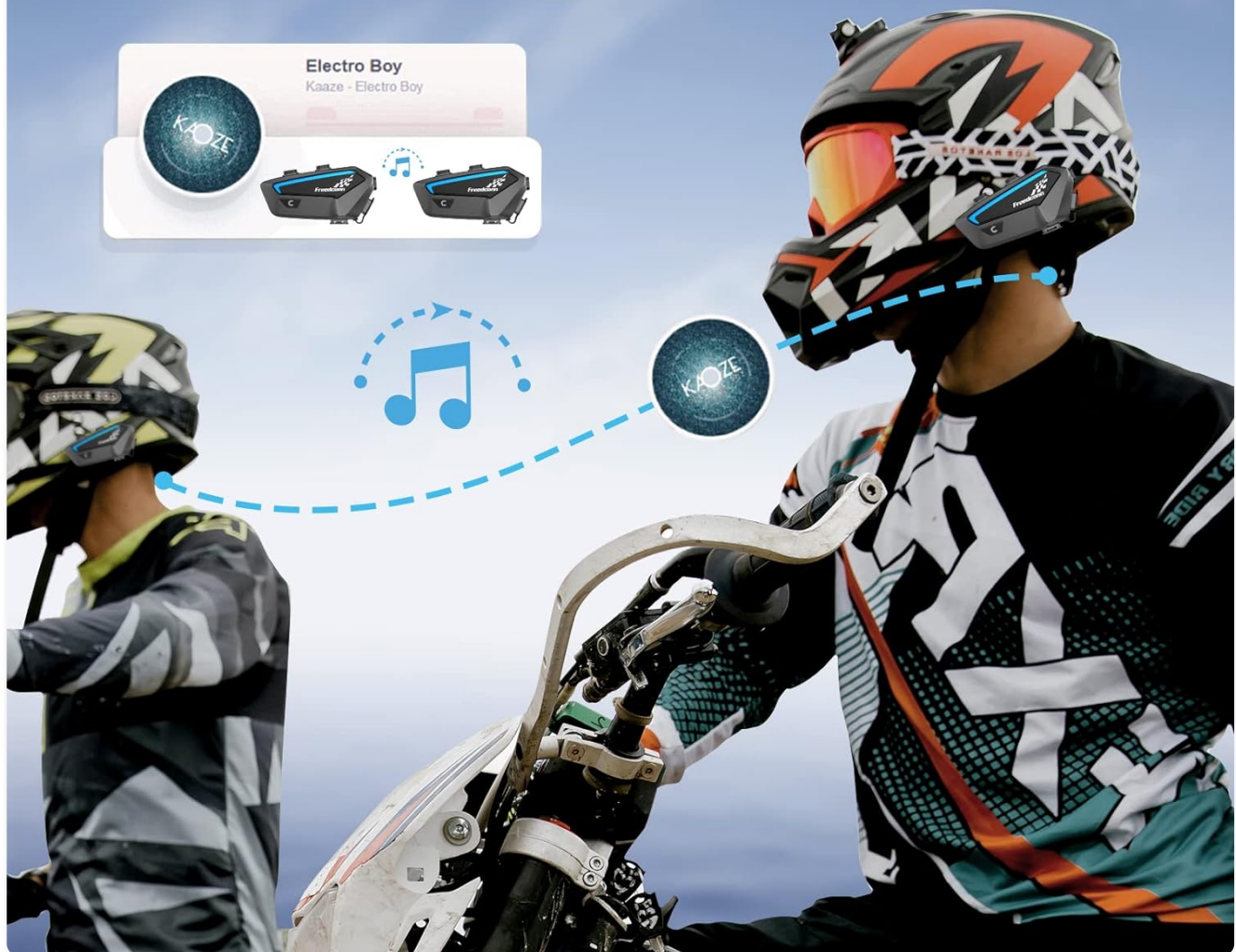
Image: Two motorcyclists sharing and enjoying the same music wirelessly via their FreedConn FX headsets.

Share and enjoy same song with your riders together.