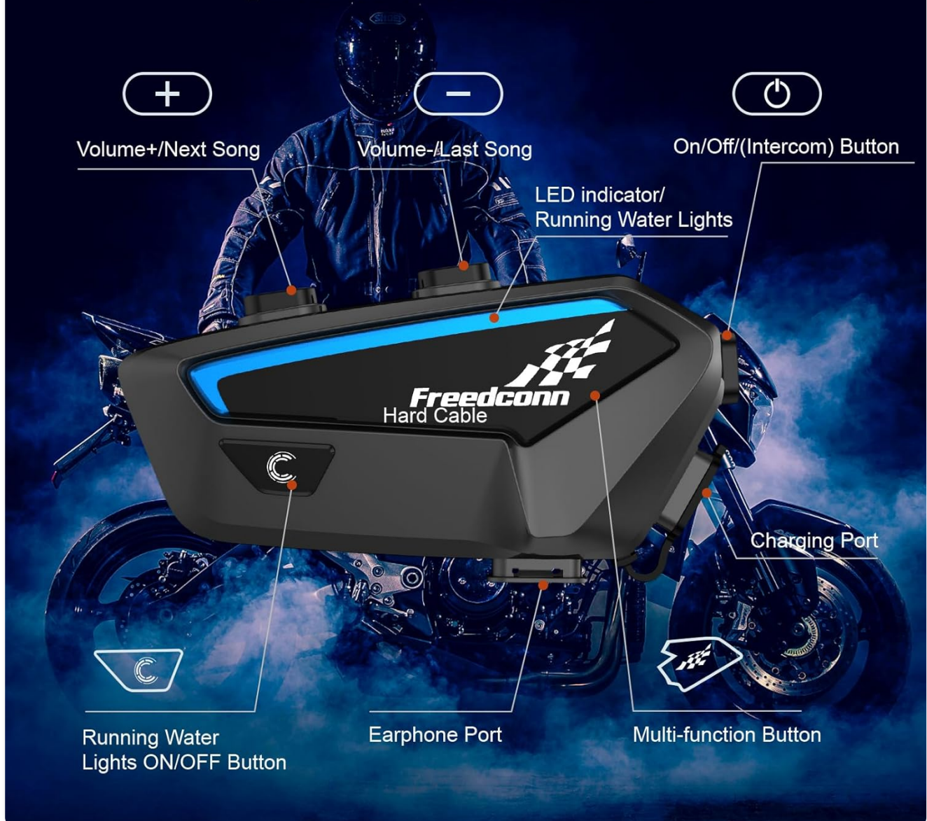
Image: Detailed diagram illustrating the buttons and ports on the FreedConn FX unit, including volume controls, multi-function button, charging port, and earphone port.