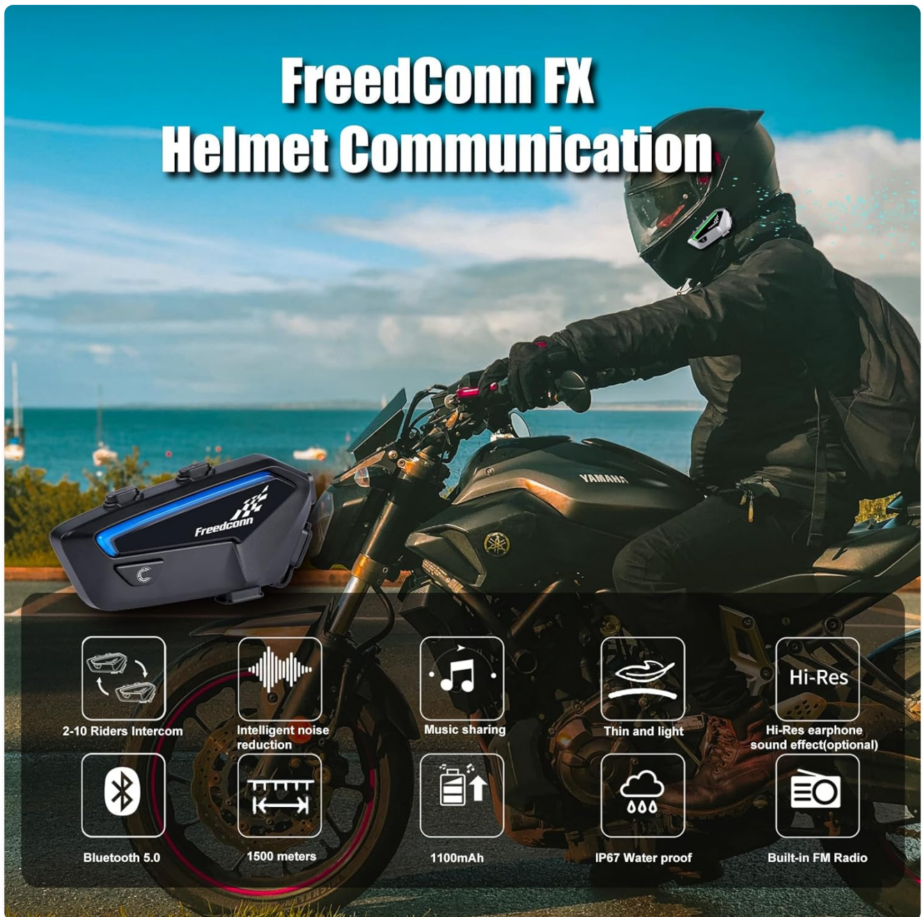
Image: FreedConn FX Helmet Communication system mounted on a motorcycle helmet, highlighting its sleek design and integration.