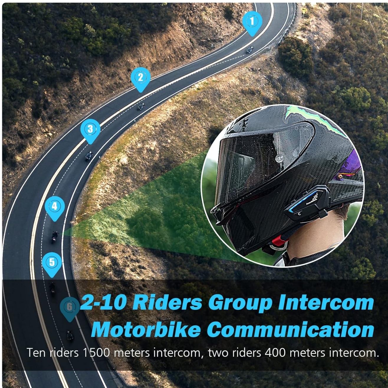
Image: Illustration of 2-10 riders group intercom communication, showing multiple motorcyclists on a road.