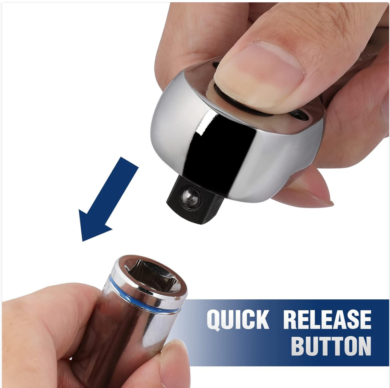
Image 4.2: Examples of the WORKPRO ratchets being used in different maintenance and repair tasks.