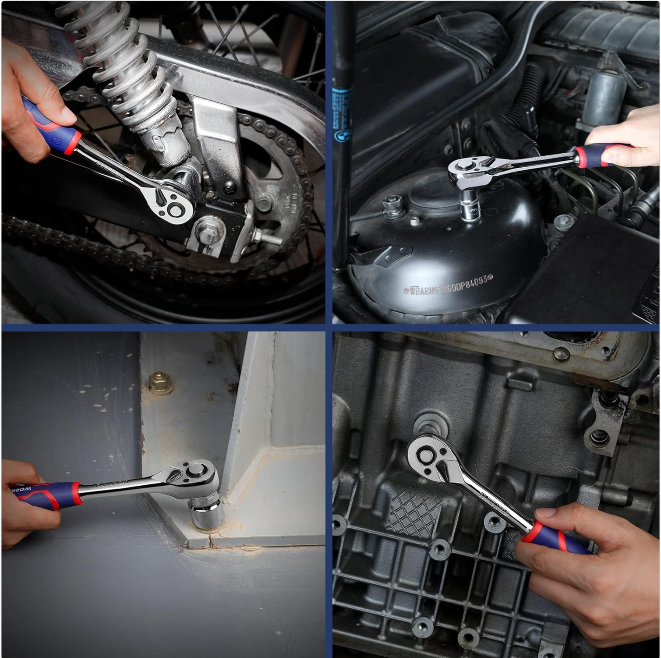
Image 3.1: Demonstrating the quick release button for attaching a socket.