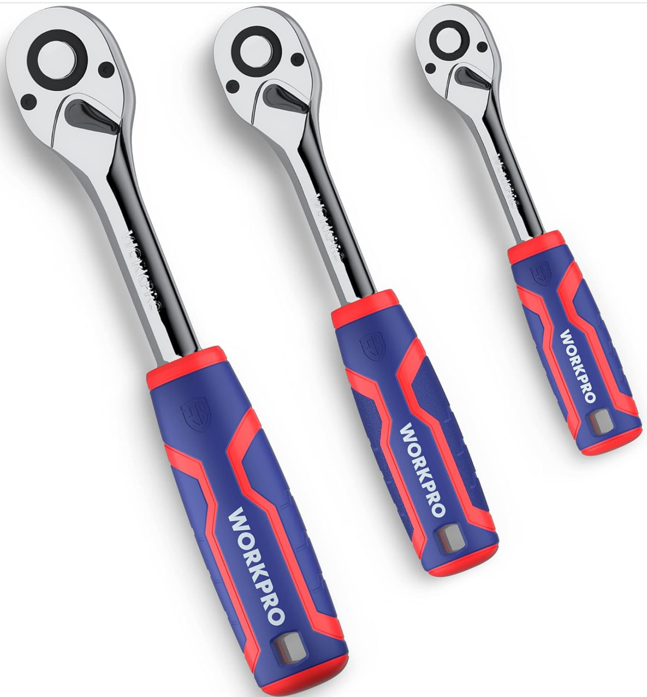
Image 1.1: The WORKPRO 3-Piece Ratchet Set, featuring 1/4", 3/8", and 1/2" drive ratchets.