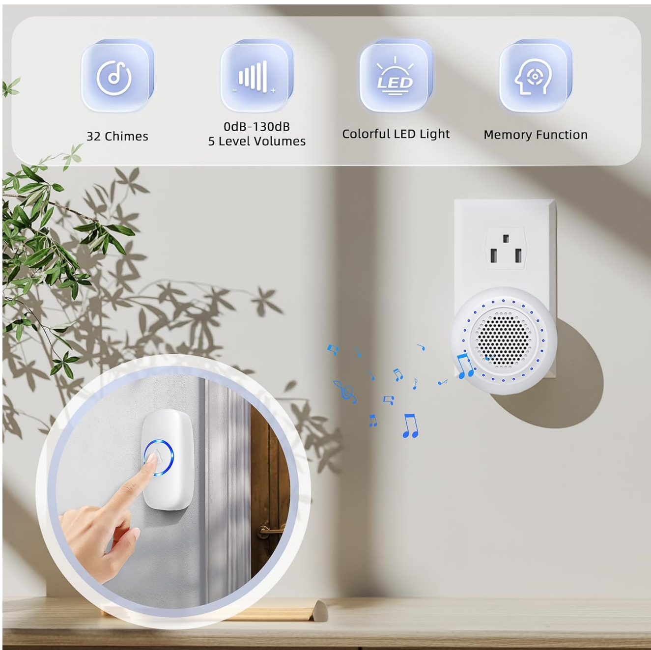
Image: The compact receiver plugged into a wall outlet, ready for use.