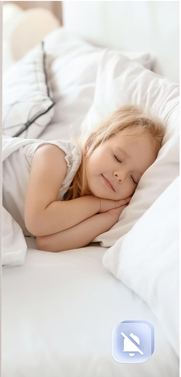
Image: The mute mode with colorful LED flash is ideal for not disturbing sleeping children or for those with hearing impairments.