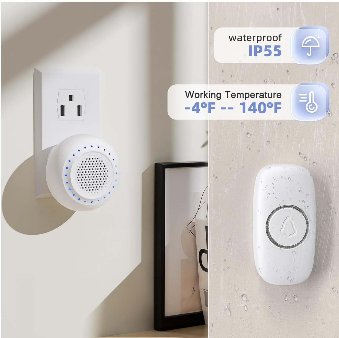
Image: The transmitter's IP55 waterproof rating ensures durability in diverse weather conditions.