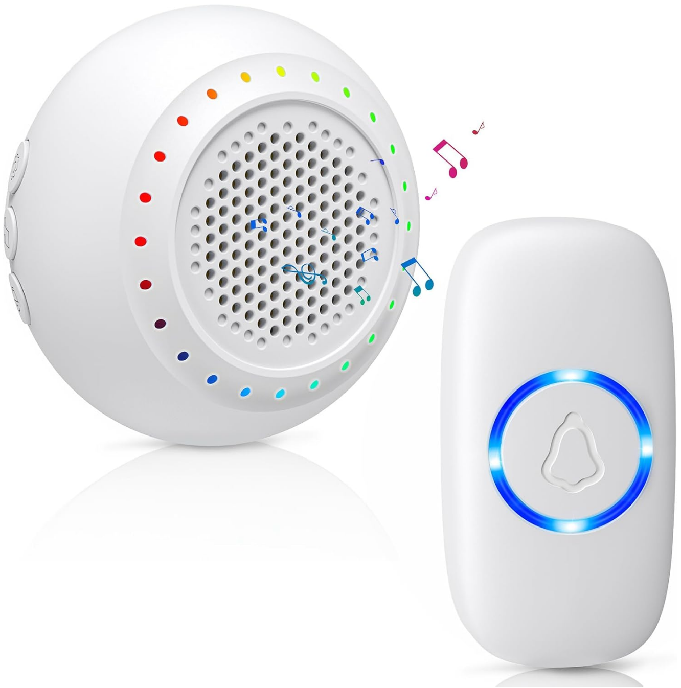
Image: The complete PHYSEN Wireless Doorbell Kit, including the transmitter and receiver.