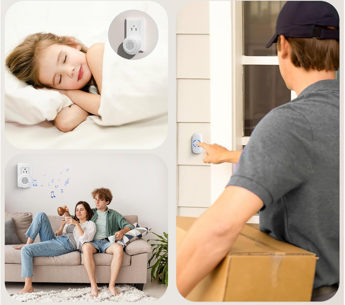
Image: The doorbell offers 32 chimes, suitable for different situations like not disturbing a sleeping baby or alerting to a delivery.