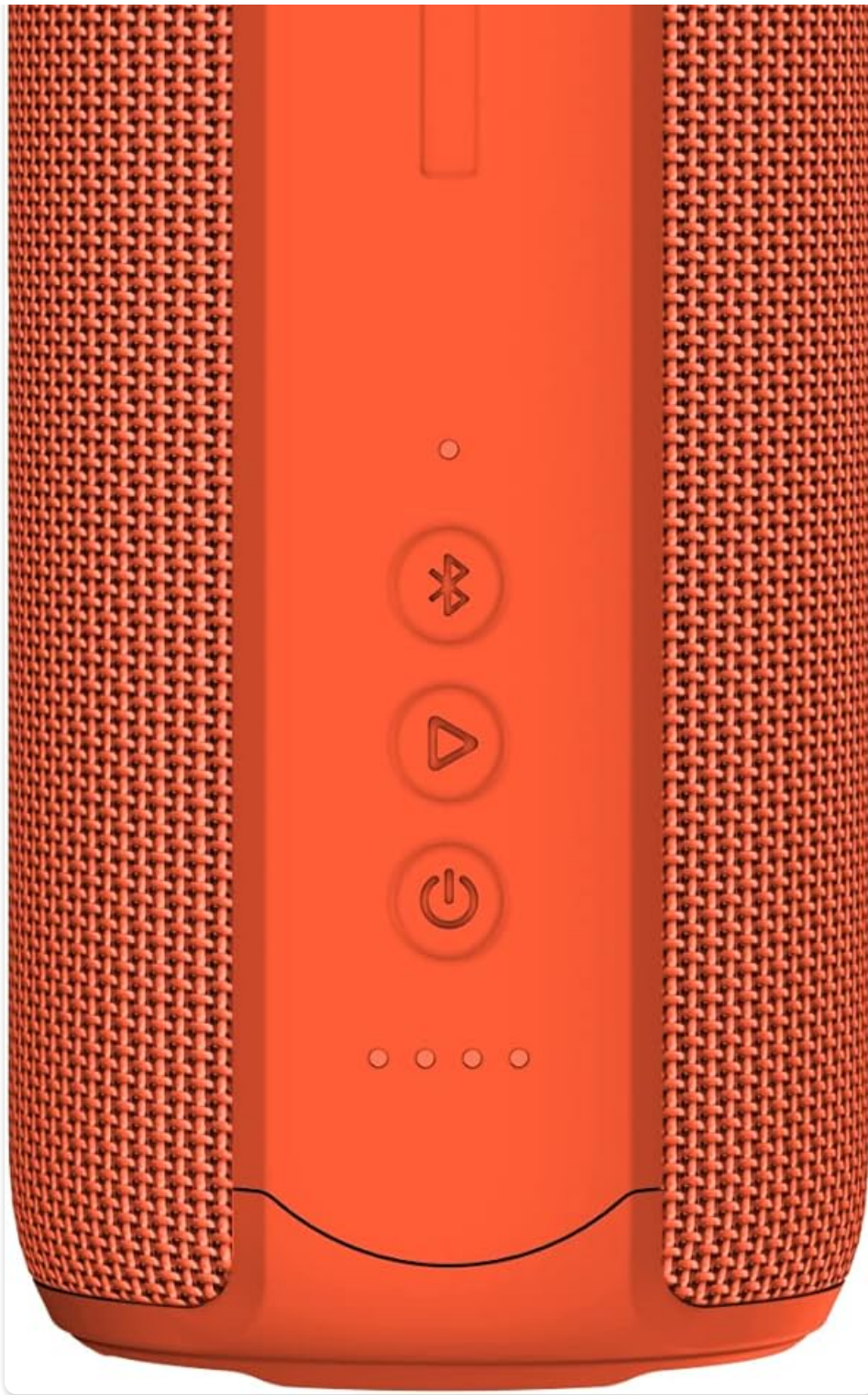
Figure 1: Sonitrek Go XL Speaker. This image displays the front of the Sonitrek Go XL speaker, highlighting its control panel with buttons for power, Bluetooth pairing, volume adjustment, and playback.