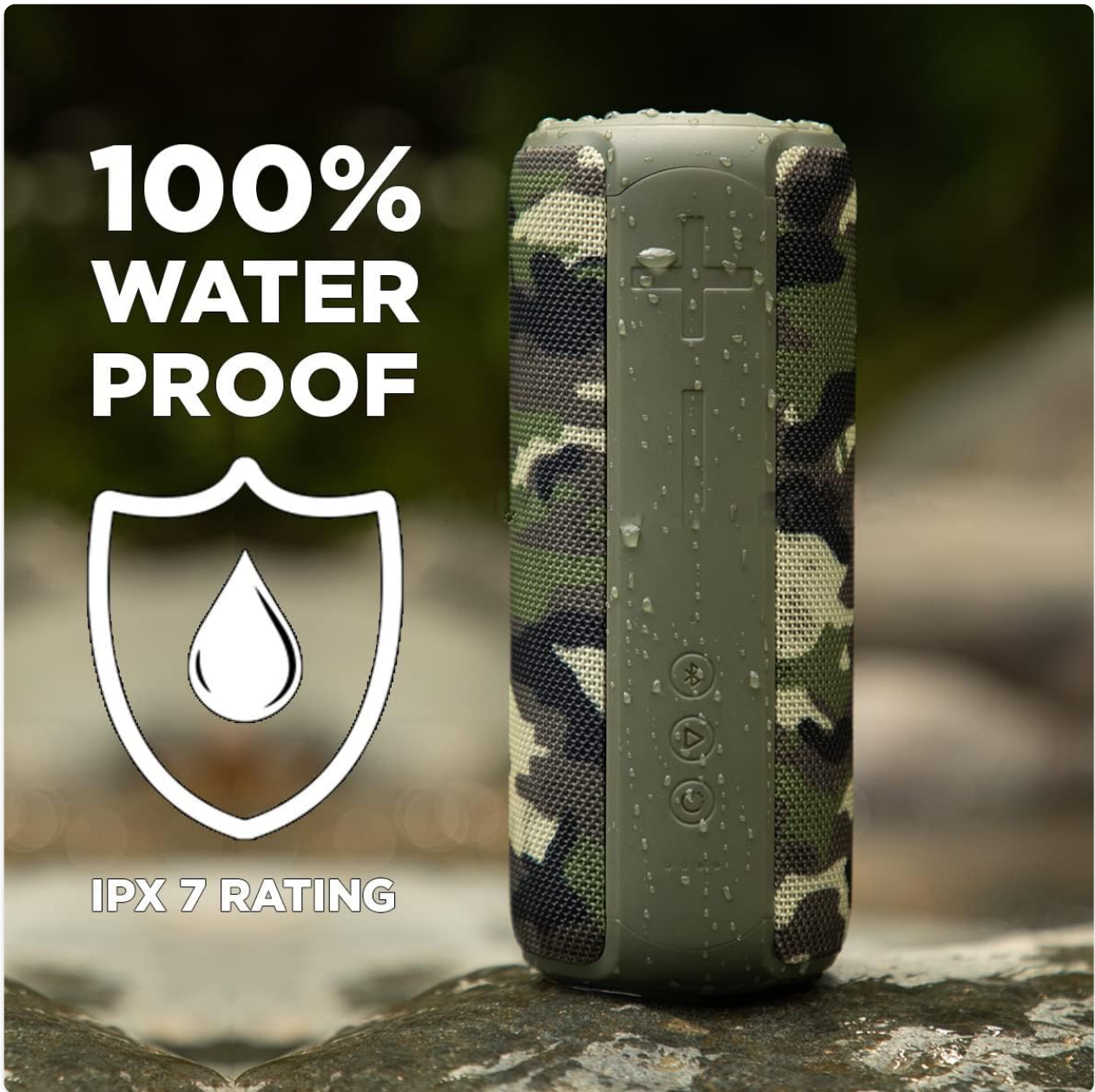
Figure 3: Waterproof Design. This image highlights the Sonitrek Go XL speaker's IPX7 waterproof rating, indicating its resistance to water immersion up to 1 meter for 30 minutes, making it ideal for outdoor and poolside use.