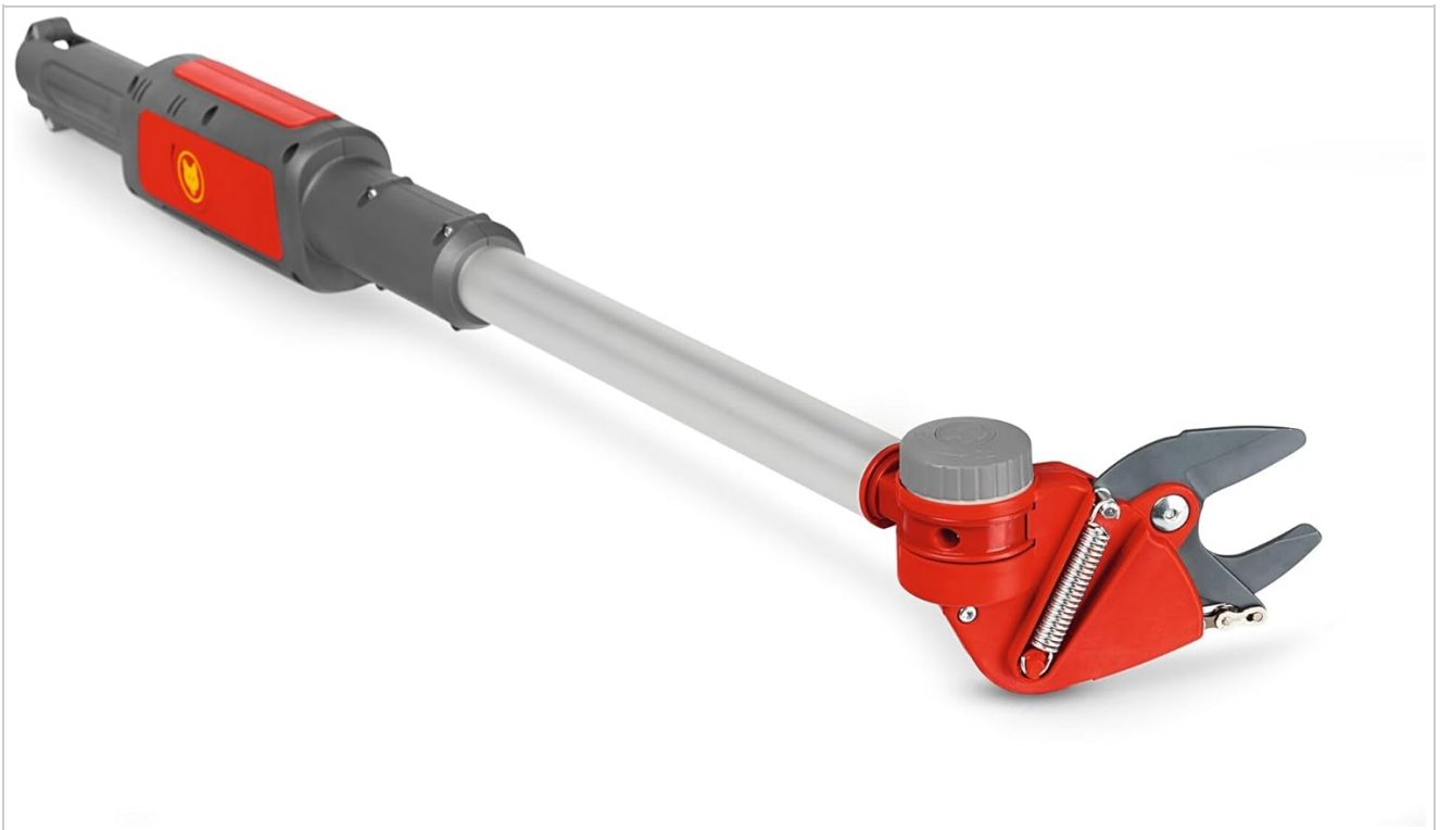
Image 1.1: The WOLF-Garten e-Multi-Star TL 32 Em Lopper, showcasing its design with the telescopic pole and cutting head.

This manual provides essential information for the safe and efficient use of your WOLF-Garten e-Multi-Star TL 32 Em Lopper. This tool is designed for pruning branches up to 32mm in diameter, featuring a 1-meter telescopic pole and a 225° swivel cutting head for extended reach and versatility. Please read these instructions carefully before initial operation and retain them for future reference.