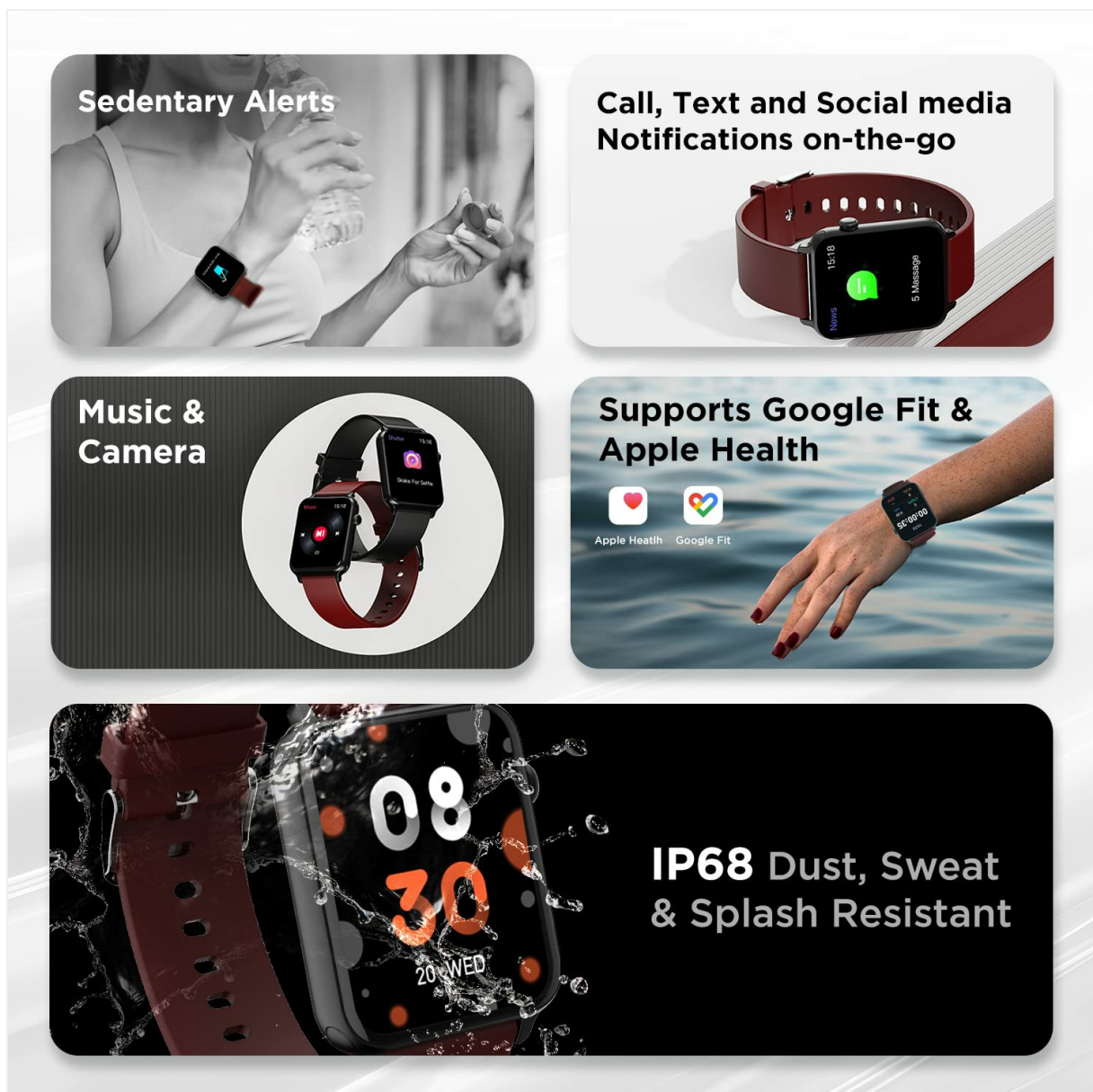
Image 6: The boAt Wave Lite Smart Watch displaying various smart features including notifications and app integrations.

Swipe right from the main screen to access all notifications. Turn this feature on from your app to receive notifications on your Watch Wave Lite. It will show 5 new notifications and automatically overwrite the last message if there are more than 5. Note: The watch can be used to reject calls, but cannot be used to answer calls or messages.