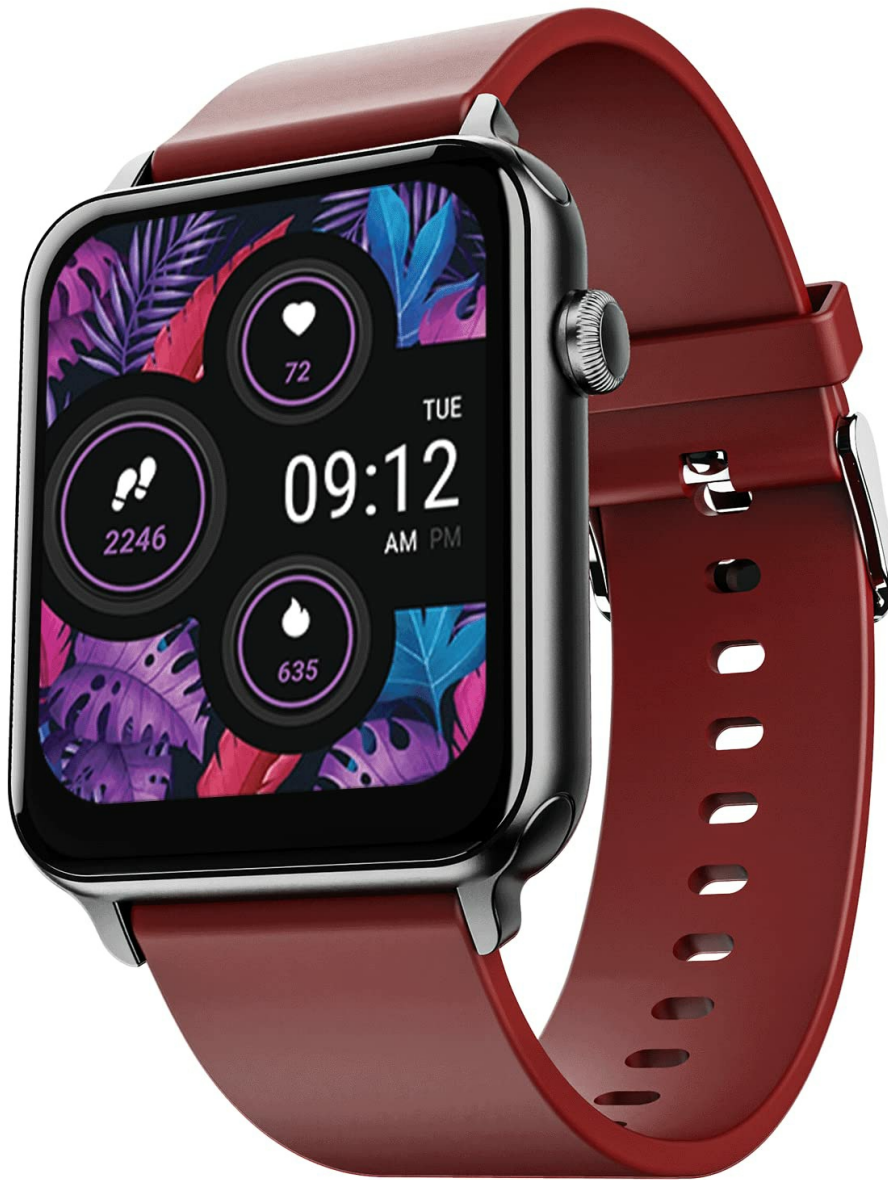
Image 1: boAt Wave Lite Smart Watch showcasing its 1.69-inch HD display with vibrant colors.