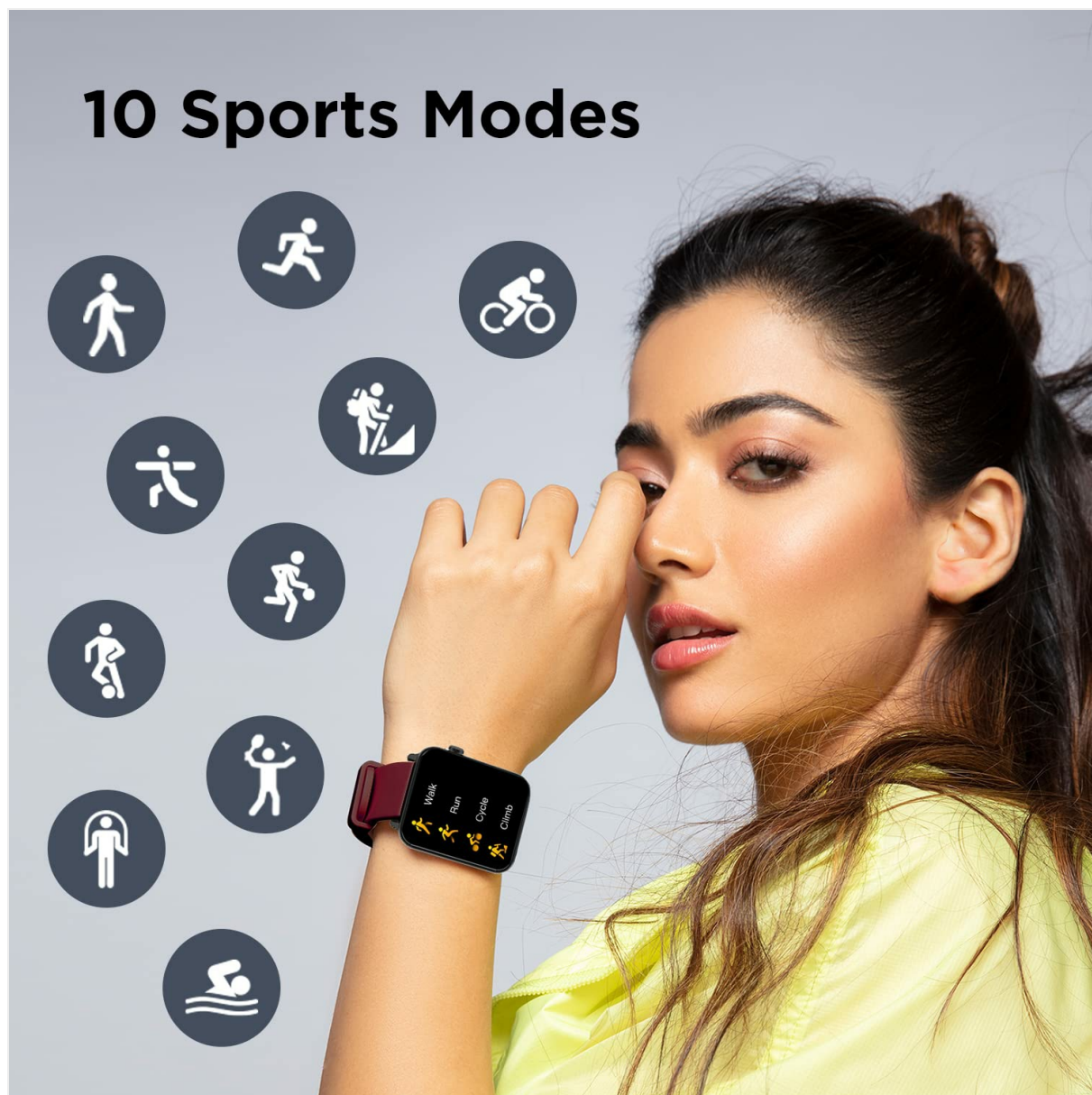
Image 4: The boAt Wave Lite Smart Watch displaying icons for its 10 different sports modes.

Click on the Sports mode icon to choose from 10 different sports modes: Walking, Running, Cycling, Climbing, Yoga, Basketball, Football, Badminton, Rope Skipping, and Swimming. To pause or stop the exercise, press the home button.