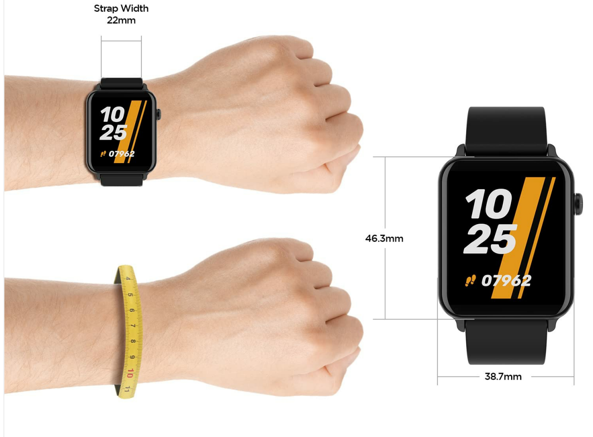
Image 7: Size chart illustrating the dimensions and strap width of the boAt Wave Lite Smart Watch.

Min Wrist Size: 2" | Max Wrist Size: 3.5"