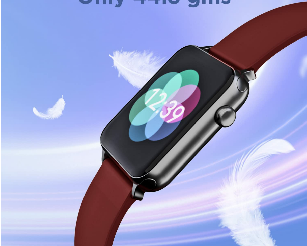
Image 5: The boAt Wave Lite Smart Watch showing various health tracking features including heart rate and SpO2 levels.