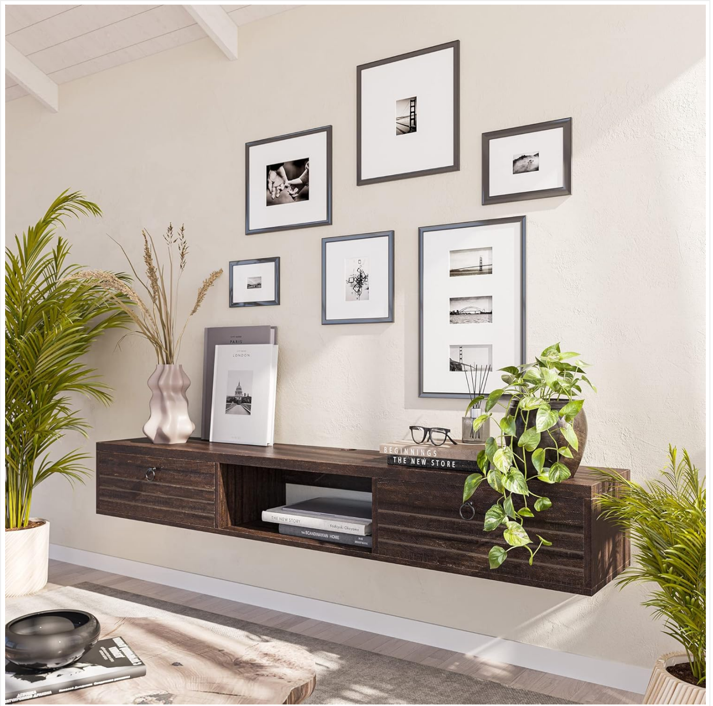
Image: The BELLEZE Modern Floating Wall Mounted TV Console in Espresso finish, showcasing its sleek design and wall-mounted installation.