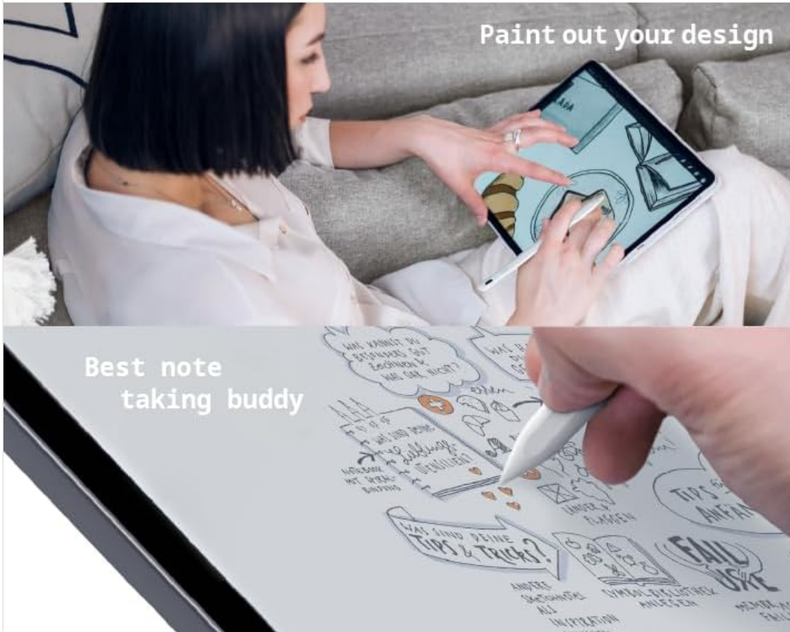
Image: Penoval AX Stylus Pixel Precision Accuracy. This image demonstrates the high pixel precision of the Penoval AX Stylus, showing it being used for detailed design work and as a reliable tool for note-taking on an iPad.