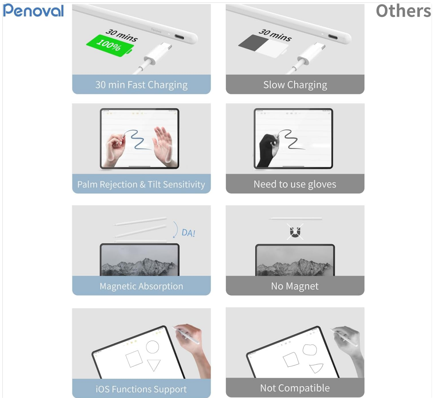
Image: Penoval AX Stylus Palm Rejection and Tilt Sensitivity. This image compares the Penoval AX Stylus with other styluses, highlighting its palm rejection and tilt sensitivity features. It shows a hand resting on the iPad screen while drawing, and the stylus creating varied line thicknesses with tilt.

The Penoval AX Stylus features palm rejection technology, allowing you to rest your hand naturally on the iPad screen while writing or drawing without causing unintended marks. This provides a comfortable and intuitive user experience.