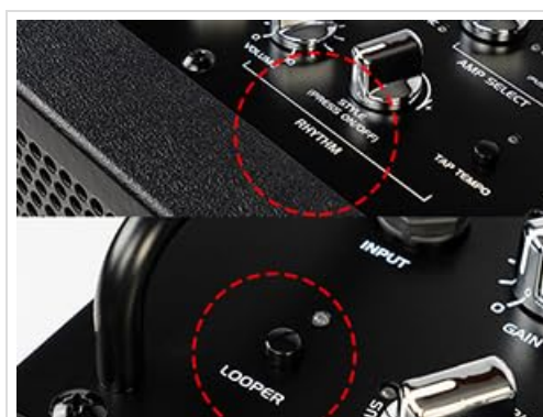
Figure 8: Rhythm and Looper Controls

The DC-15S features 36 drum patterns. Use the Rhythm knob to select a drum pattern and adjust its volume. The Tap Tempo button can be used to set the tempo of the drum patterns.