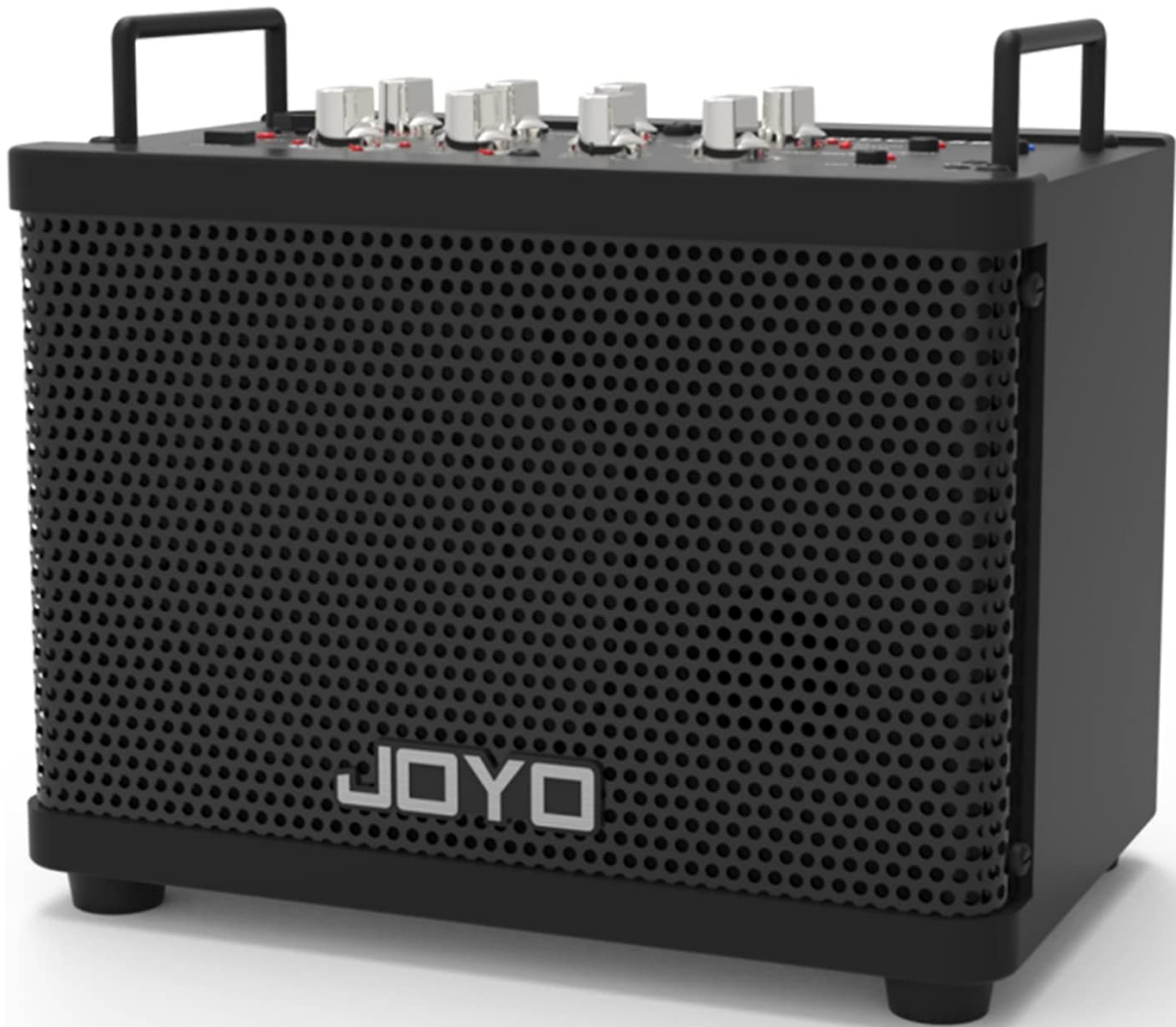
Figure 1: JOYO DC-15S Portable Digital Guitar Amplifier