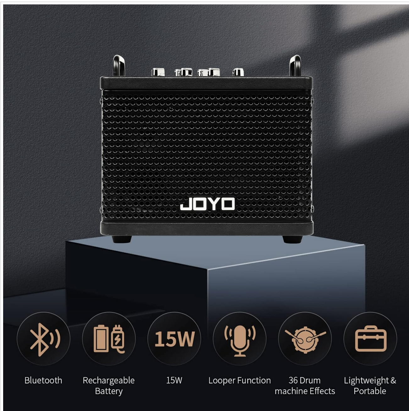
Figure 3: Connectivity and Portability