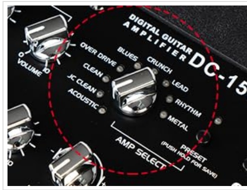
Figure 4: Amp Select Knob Detail