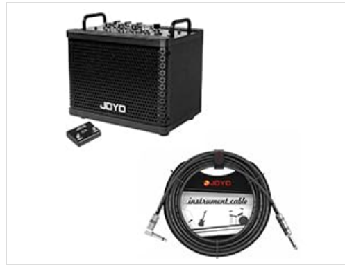
Figure 9: Footswitch in Use