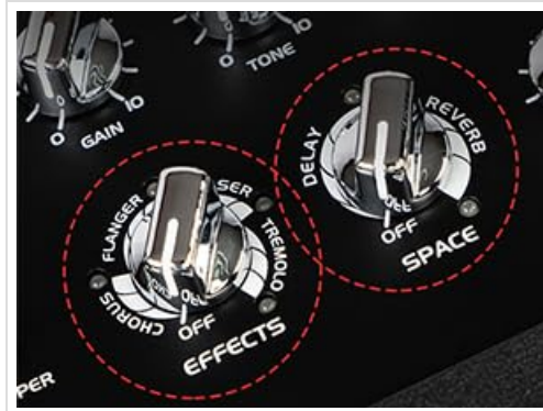
Figure 5: Effects and Space Knobs Detail