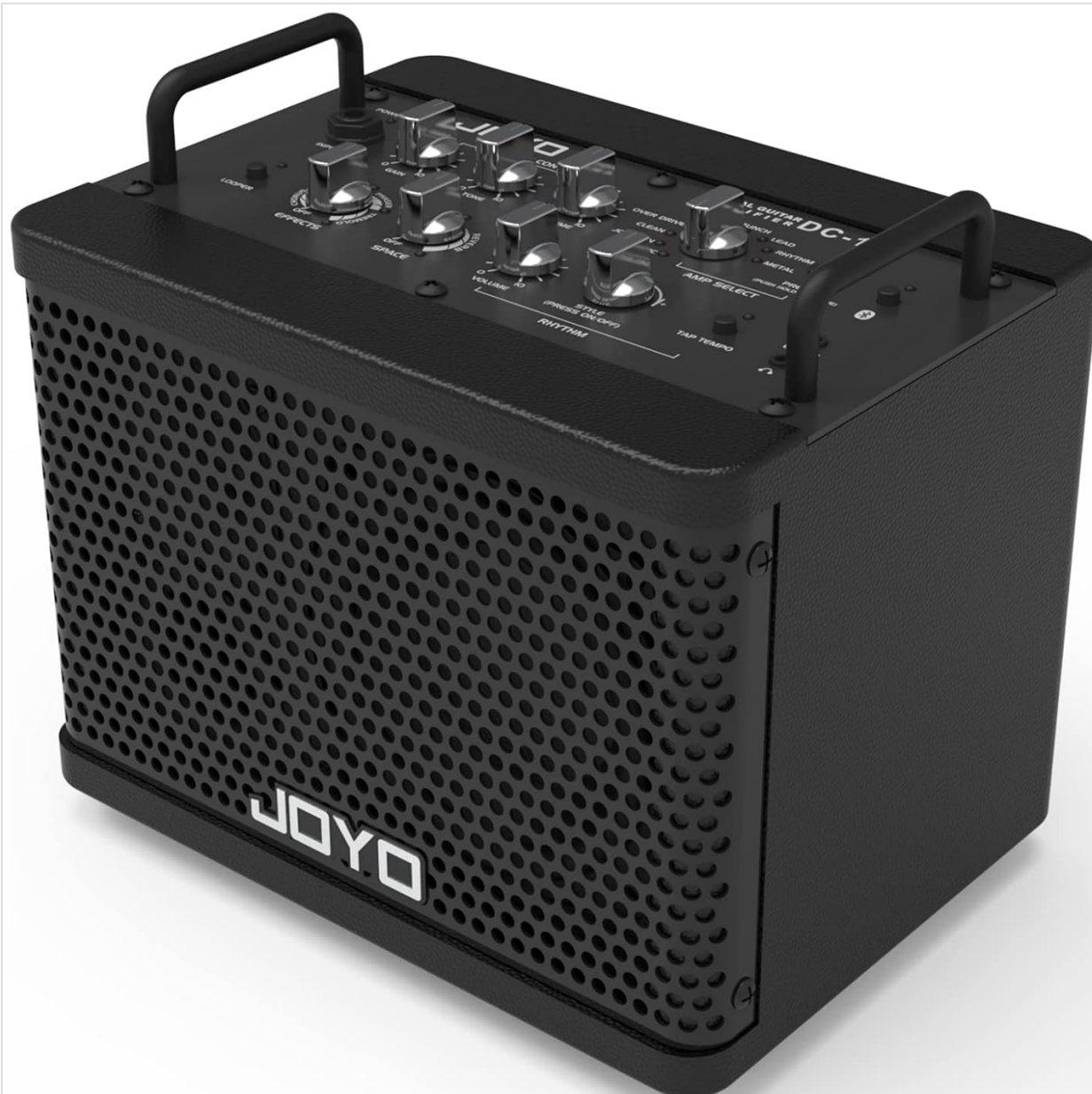
Figure 6: Amplifier Top Panel