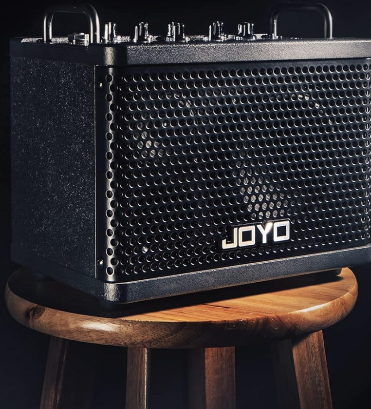
Figure 2: Amplifier Key Features