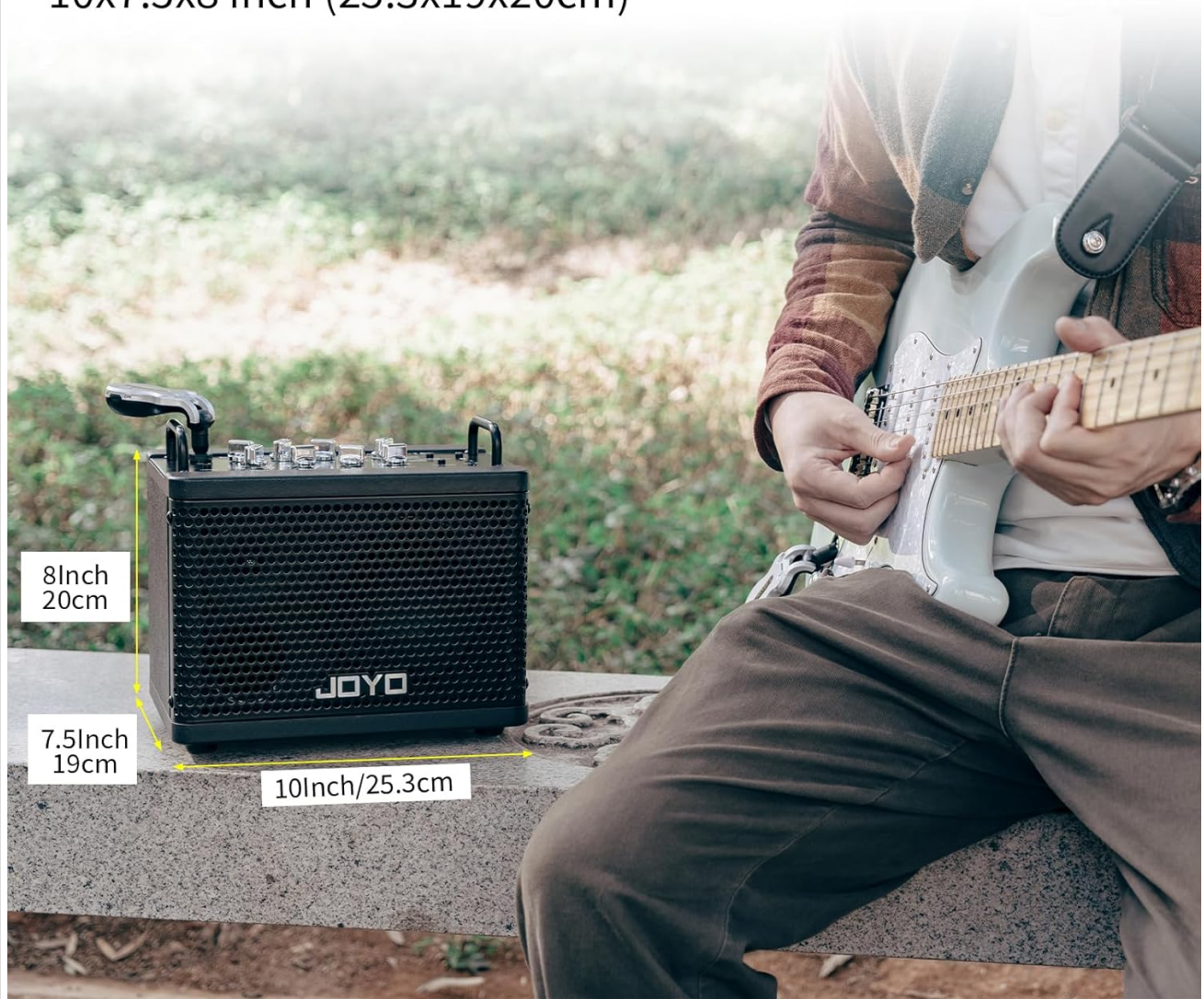
Figure 10: Amplifier Dimensions