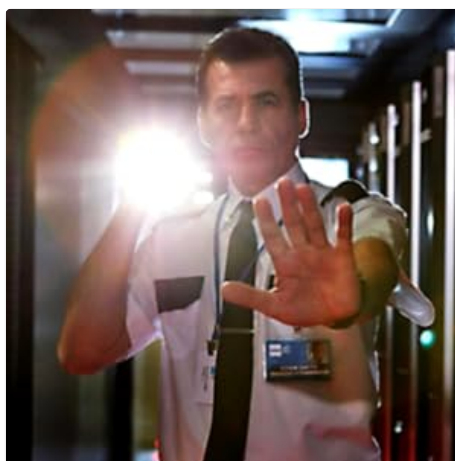
The one-touch strobe function provides immediate access to a disorienting flash, useful for self-defense or signaling.