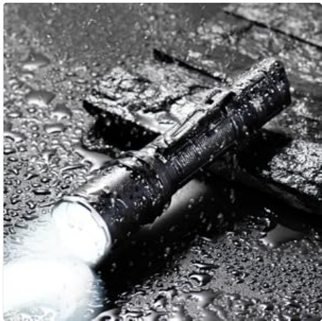
The XT11R is designed with IPX8 water resistance, allowing it to function reliably even in wet conditions.