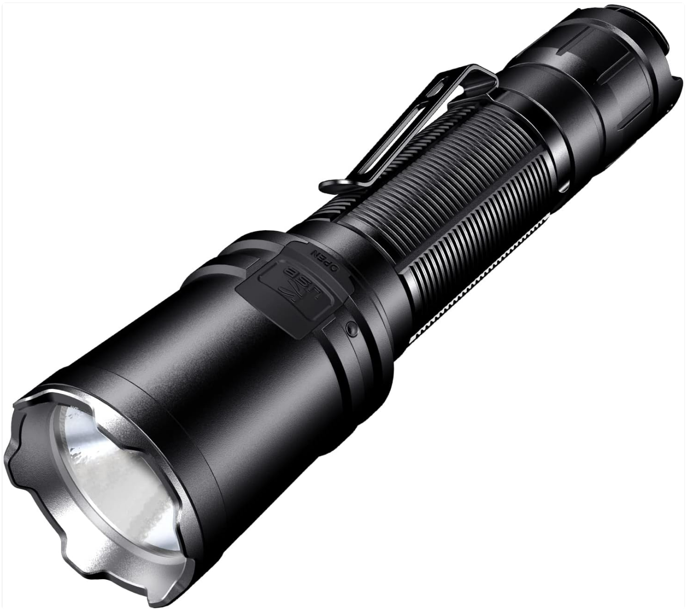
The Klarus XT11R tactical flashlight, showcasing its robust aluminum body and dual tail switches.