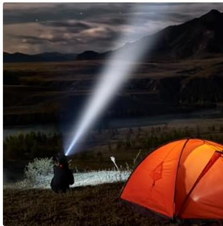
The powerful beam of the XT11R provides excellent visibility for outdoor activities like camping.