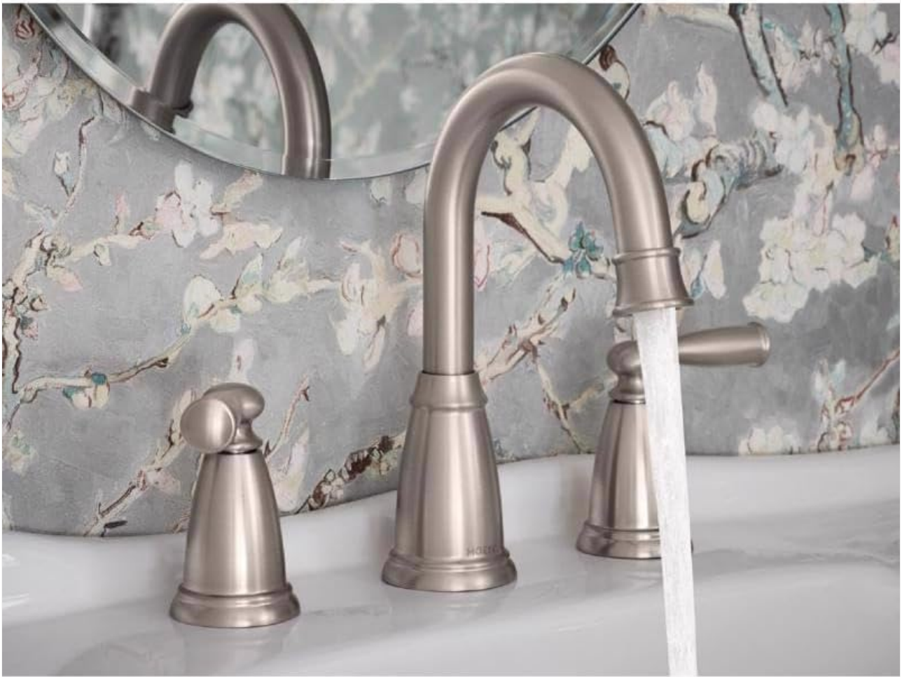
Image: The Moen Banbury faucet in operation, with water gracefully flowing from its high-arc spout into a sink.